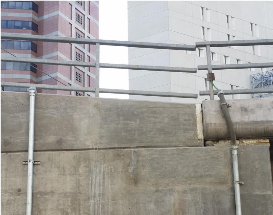
After Repair (September 23, 2014):