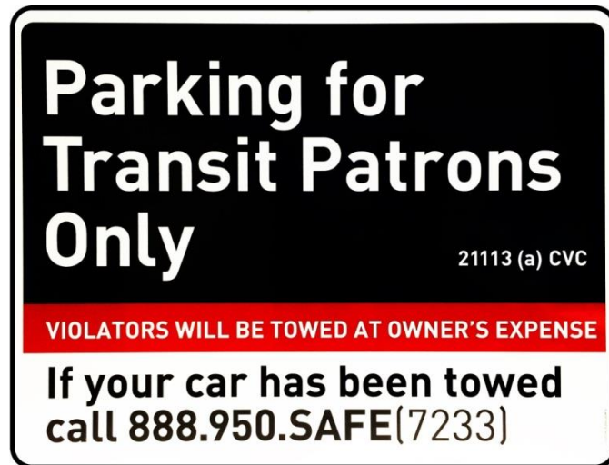
Sign Before Ordinance