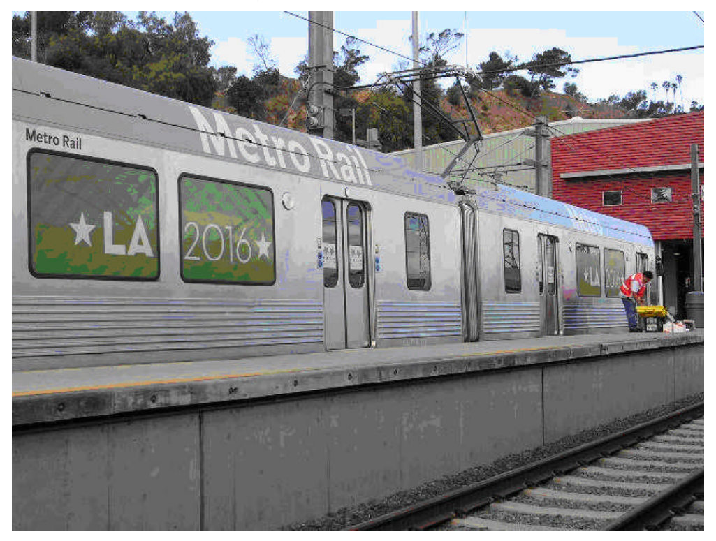
2550 LRV at Metro Gold Line Yard with Decals for LA Olympic Bid.