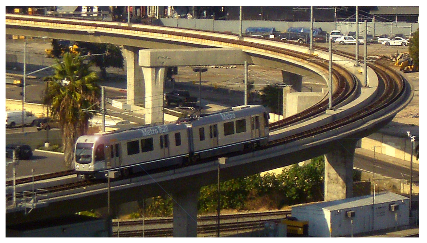
2550 LRV Coming Around the Curve into Union Station.