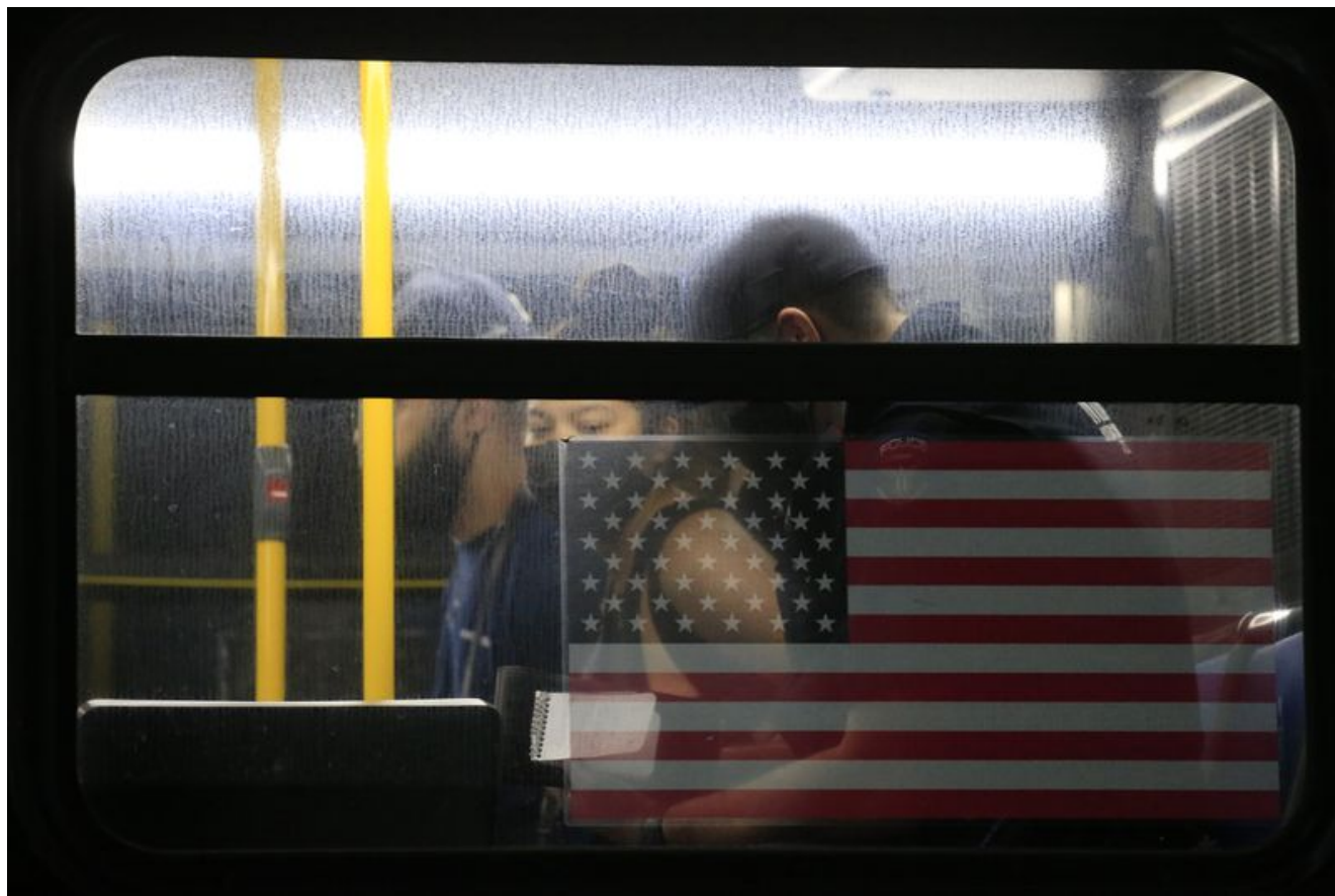
Activists are detained by the New York Police Department on an MTA bus as a rally is held in response to the police killing George Floyd in front of Barclays Center on May 29, in Brooklyn.