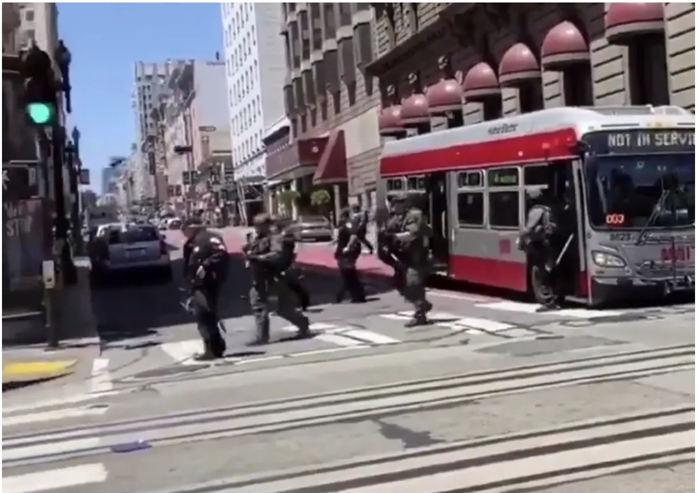
A still from a video posted June 1 of a chartered Muni bus offloading cops in riot gear.

“In regards to the tweet put out by the SFPOA, I'll refer you back to them,” he added.