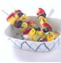
Great Grilling Ideas for Easy Home-Cooked Meals