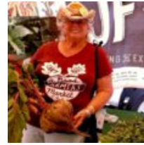
Pasadena Farmers' Market Celebrates 40th Anniversary