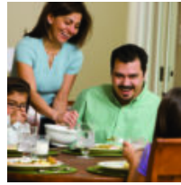
New Food Trends Can Save Time and Money