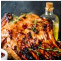
Robin is Back Grilling Up BBQ for Five Days