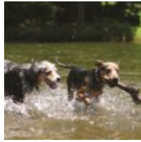
5 Tips to Reduce Your Pet's Environmental Pawprint