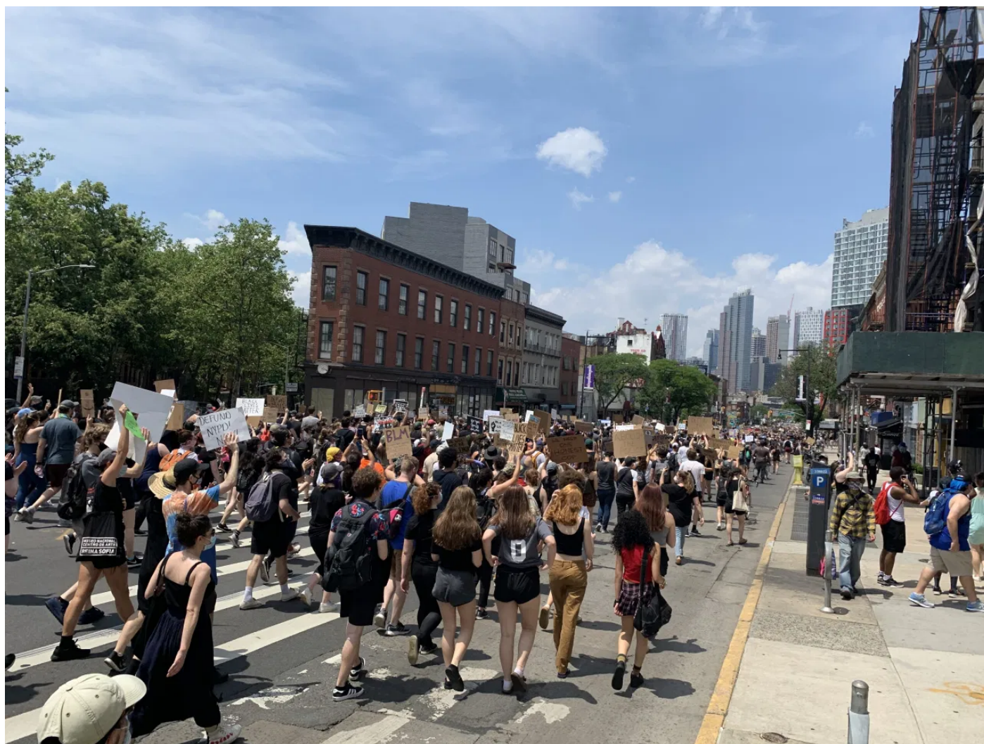
Protests on Flatbush in Brooklyn.

Advocacy organizations, donors, institutions, and governments should examine their procurement, hiring, board recruitment. Who sets the table? Who is speaking and what voices are lifted? Who receives opportunities for jobs, business and funding? In short, how are you spending your dollars? Ensure that your actions align with your values and messages.