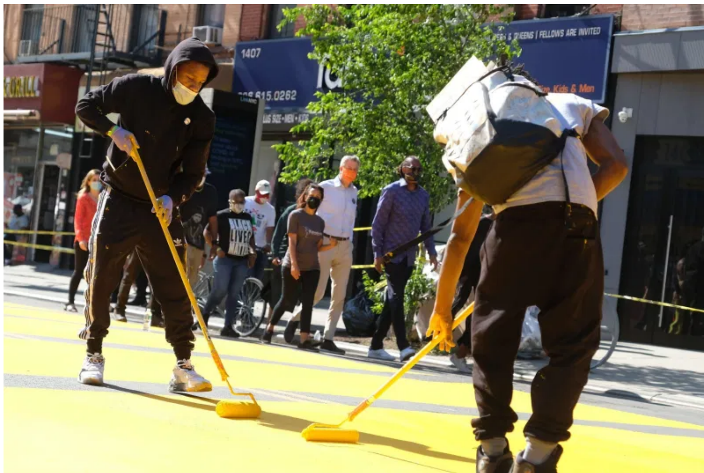
Artists paint a "Black Lives Matter" mural on Fulton Street in Brooklyn, in front of Restoration Plaza.

By Tracey Capers | Jul 1, 2020 | 4 COMMENTS