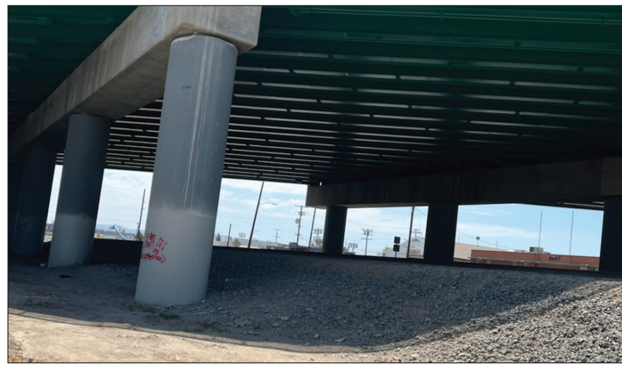
FF-17: I-5 North Lanes South of Tuxford Street