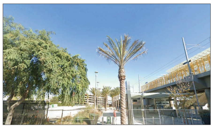
NFF-17: Century Boulevard, 152 feet West of Aviation Boulevard