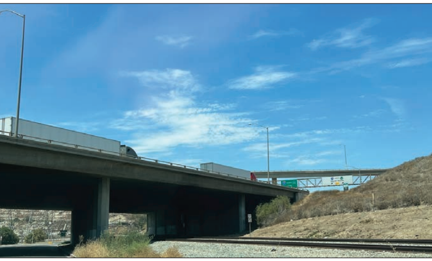
FF-22: I-5 North Lanes at San Fernando Road