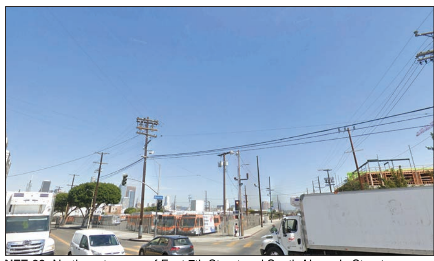
NFF-22: Northwest corner of East 7th Street and South Alameda Street

Street View - Non-Freeway Facing Site Location No. 21 through Non-Freeway Facing Site Location No. 22