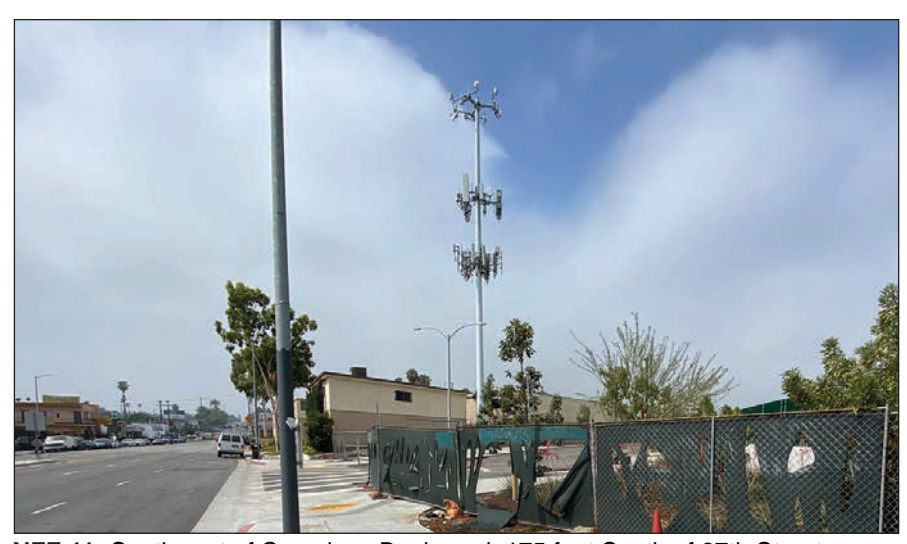
NFF-11: Southwest of Crenshaw Boulevard, 175 feet South of 67th Street