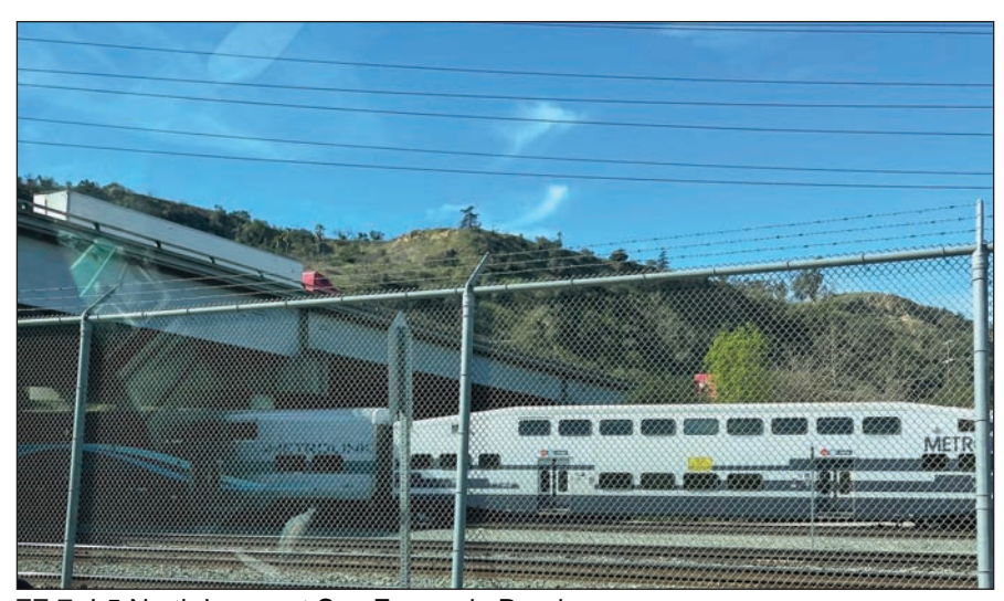
FF-7: I-5 North Lanes at San Fernando Road