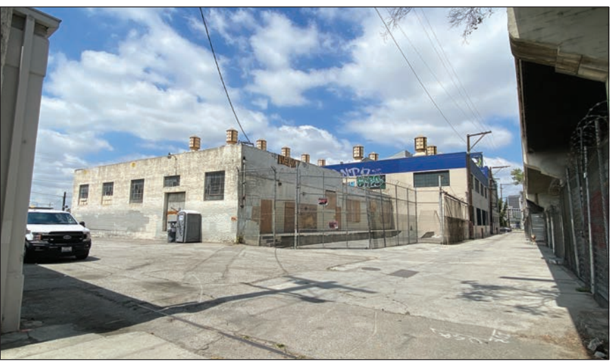
FF-2: US-101 South Lanes at Center Street