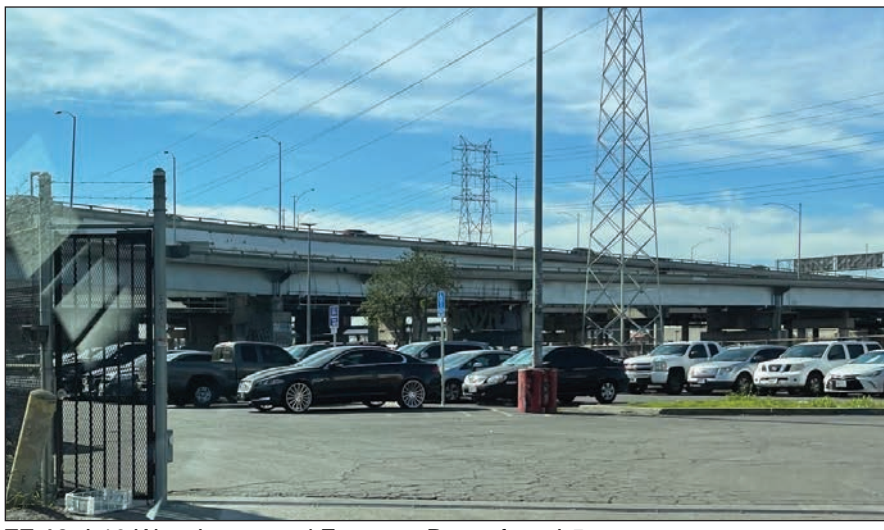
FF-10: I-10 West Lanes and Entrance Ramp from I-5