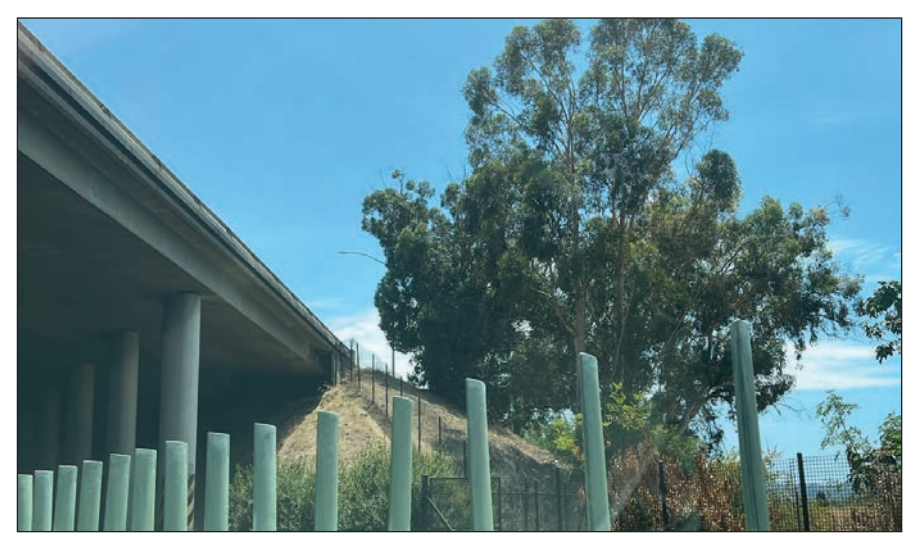
FF-25: I-405 South Lanes at Victory Boulevard