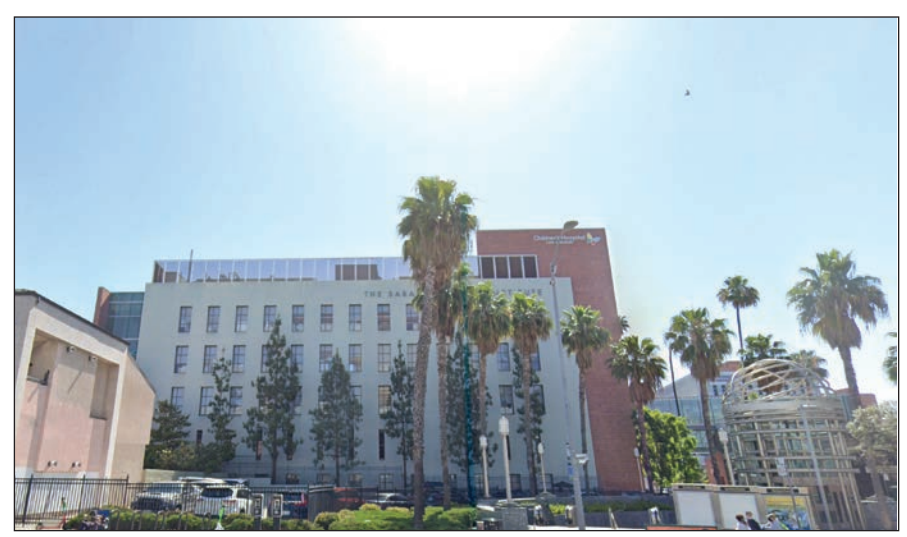
NFF-1: Northeast corner of Vermont Avenue and Sunset Boulevard