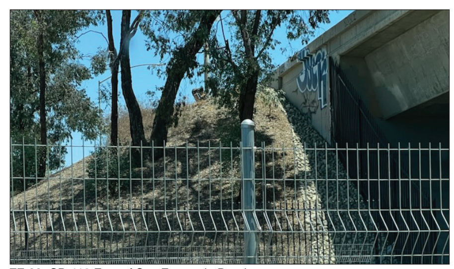
FF-20: SR-118 East of San Fernando Road

Street View - Freeway Facing Site Location No. 17 through Freeway Facing Site Location No. 20