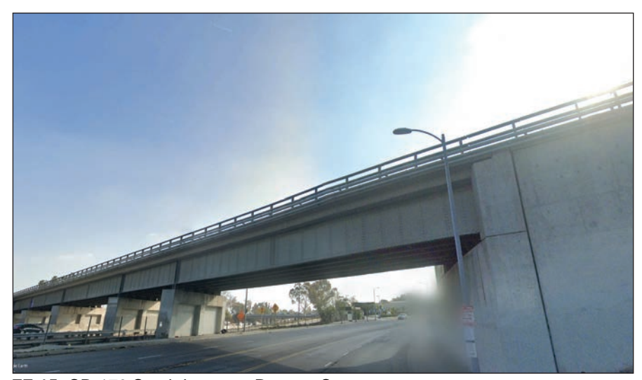
FF-15: SR-170 South Lanes at Raymer Street