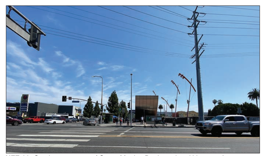
NFF-20: Southwest corner of Santa Monica Boulevard and Vermont Avenue

Street View - Non-Freeway Facing Site Location No. 17 through Non-Freeway Facing Site Location No. 20