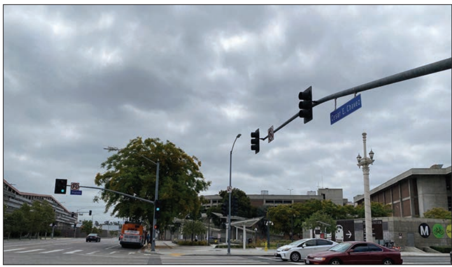
NFF-13: Southeast corner of East Cesar Chavez Avenue and North Vignes Street