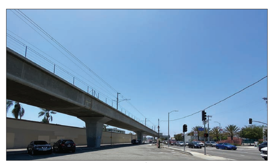
NFF-15: Pico Boulevard, 445 feet West of Sawtelle Boulevard