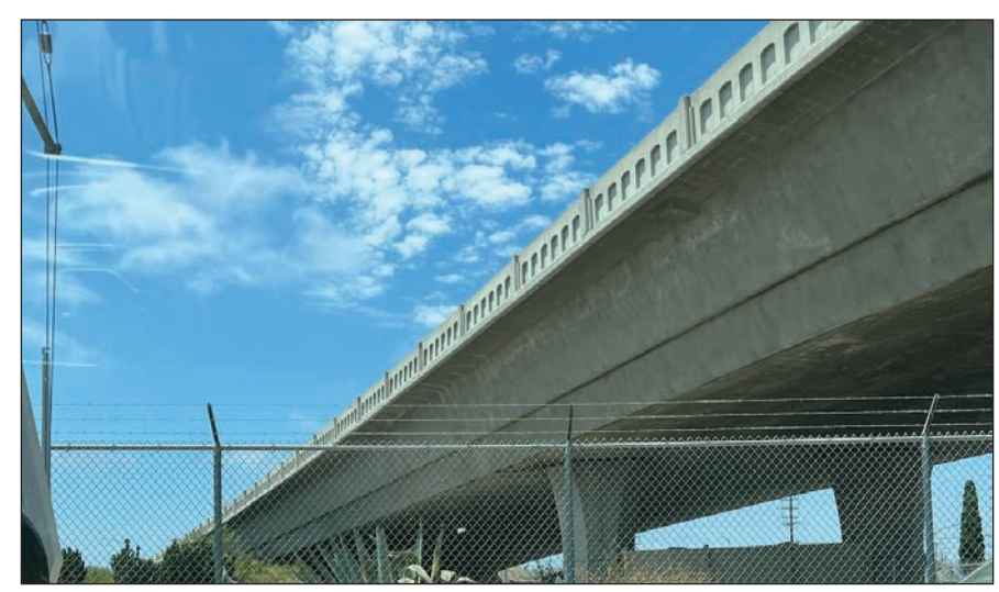
FF-29: SR-90 East at Culver Boulevard