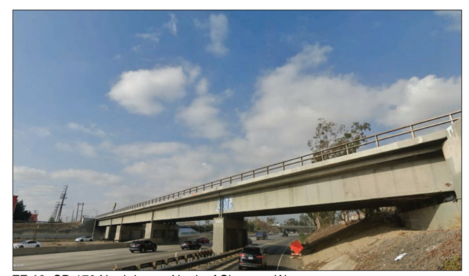
FF-16: SR-170 North Lanes North of Sherman Way

Street View - Freeway Facing Site Location No. 13 through Freeway Facing Site Location No. 16