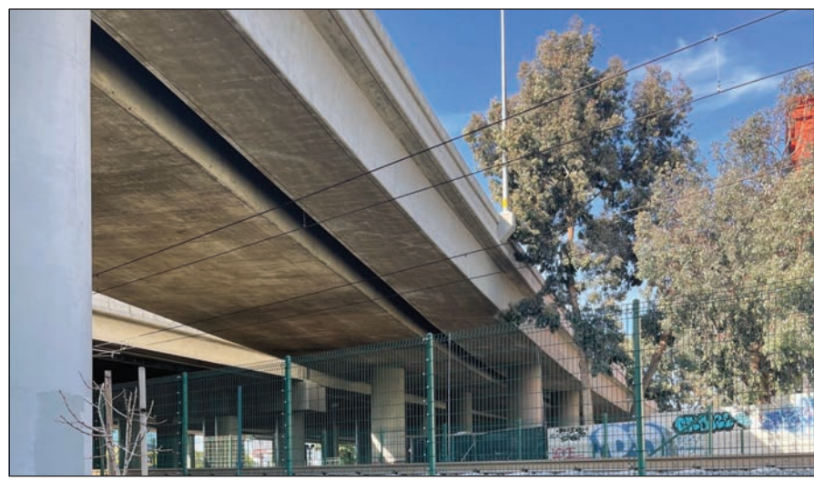
FF-26: I-405 North Lanes at Exposition Boulevard