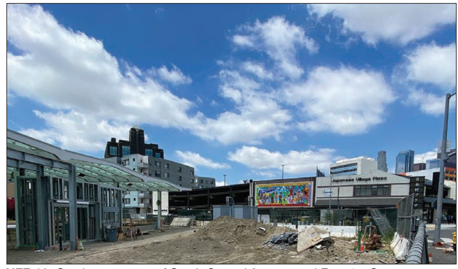
NFF-16: Southeast corner of South Central Avenue and East 1st Street

Street View - Non-Freeway Facing Site Location No. 13 through Non-Freeway Facing Site Location No. 16