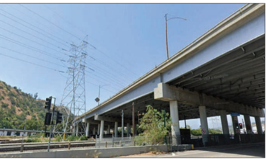
FF-6: I-5 South Lanes at North Avenue 19