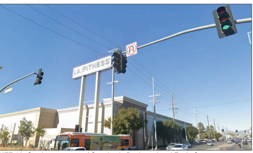
NFF-10: Southeast corner of Sepulveda Boulevard and Erwin Street