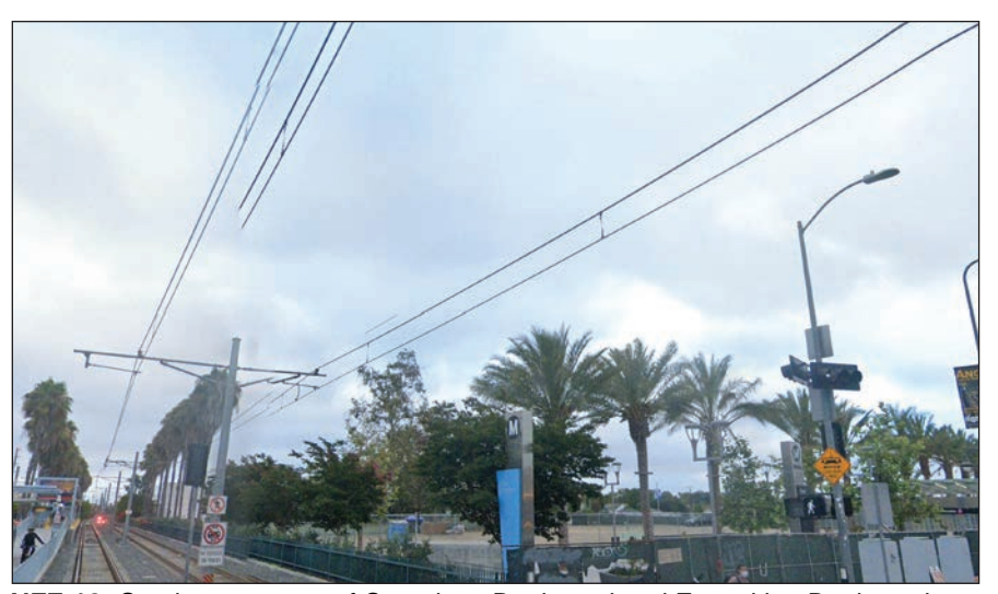
NFF-12: Southeast corner of Crenshaw Boulevard and Exposition Boulevard

Street View - Non-Freeway Facing Site Location No. 9 through Non-Freeway Facing Site Location No. 12