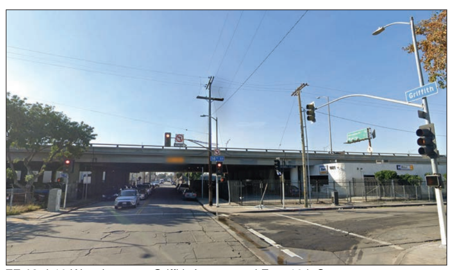
FF-12: I-10 West Lanes at Griffith Avenue and East 16th Street

Street View - Freeway Facing Site Location No. 9 through Freeway Facing Site Location No. 12