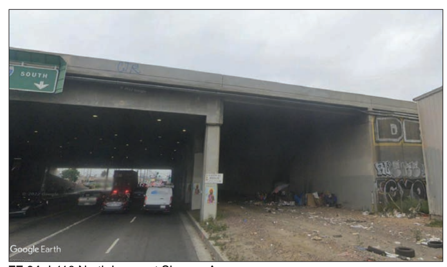
FF-34: I-110 North Lanes at Slauson Avenue

Street View - Freeway Facing Site Location No. 33 through Freeway Facing Site Location No. 34