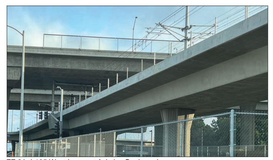
FF-31: I-105 West Lanes at Aviation Boulevard