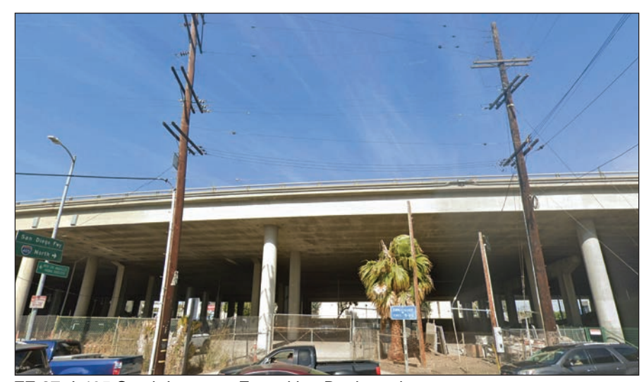
FF-27: I-405 South Lanes at Exposition Boulevard