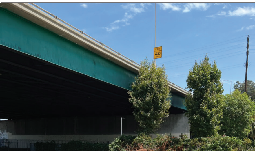
FF-14: SR-2 North Lanes Northeast of Casitas Avenue