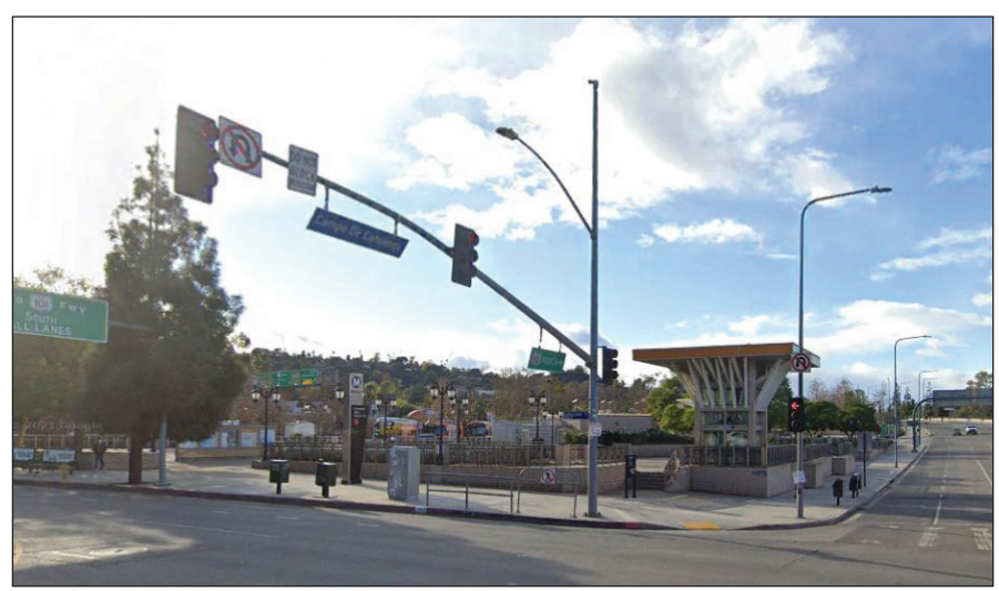
NFF-5: Southwest corner of Lankershim Boulevard and Universal Hollywood Drive