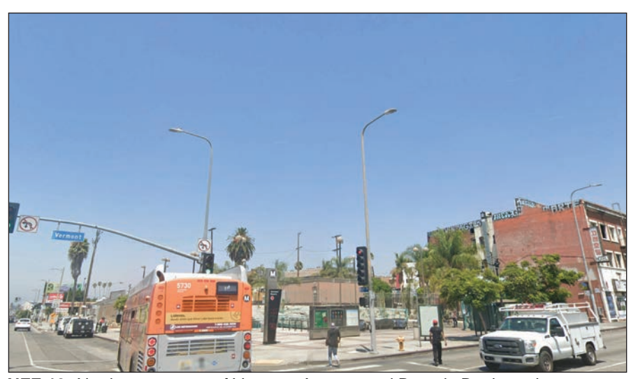
NFF-19: Northwest corner of Vermont Avenue and Beverly Boulevard