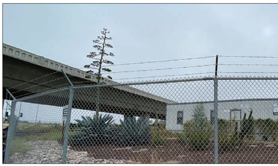
FF-30: SR-90 West at Culver Boulevard