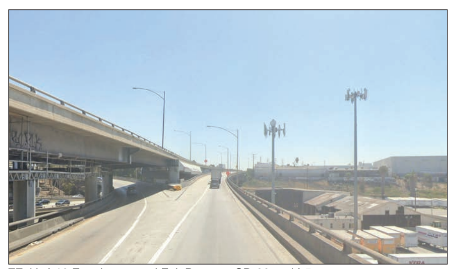
FF-11: I-10 East Lanes and Exit Ramp to SR-60 and I-5