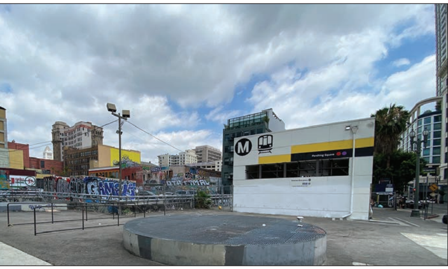
NFF-6: Southwest corner of 4th Street and Hill Street