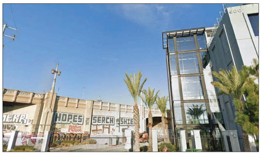
NFF-21: South of 4th Street 210 feet East of South Santa Fe Avenue