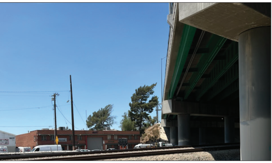
FF-18: I-5 South Lanes South of Tuxford Street