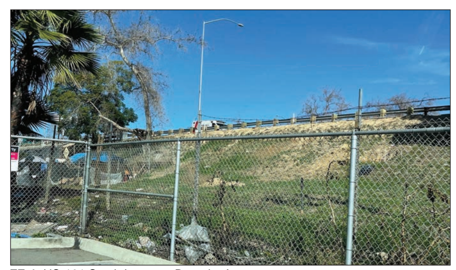
FF-4: US-101 South Lanes at Beaudry Avenue

Street View - Freeway Facing Site Location No. 1 through Freeway Facing Site Location No. 4