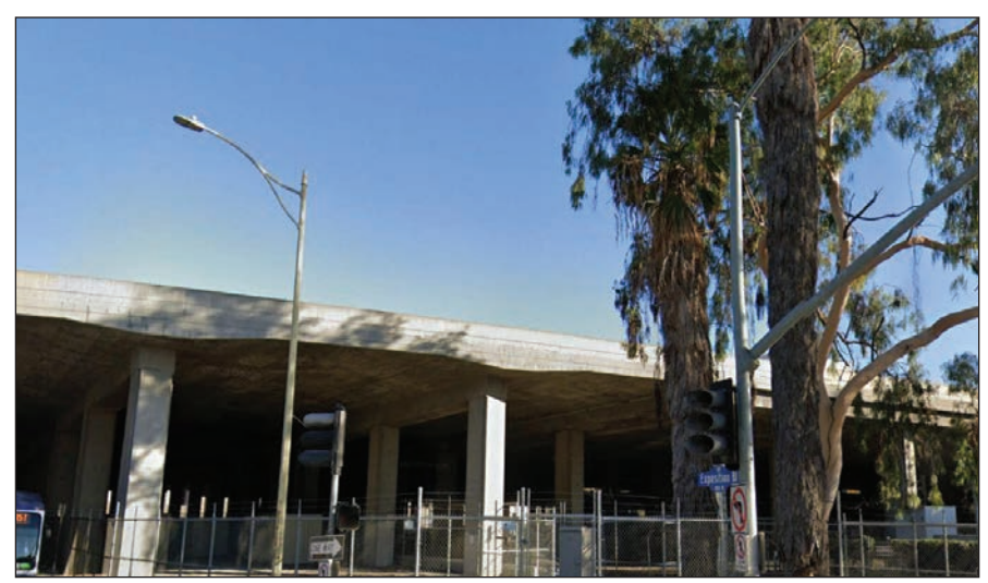
FF-21: I-110 South Lanes at Exposition Boulevard