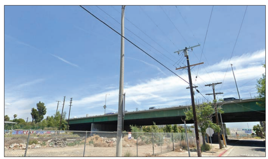
FF-13: SR-2 South Lanes Northeast of Casitas Avenue