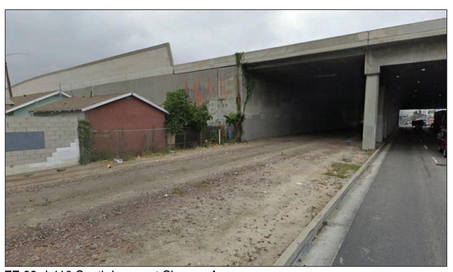
FF-33: I-110 South Lanes at Slauson Avenue