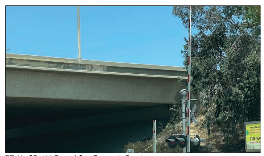
FF-19: SR-118 East of San Fernando Road