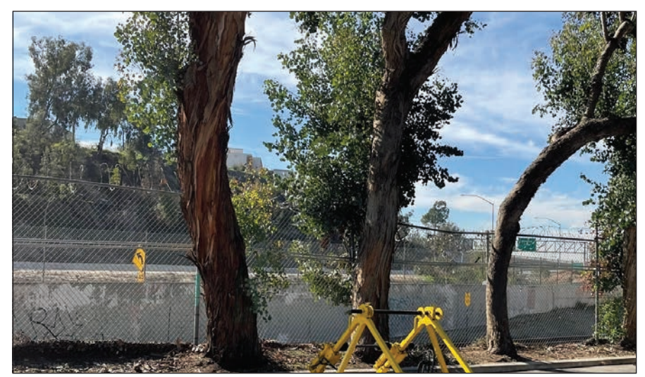
FF-9: I-10 West Lanes (Bus Yard)