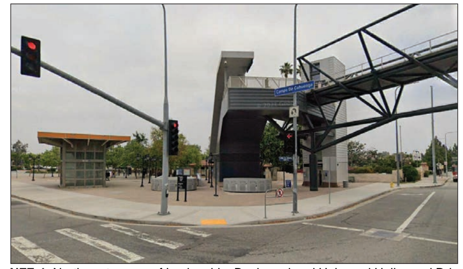
NFF-4: Northwest corner of Lankershim Boulevard and Universal Hollywood Drive

Street View - Non-Freeway Facing Site Location No. 1 through Non-Freeway Facing Site Location No. 4