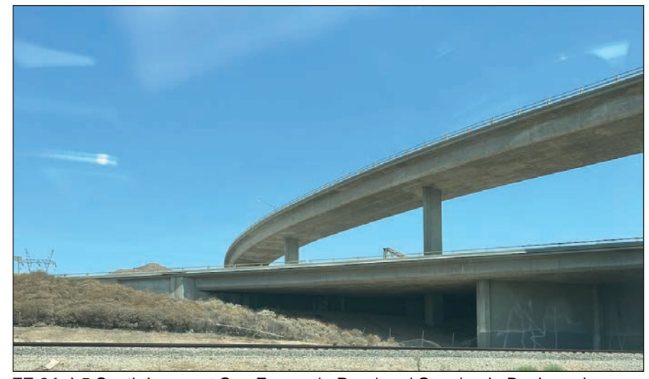
FF-24: I-5 South Lanes at San Fernando Road and Sepulveda Boulevard

Street View - Freeway Facing Site Location No. 21 through Freeway Facing Site Location No. 24