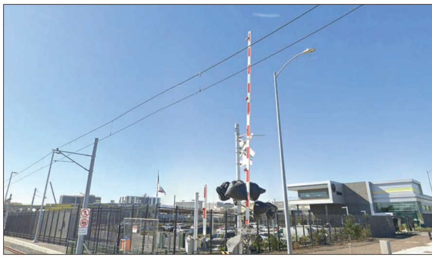
NFF-18: Southwest Aviation Boulevard and South of Arbor Vitae Street