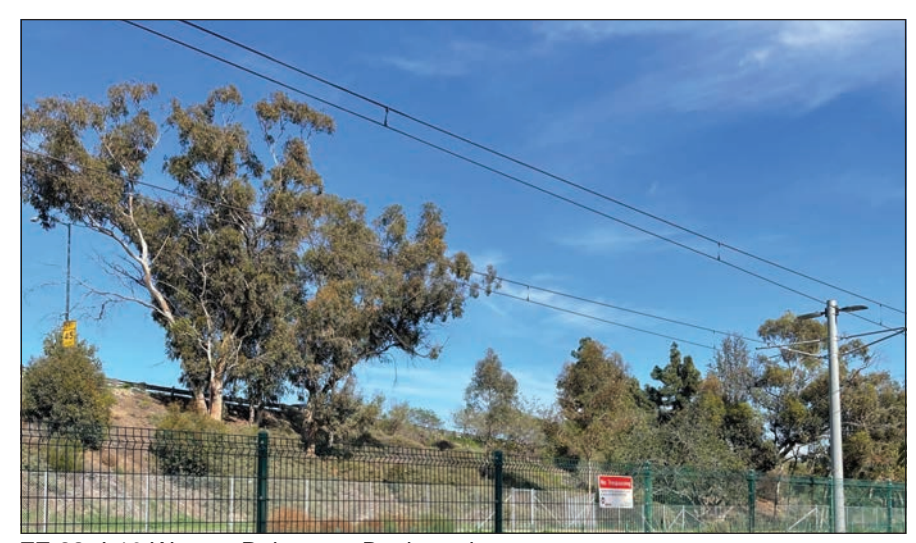
FF-28: I-10 West at Robertson Boulevard

Street View - Freeway Facing Site Location No. 25 through Freeway Facing Site Location No. 28