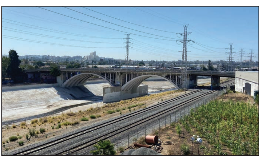
NFF-2: Spring Street Bridge, 326 feet North of Aurora Street