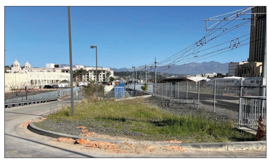
FF-1: US-101 North Lanes at Union Station