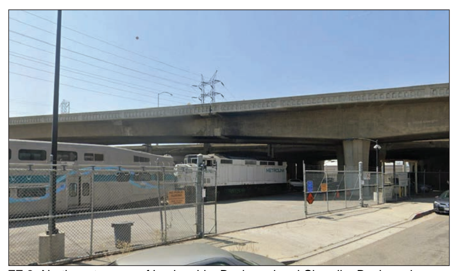
FF-3: Northwest corner of Lankershim Boulevard and Chandler Boulevard