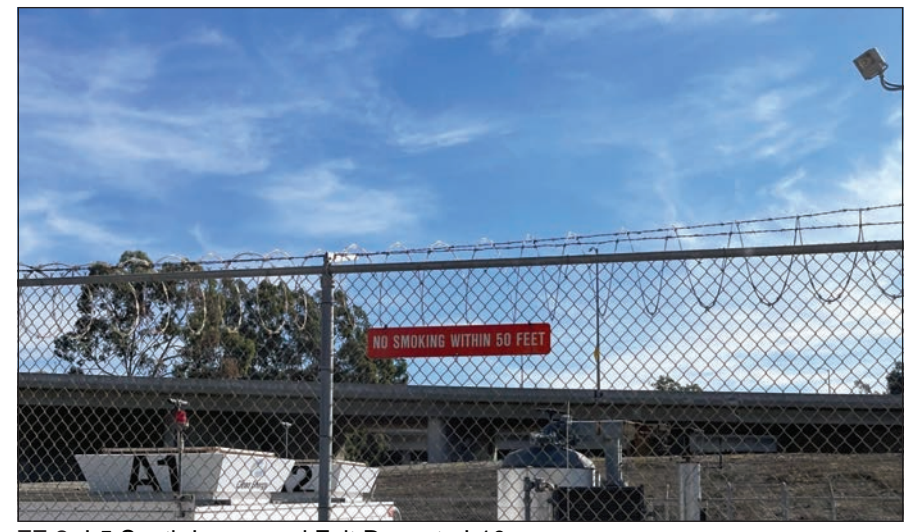
FF-8: I-5 South Lanes and Exit Ramp to I-10

Street View - Freeway Facing Site Location No. 5 through Freeway Facing Site Location No. 8