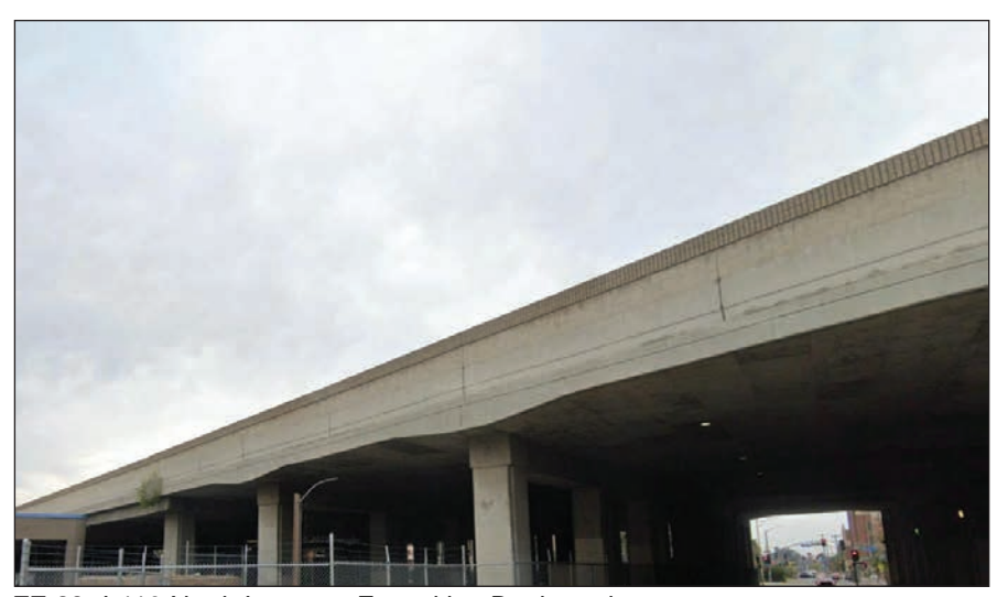
FF-23: I-110 North Lanes at Exposition Boulevard