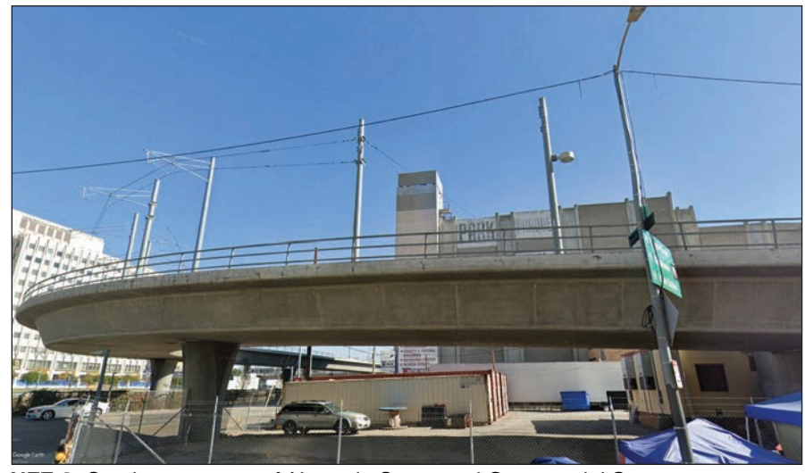
NFF-8: Southeast corner of Alameda Street and Commercial Street

Street View - Non-Freeway Facing Site Location No. 5 through Non-Freeway Facing Site