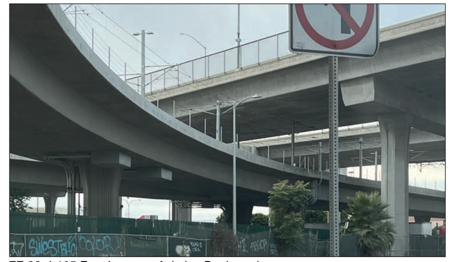
FF-32: I-105 East Lanes at Aviation Boulevard

Street View - Freeway Facing Site Location No. 29 through Freeway Facing Site Location No. 32