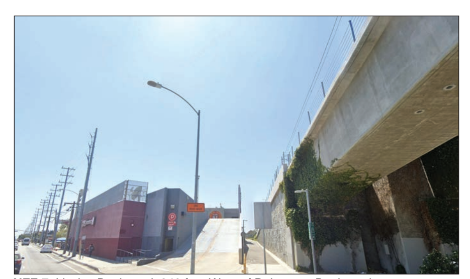
NFF-7: Venice Boulevard, 240 feet West of Robertson Boulevard