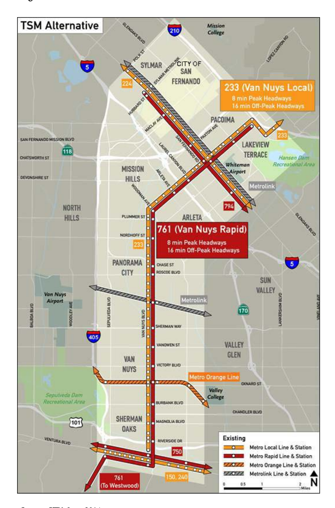
Figure 1-1: TSM Alternative