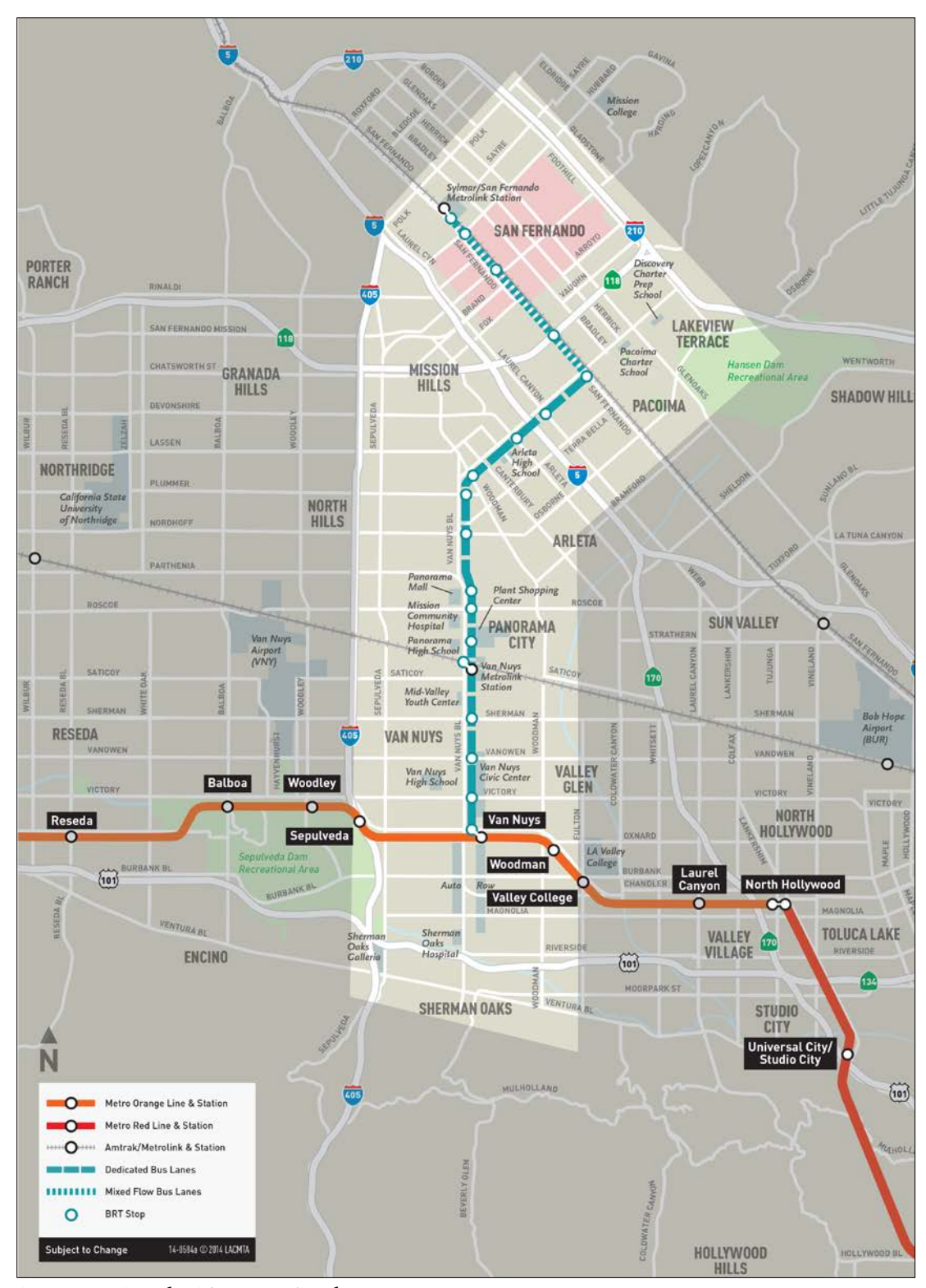
Figure 1-2: Build Alternative 1 – Curb-Running BRT Alternative

Source: KOA and ICF International, 2014.