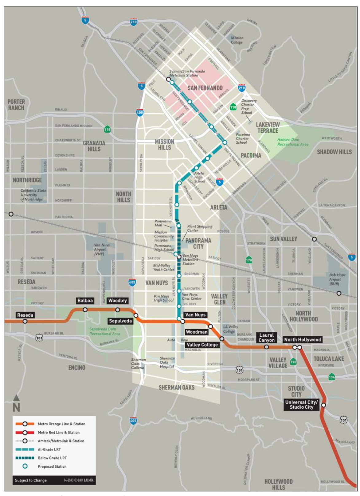
Figure 1-5: Build Alternative 4 – LRT Alternative