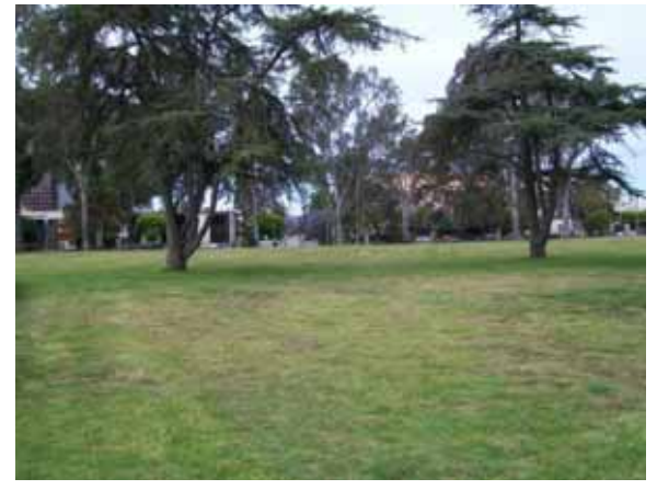
Photograph 6-2. VA Center landscape north of Wilshire Boulevard near San Vicente Boulevard (view to south)

The most extensive softscape amenable to pedestrian survey within the supplemental coverage area is located within the Veterans Administration (VA) Medical Center (now called the Greater Los Angeles Healthcare System-West Los Angeles Medical Center). The center is located in a park-like setting, and an established landscape is a distinctive feature of the historic fabric of the VA Medical Center Historic District (P-19-173043). Extensive manicured lawns with mature trees are present west of Bonsall Avenue both north and south of Wilshire Boulevard. The areas around the mature trees were examined closely for the presence of archaeological resources. Between the landscaping and hardscape, there was little visible ground disturbance within the grounds of the VA Center. (For additional information on the NRHP-eligible district, see the companion study for the Architectural APE; Cogstone 2012).