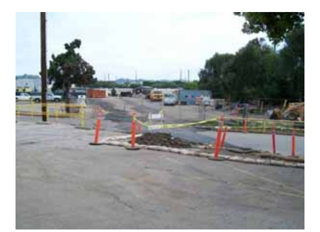
Photograph 6-1. VA Center hardscape north of Wilshire Boulevard and west of San Diego Freeway (view to east)