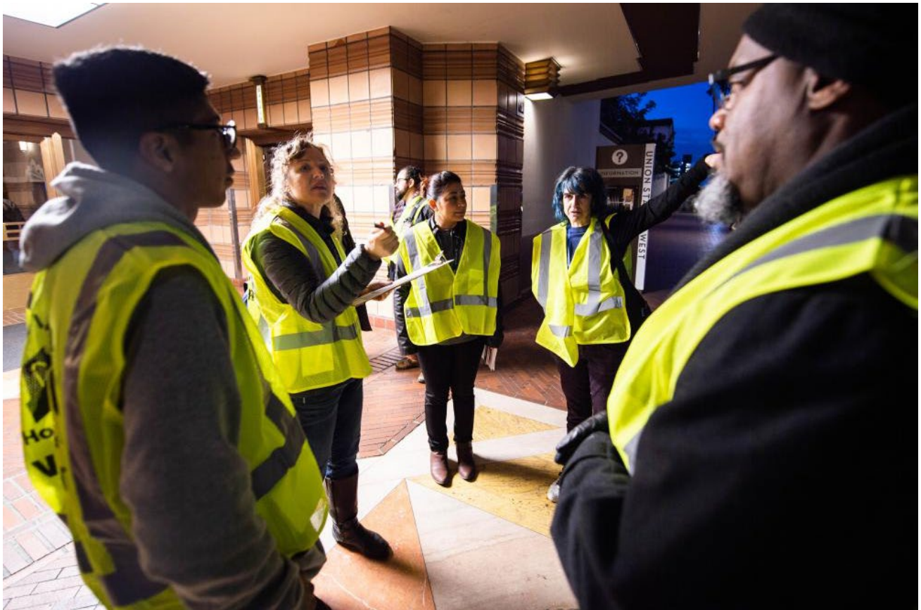
Safety 1st for our Neighboring School