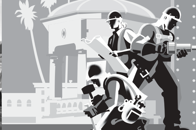
Artist Paul Rogers' illustration of the Metro Gold Line Eastside Extension.