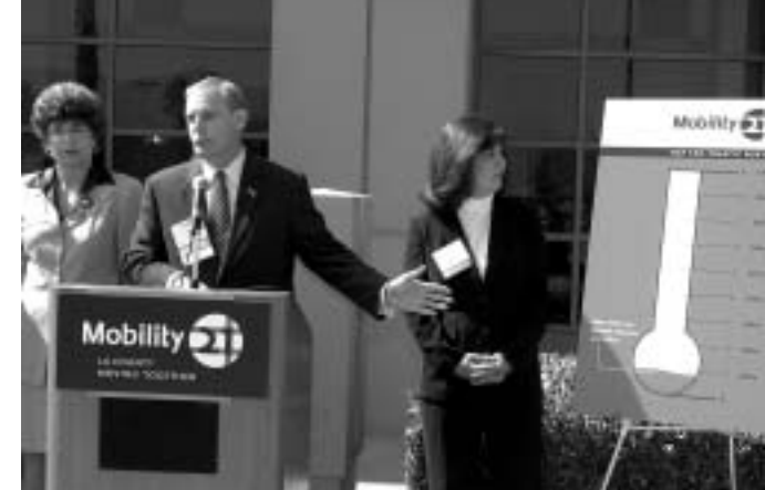
Metro CEO Roger Snoble presents the “Top Ten Traffic Busters” at the Mobility 21 transportation summit.

Metro has added 75 new buses in addition to 100 high-capacity 45-foot and 30 60-foot buses currently on order. With Metro now buying buses that have more capacity, they will have increased the number of seats in the Metro Bus fleet by 10 percent. MN