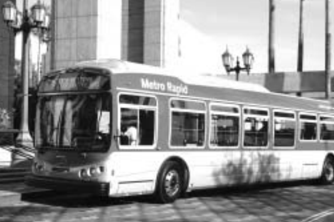
This new Metro Rapid bus is five feet longer and seats six more passengers than a standard transit bus.