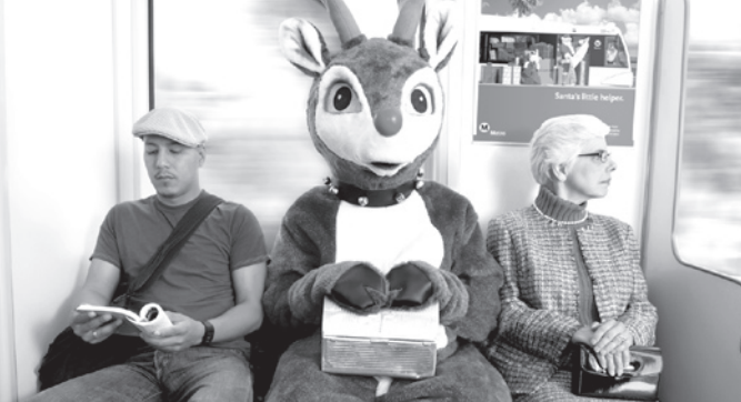
Take a break this holiday season and let Metro ease your hectic schedule.