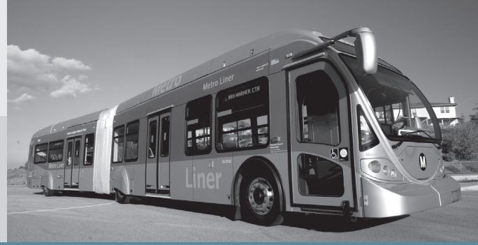
The new Metro Liner is the first of 200 articulated transit vehicles being built.