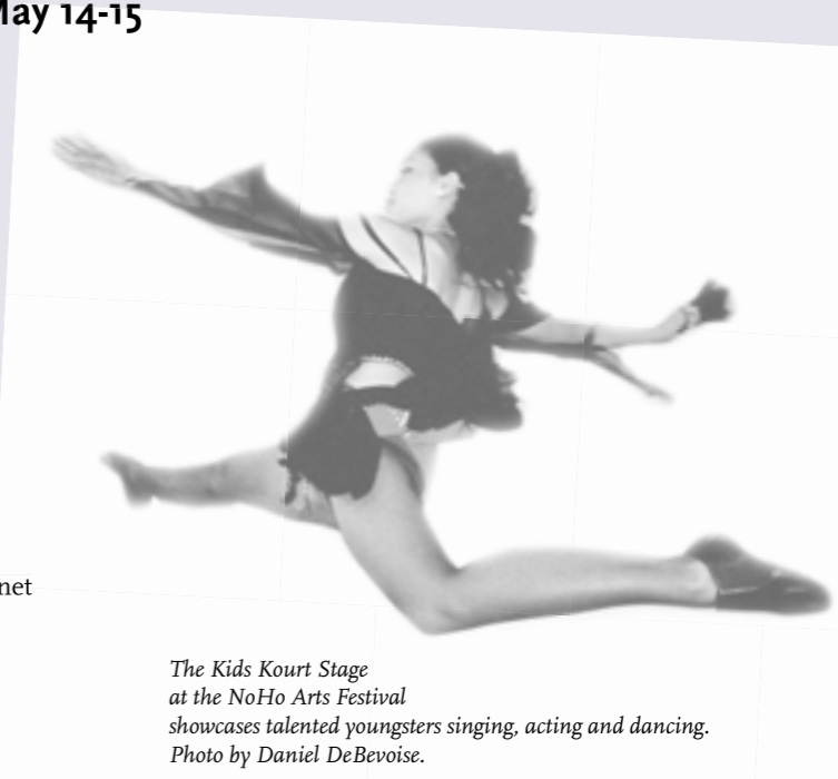
The Kids Kourt Stage at the NoHo Arts Festival showcases talented youngsters singing, acting and dancing.