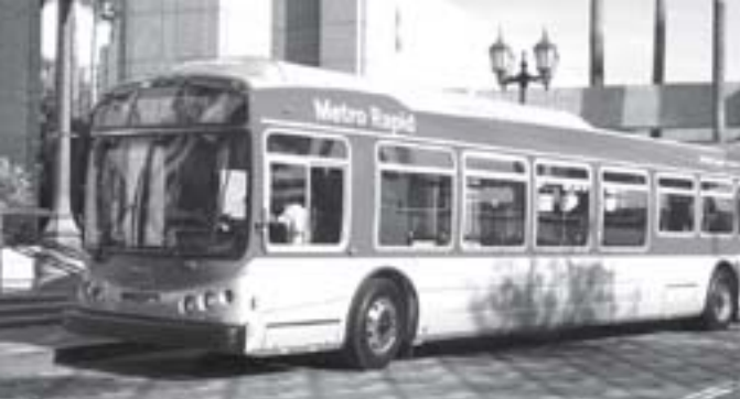
The 45-foot buses are just the first improvements to Line 761.