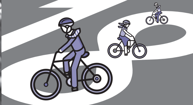
Bike to Work Day is part of a state-wide campaign to promote commuter biking.