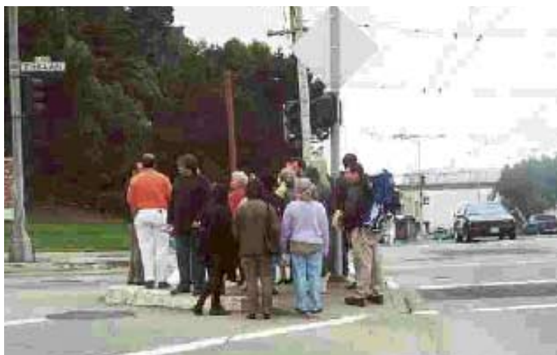
Figure 2-6: Neighborhood Walking Tour

Better Neighborhoods 2002 is a program created by the planning department to address changes happening within the city and to create better urban neighborhoods through the planning process. The plans will largely address housing and transportation challenges by establishing a strong relationship between land use and the transit system. The planning department also recognizes that “a great neighborhood also needs a full range of city services, safe and lively streets, gathering places, and an appreciation for its special character.” 105 Balboa Park is one of the first neighborhoods to be improved. The most recent step of the Better Neighborhoods 2002 program was a neighborhood workshop, a walking tour of Balboa Park Station area, and a bus tour of surrounding neighborhoods. Neighbors participating in the planning process were given workbooks as a tool for participation and for keeping abreast of the planning process for the station. Another workshop was held in late August.