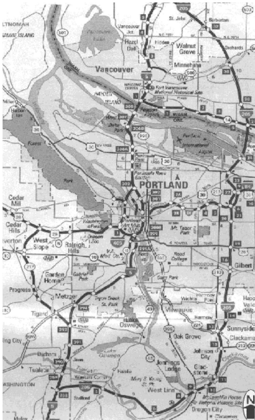
Figure 2-9: Portland Regional Map