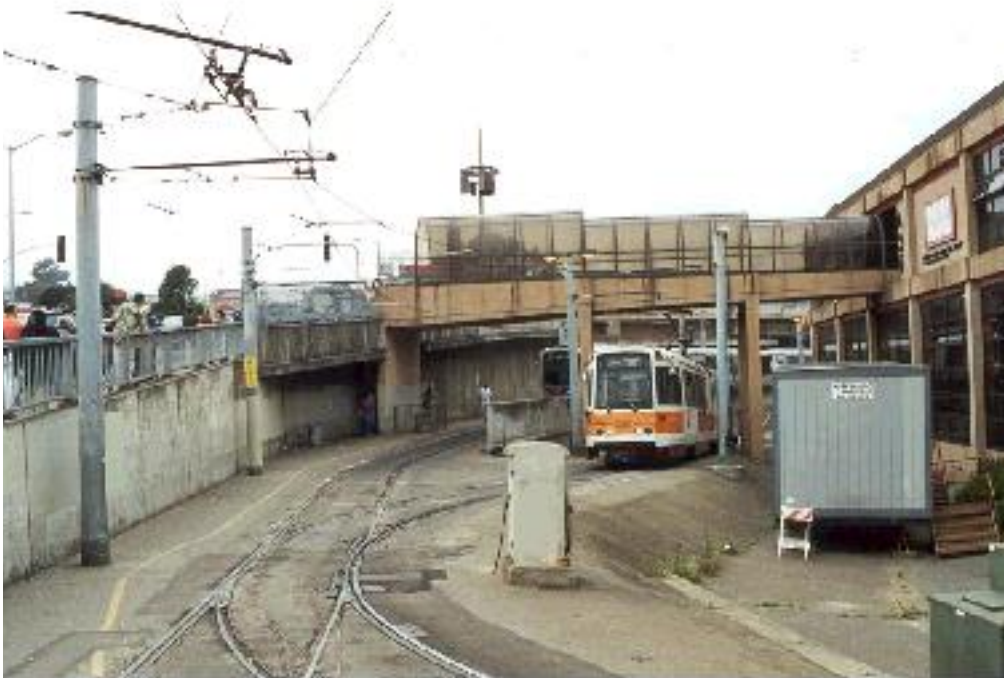
Figure 2-5: Balboa Park Station on Geneva Avenue Photo Courtesy of the San Francisco Planning Department, August 2000

The Outer Mission, Ocean View, West of Twin Peaks, Crocker-Amazon, and Excelsior neighborhoods surround the station. Other neighborhoods in the transit corridor are Glen Park, Bernal Heights, Noe Valley, and the Mission. The work program for the Balboa Park Station plan is based on the involvement of all those neighborhoods in the planning process. The success of the final plan implementation will depend on the communities' direct participation in the planning process and ownership of the transit-oriented urban community plan. The exact area to be studied and planned has been determined by "comfortable walking distances to the station, existing land uses, (and) major destinations" in the vicinity of the station. 104