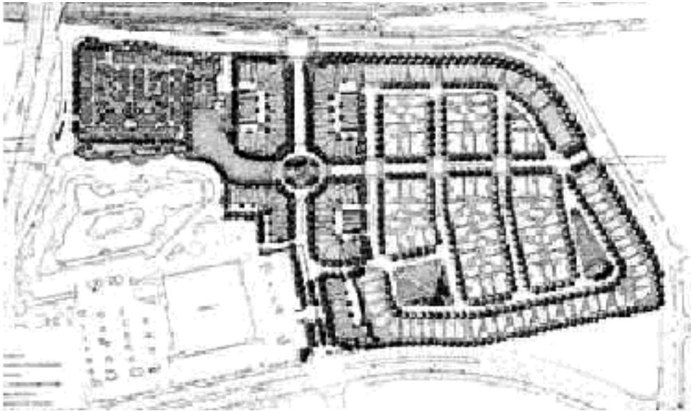
Figure 2-4. The Crossings

The development was enabled by the San Antonio Station Precise Plan, which divided the area into five sub-areas. The Crossings was developed in “Area D,” an area bounded by California Street, Central Expressway, Showers Drive, Pachetti Way, and the Old Mill Office Building Site. The city conceived “Area D” as an opportunity to combine housing, transit, and proximity to shopping services, making it ideal for higher-density residential development.