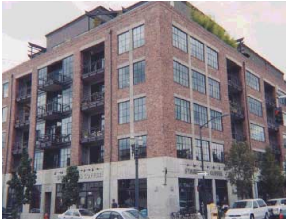
Figure 2-8: The McKenzie Lofts, Portland Source: Ankrom Moisan Associated Architects

Developed by Carroll Investments and designed by Ankrom Moisan Associated Architects, the property occupies 134,000 square feet and contains nine ground-floor spaces that offer 13,500 square feet of retail space, 68 housing units (the lofts) on five upper stories, and an underground, electronically accessed garage. The Lofts contain either one or two bedrooms and range from 682 to 1,725 square feet. 179 The development is adjacent to bus lines and is near Portland's downtown financial district. Ninety per cent of the units in the project were sold prior to its completion in the fall of 1997. 180 The total cost of the project was $14.5 million. Financing for the Lofts was conventional and Fannie Mae approved, so no public subsidies were used. The McKenzie Lofts project serves households with medium to upper incomes, as described in the "strategy" plan.