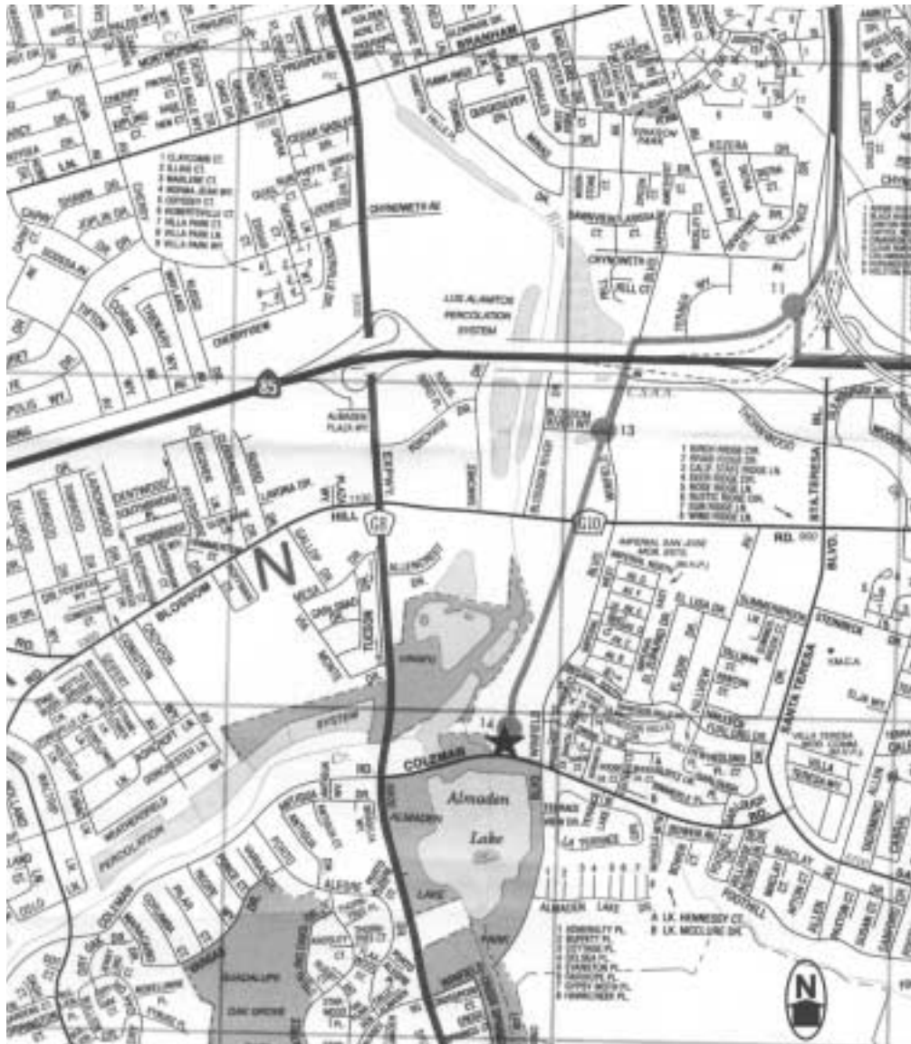
Figure 2-2: Almaden Lake Village Neighborhood Map