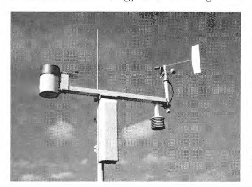
Weather station data shape appropriate storm response.

The result was a set of detailed guidelines that gave state DOTs and local agencies a scientific methodology for addressing