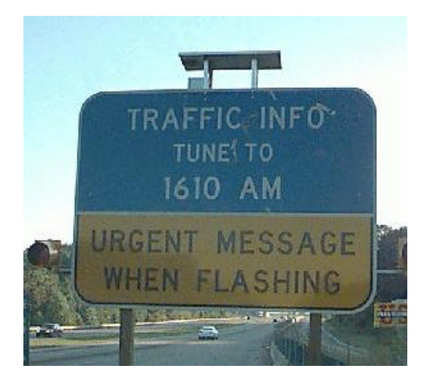
Figure 4-1 Message Board Indicating HAR Radio

HAR is a real-time tool used to update travelers on travel information through a radio broadcast. The FCC licenses HAR as a Travelers Information Station (TIS). Its main applications include maintenance/construction zones, traffic advisories, route diversions, special events, weather advisories, and tourist information. HAR stations are operated with low-power transmitters placed along the roadside. Advisory signs are used to inform the driver of the existence of HAR. These signs also provide the station's frequency so drivers can tune their radios to receive traffic information. Figure 4-1 is an example of a HAR notification sign.