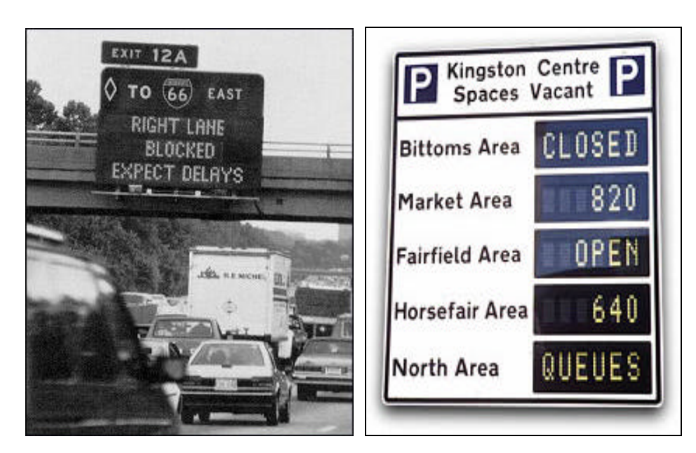
Figure 4-2 Example Variable Message Signs

(MUTCD). The MUTCD states that the driver should be able to read the message at least twice while traveling (MUTCD, 1989). The VMS should be within the driver's cone of vision to be identifiable. The use of fiber optic technology, fuel cells, light emission diodes, and other emerging technology will continue to enhance VMS. Two examples of VMS are shown in Figure 4-2.