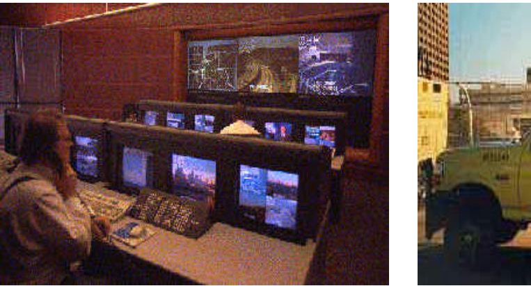
Figure 4-3 Photos of NAVIGATOR Center and HERO Vehicle

NAVIGATOR utilizes VMS at key decision-making points on area interstates, where operators can inform motorists of travel times and display incident messages. These messages are updated every two to three minutes to allow motorists to make informed decisions about alternate routes. NAVIGATOR reaches the cities of Atlanta, Athens, and Savannah, and will be expanded to other cities (Atlanta NAVIGATOR, 1998). Figure 4-3 shows a NAVIGATOR traffic management center and a HERO response vehicle.