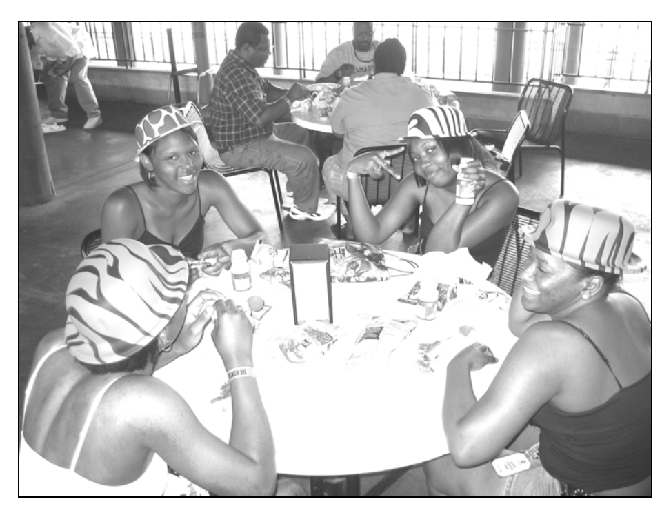
Figure C-4 Look who "escaped" from the zoo