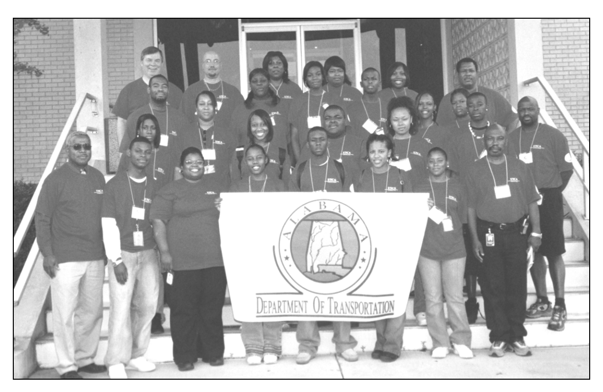
Appendix C: Examples of Photos Taken During Institute