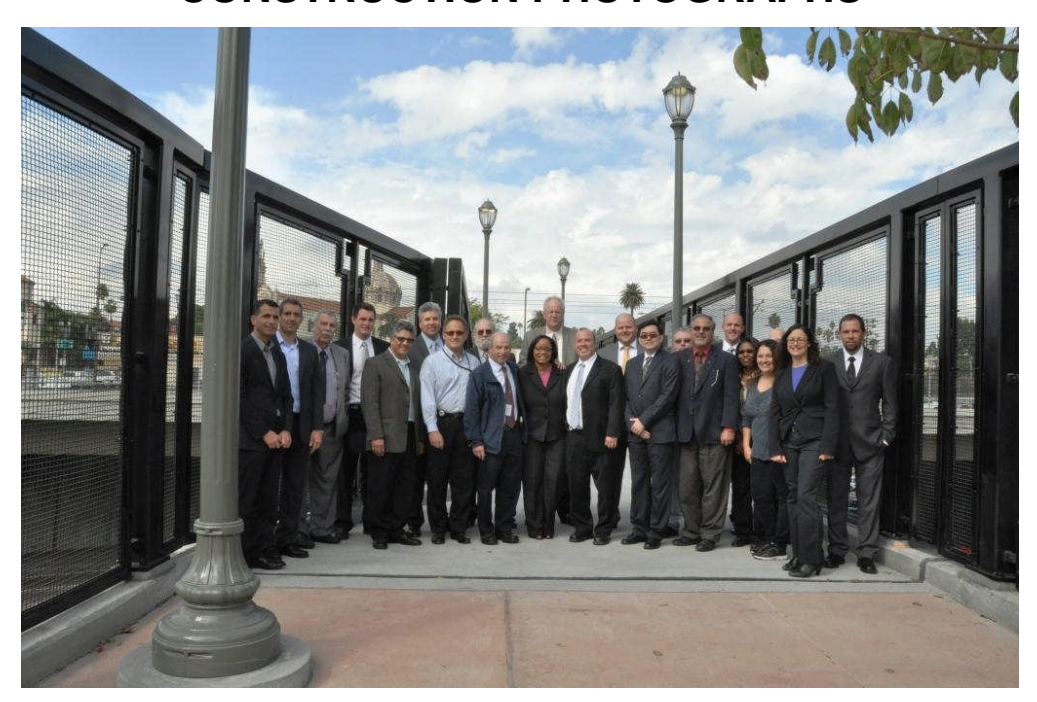
Adams POC group picture.