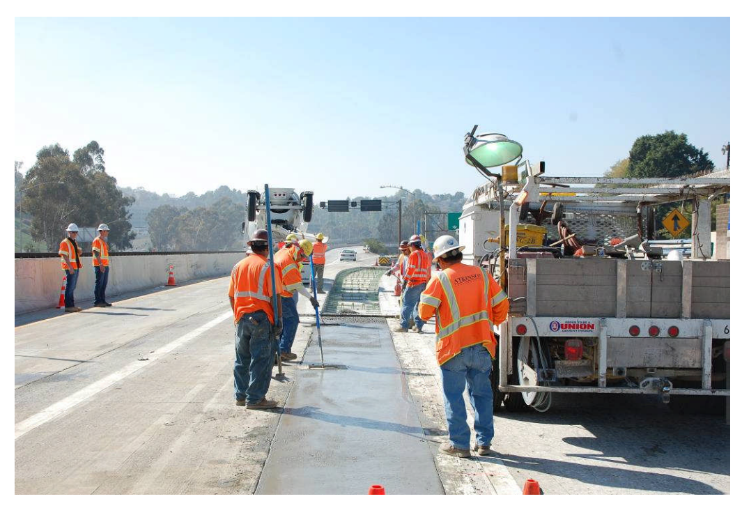
10 EB pour before 710.