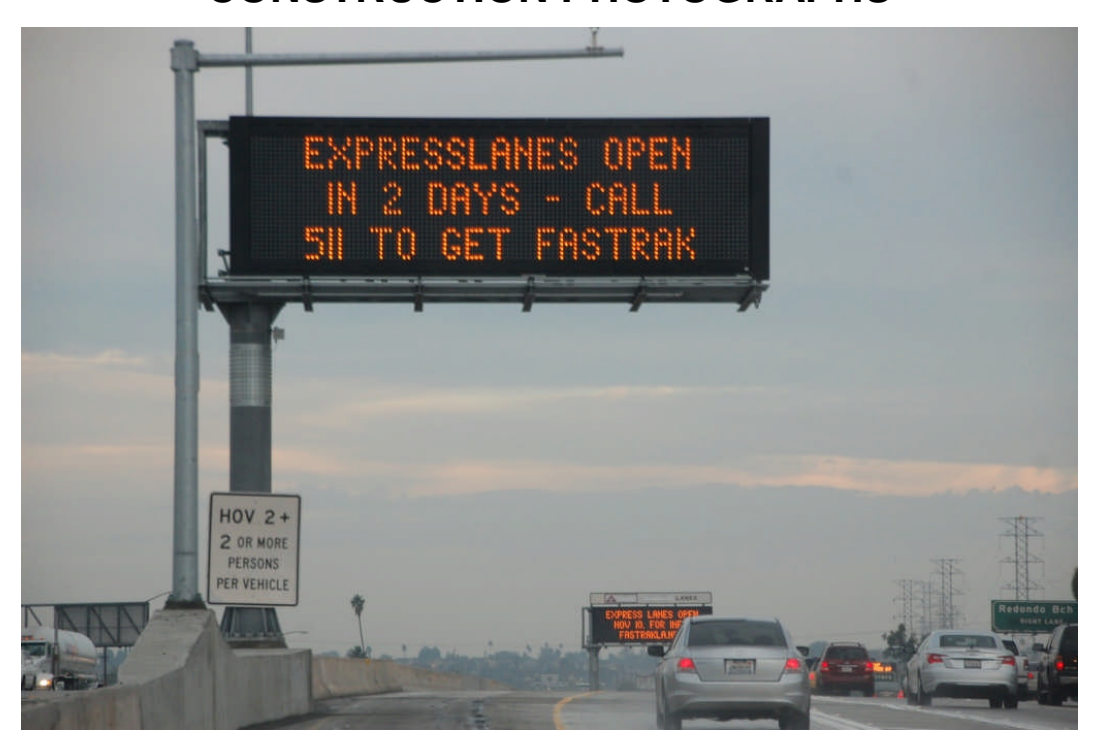
2 day notice on I-110 NB.