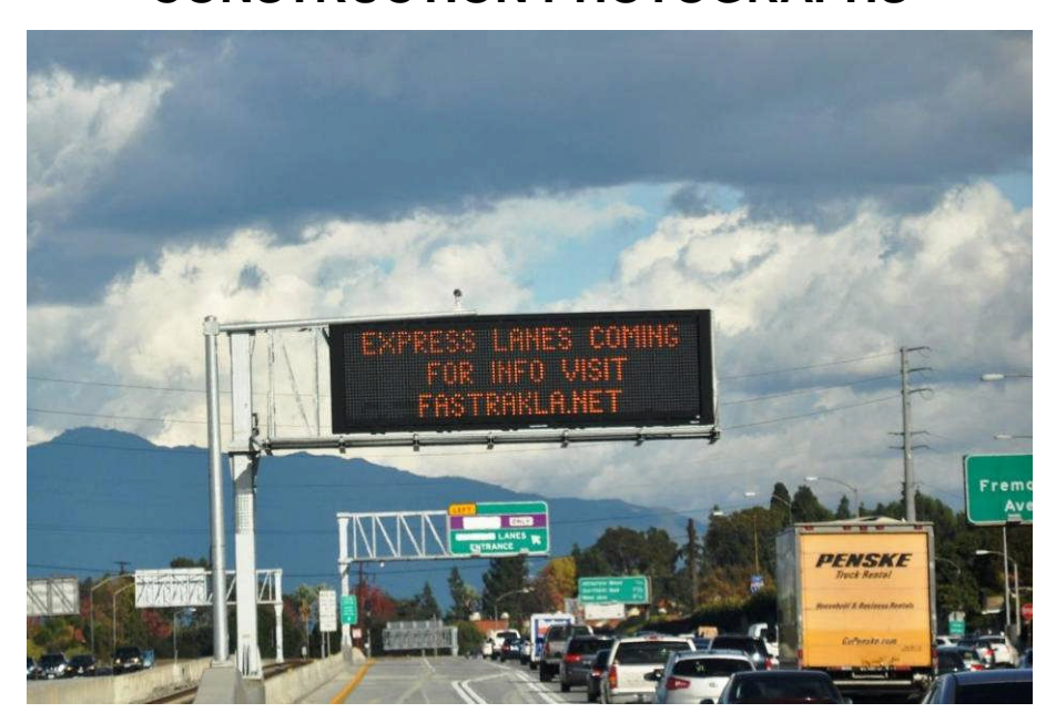
DMS sign close to Fremont Ave on I-10 freeway.