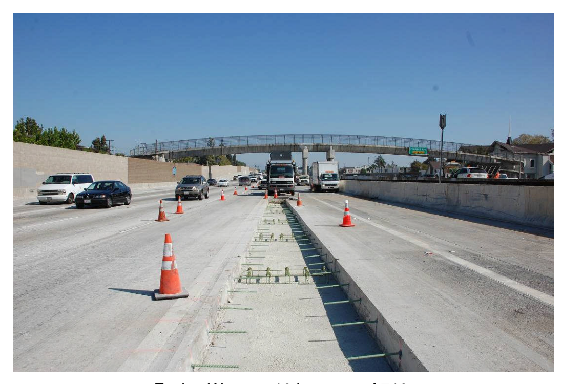
Facing West on 10 just east of 710.