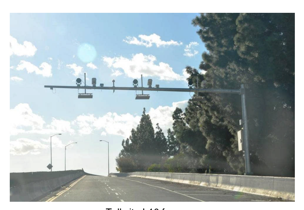
Toll site I-10 freeway.