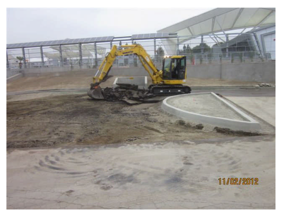
AC removal in Lot B.