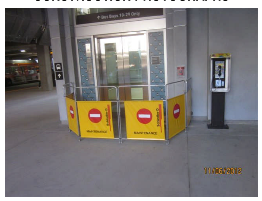
Punchlist work taking place on elevator no. 2.