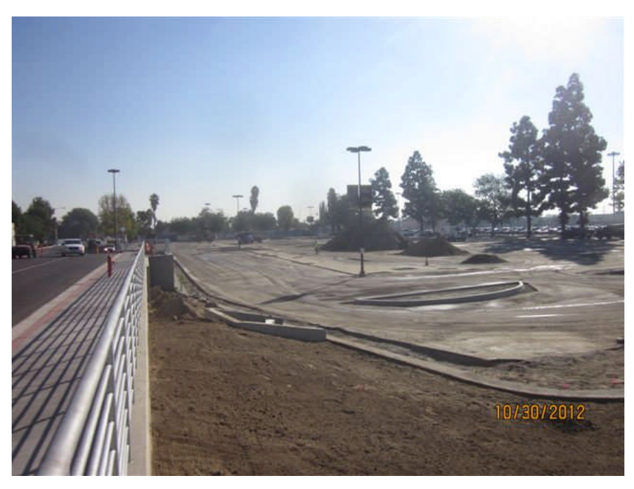
Curb and gutter in place.