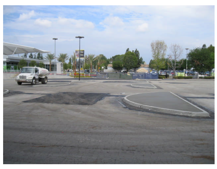
Island infill with concrete.