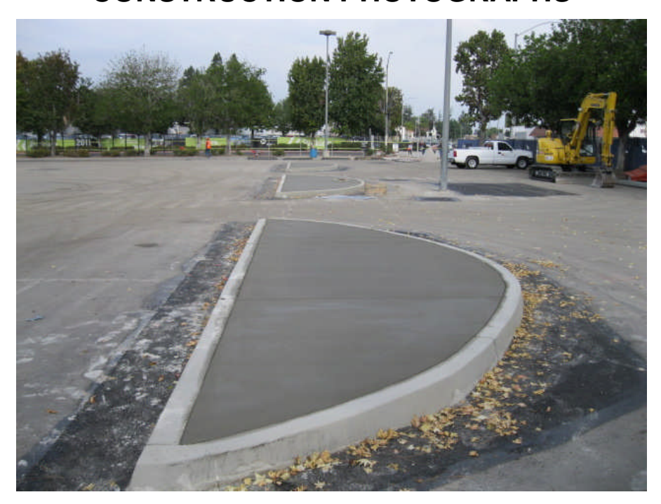
Concrete placement Lot B islands.