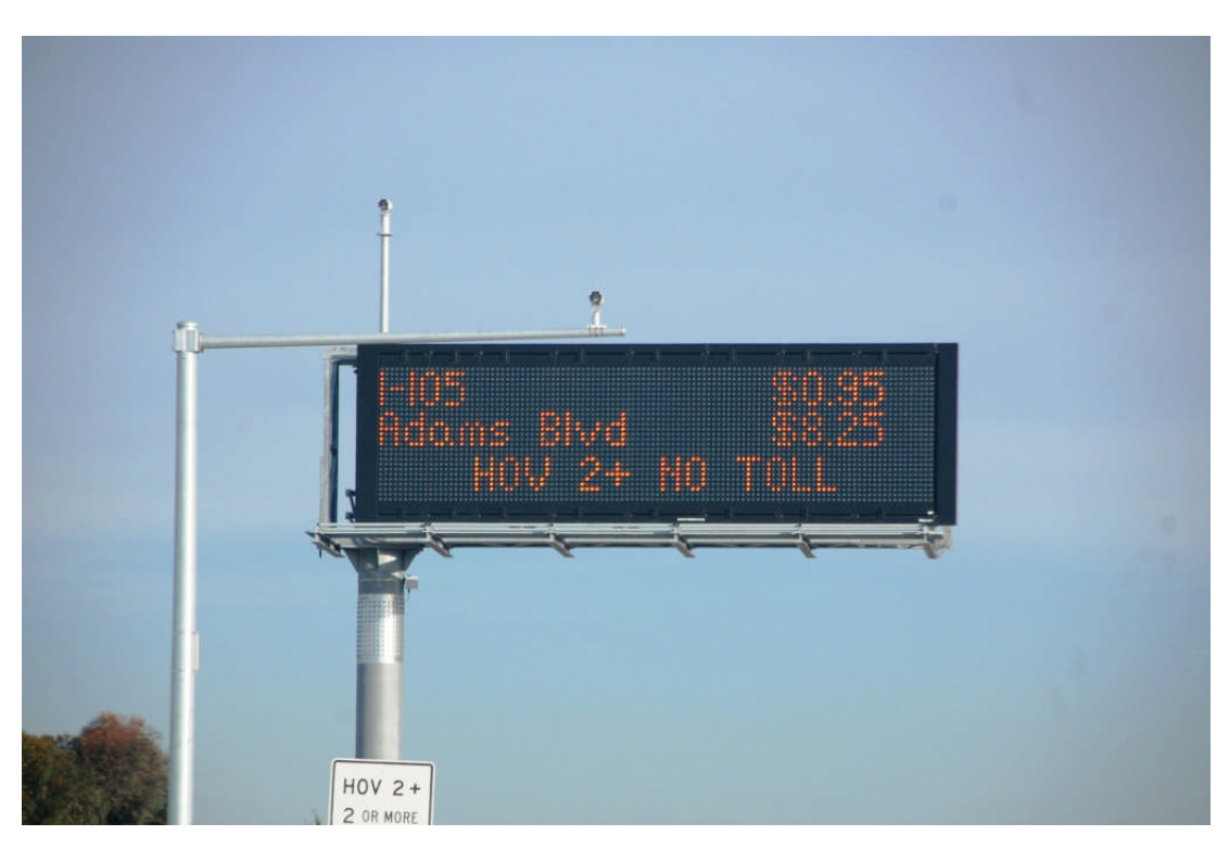
DMS along I-110 with fees.