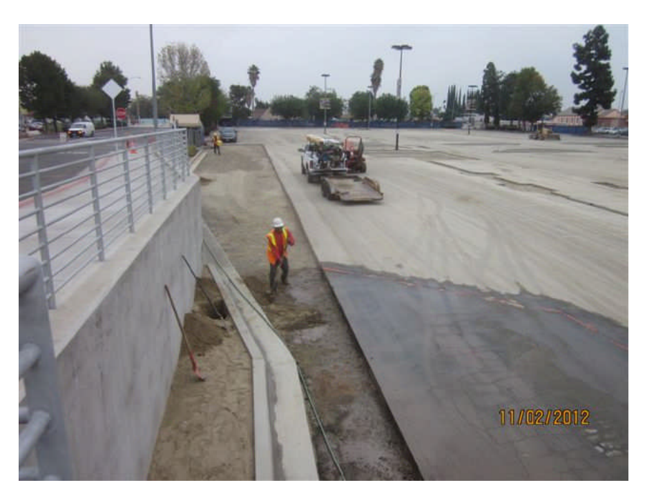
Trenching in irrigation lines in Lot B.