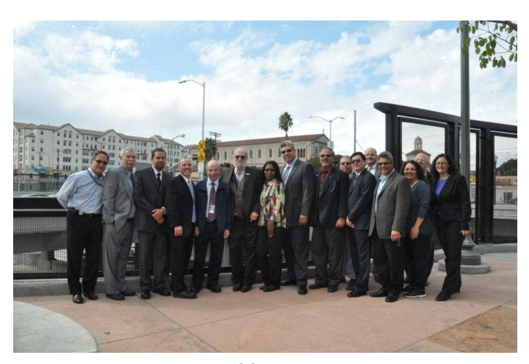
Adams POC group picture.