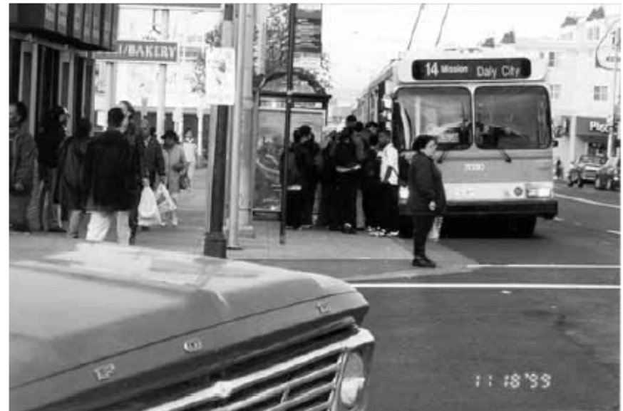
Figure 19. Corner of Mission Street at 30th Street (bus bulb configuration).