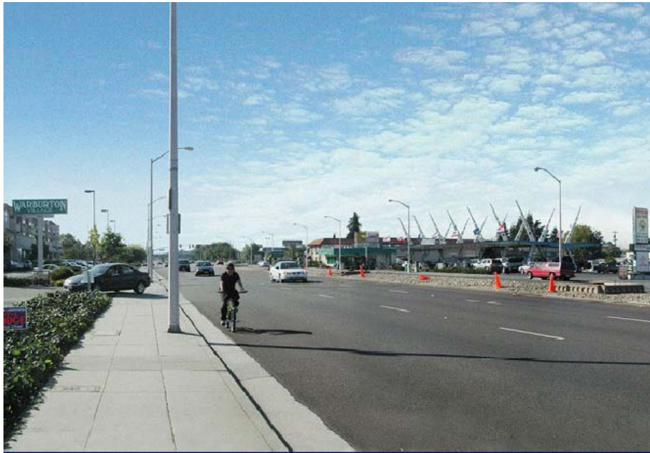
Conventional Bus Bay Design