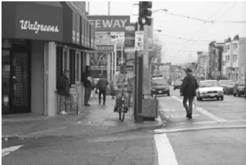
Figure 17. Corner of Mission Street at 30th Street (bus bay configuration).