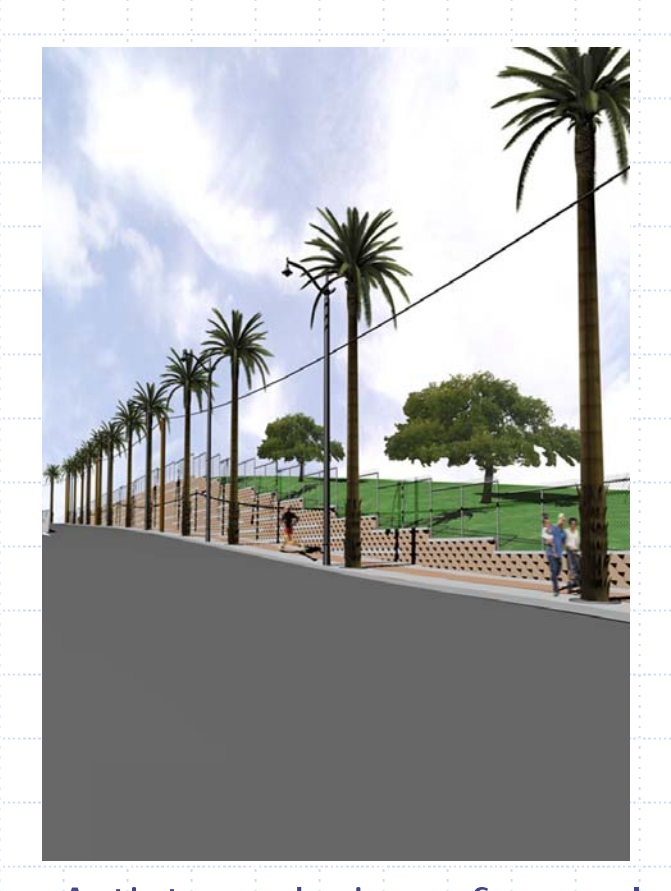
Artist rendering of completed wall and jogging path. Gold