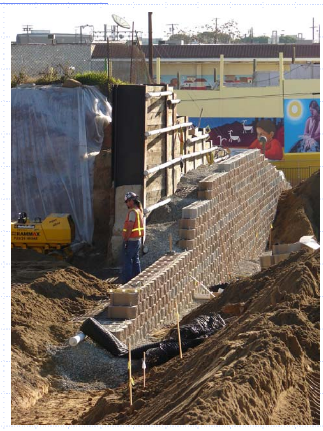
Construction of the retaining wall at the Northeast corner.