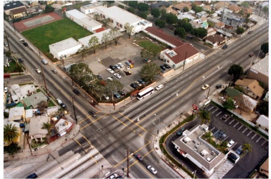
3 rd Street and Indiana Street Intersection