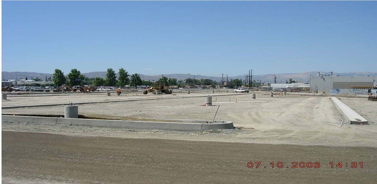
Parking Lot A looking north