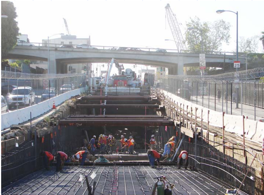
1 st Street/Gless Street West Portal