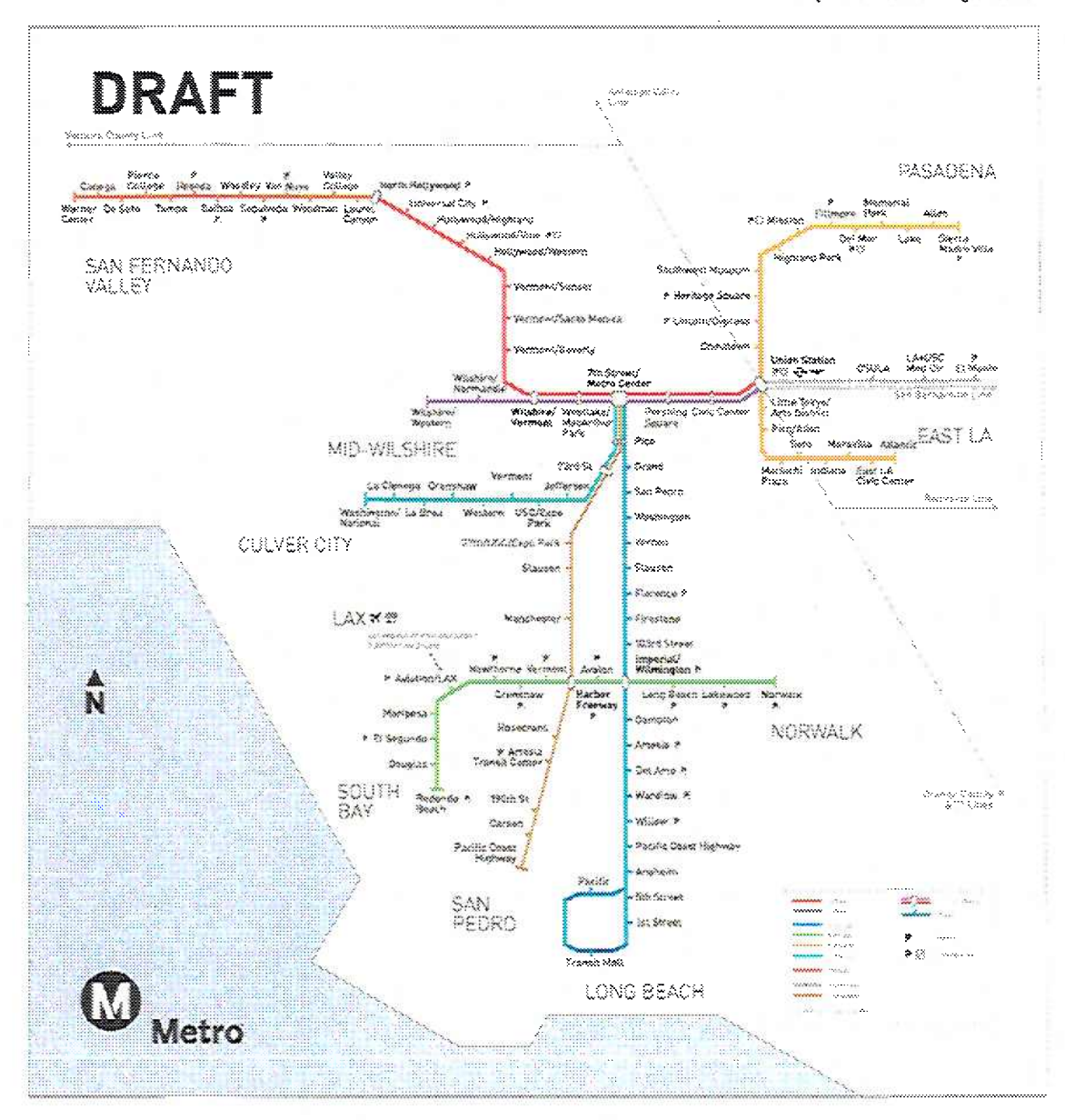
Attachment B: Proposed Color Designations

Note: Colors will vary depending on computer monitor and printer..