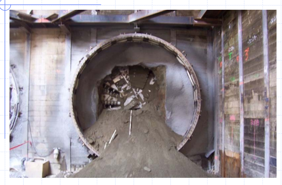
Second Earth Pressure Balance Machine reached Soto Station on August 24, 2006