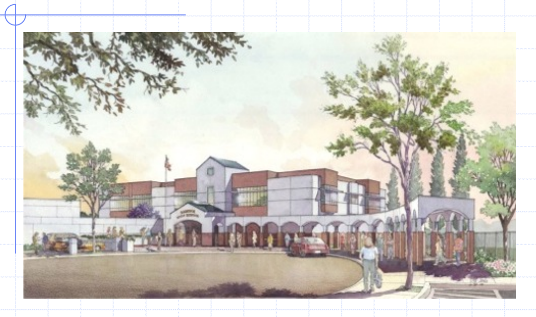
LAUSD Ramona Opportunity High School