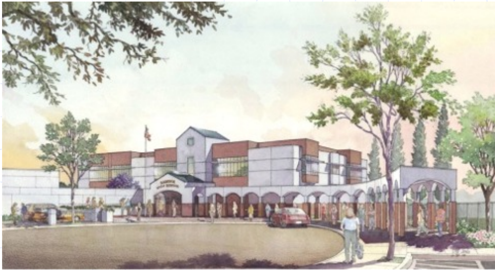
LAUSD Ramona Opportunity High School