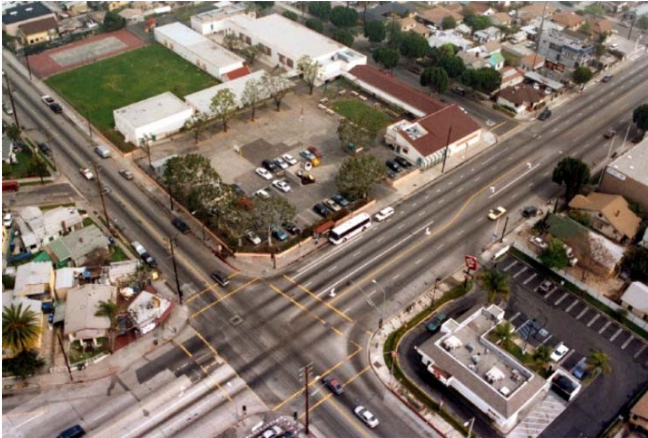
3 rd Street and Indiana Street Intersection