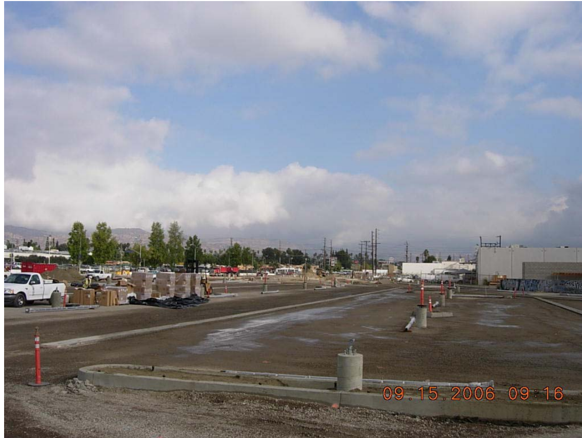
Parking lot area looking north