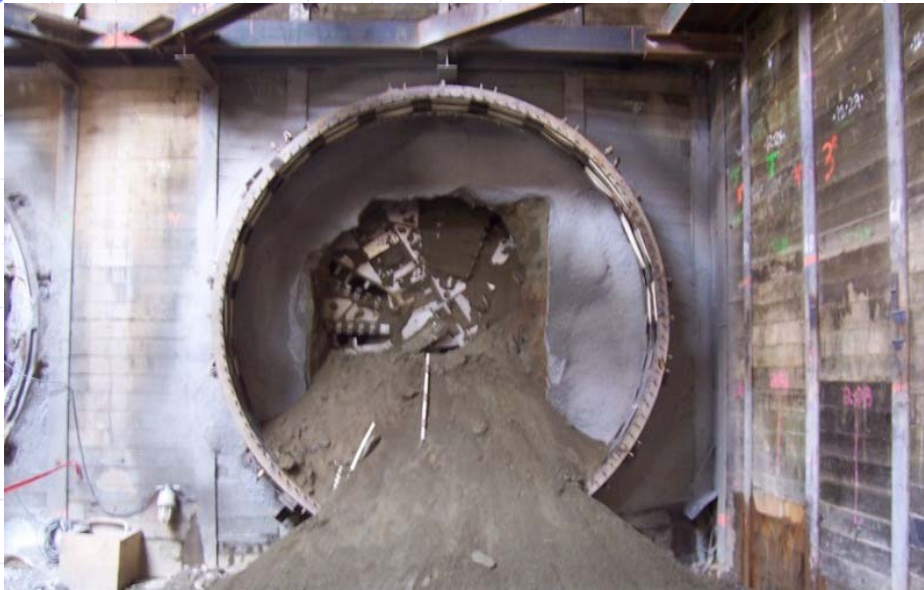
Second Earth Pressure Balance Machine reached Soto Station on August 24, 2006