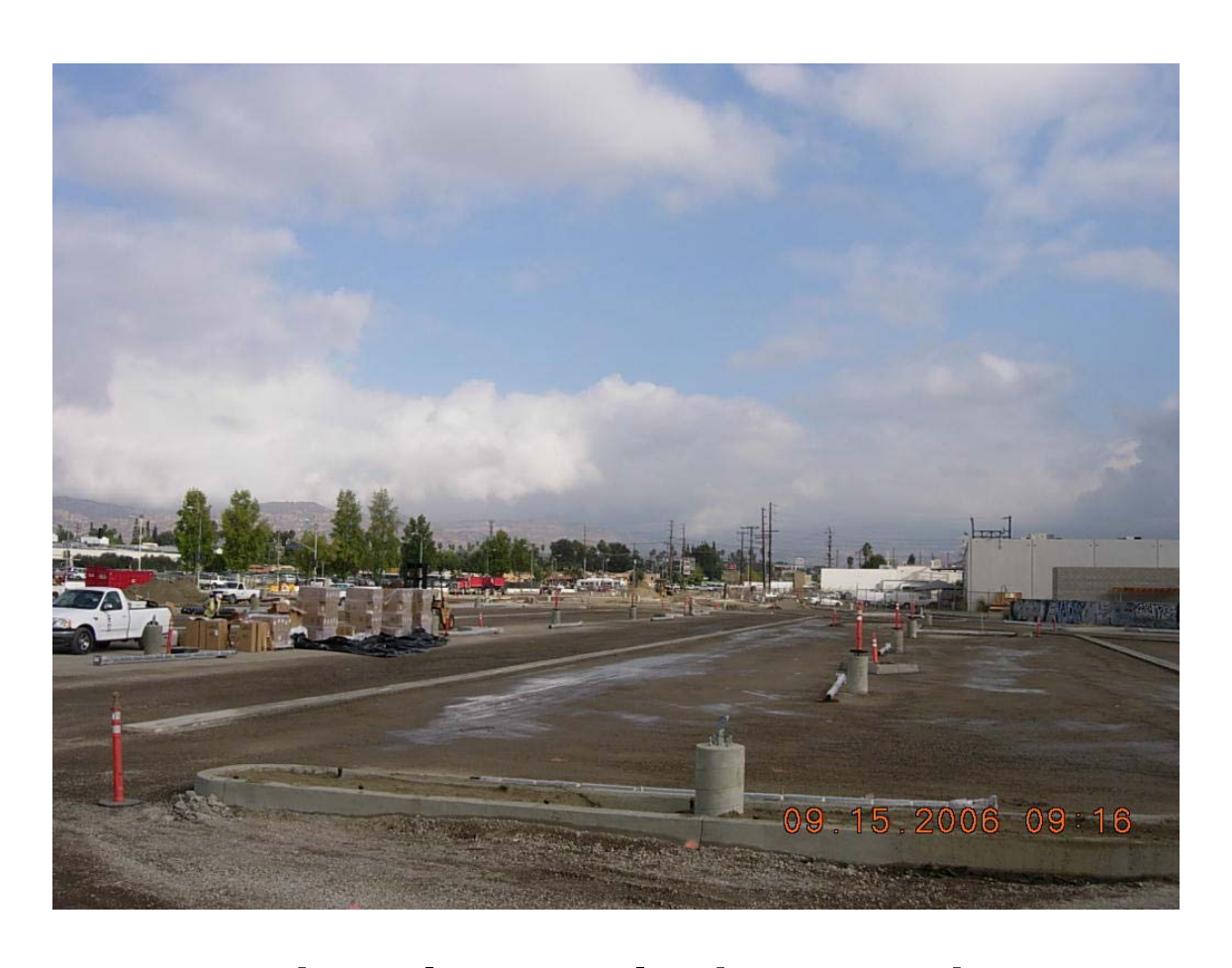
Parking lot area looking north