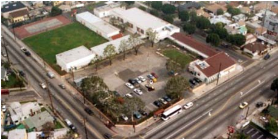
3 rd Street and Indiana Street Intersection