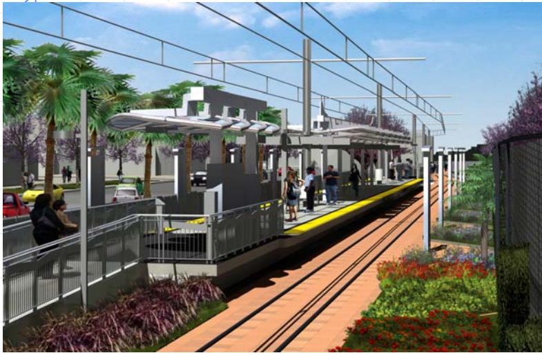
Indiana Light Rail Transit Station