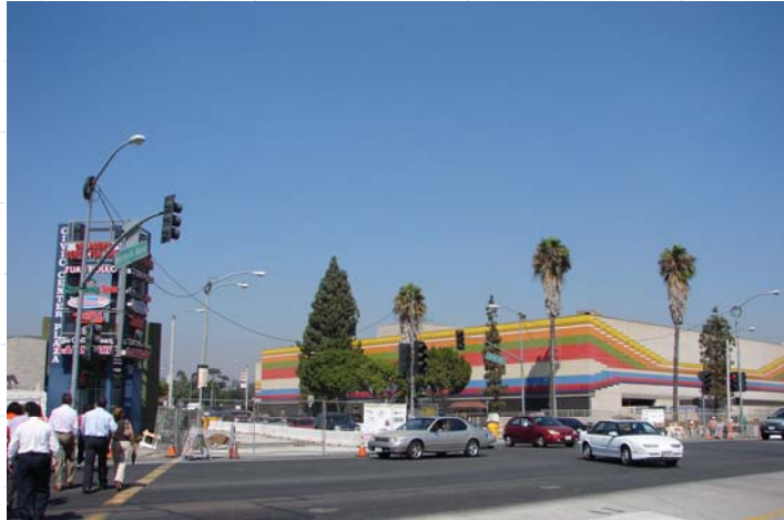
Intersection of 3 rd /Mednik (Before)