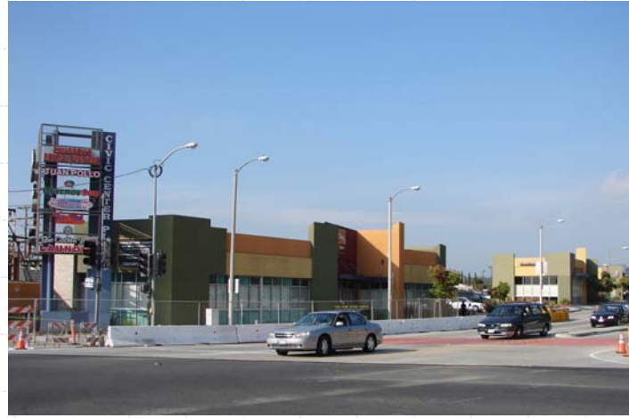
Intersection of 3 rd /Mednik (After)