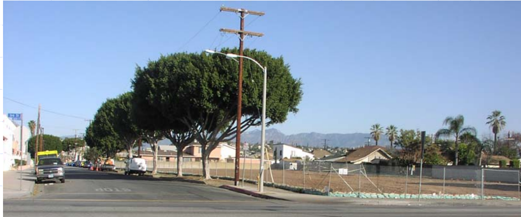
3 rd Street and Alma Avenue