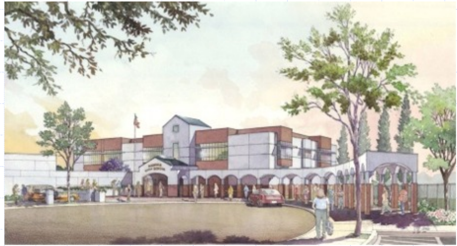
LAUSD Ramona Opportunity High School