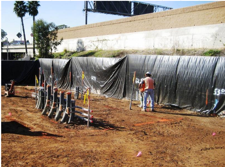
Traction Power Substation 4