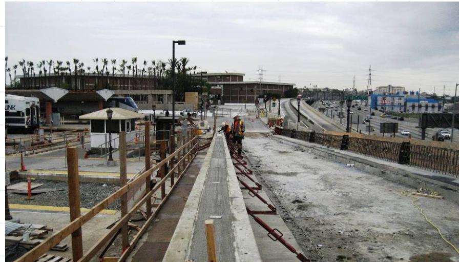
Union Station Baggage Handling Road

The 101 Freeway LRT Bridge was completed on-time last year by Caltrans to allow the construction to begin for the installation of trackwork at the future connection to the Pasadena Gold Line at Union Station. Construction of the baggage handling road, which connects to the LRT Bridge, is underway.