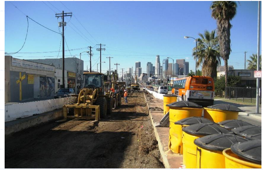
LRT Guideway Between the West Portal & 1 st Street Bridge

Construction of the LRT guideway is underway in all the civil line segments.