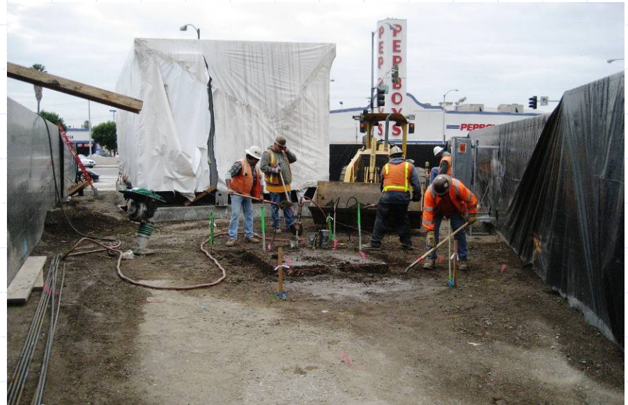
Traction Power Substation 6

Traction Power Substation 6 has been delivered and installed near the terminus station at Pomona/Atlantic. Traction Power Substation 4 is planned to be installed by early February 2008. Power energization will begin in Spring 2008.