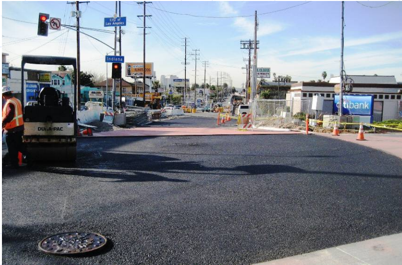
New street pavement and pedestrian crosswalks at the intersection of 1 st Street and Indiana Street.