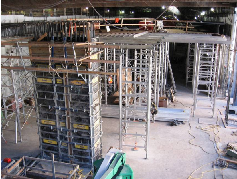
Boyle Heights/Mariachi Plaza Station