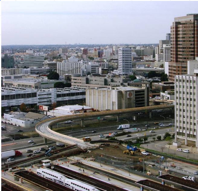
US 101 Freeway LRT Bridge