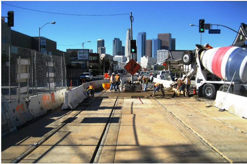
1 st Street & Vignes Street Intersection