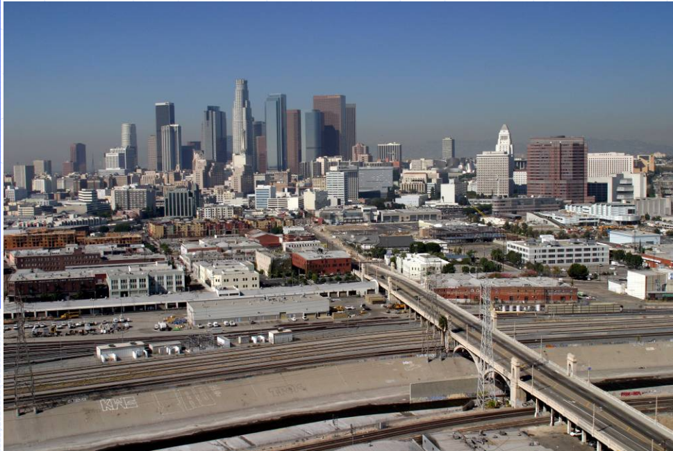
View of the LA River 1 st Street Bridge prior to bridge widening.

Metro and the City of Los Angeles have implemented a plan that will allow Metro to install the LRT track guideway during a 30-day bridge closure, prior to the City's planned start of their Phase III Bridge Widening contract in February 2008. The bridge closure will reduce Metro's construction period and shorten the duration of impacts to the community. The closure is planned to begin January 20, 2008.