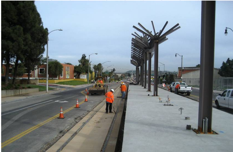
East LA Civic Center Station