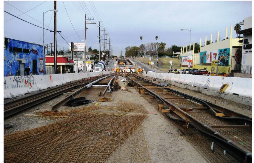
LRT track installation along 1 st Street between Indiana Street and Lorena Street.