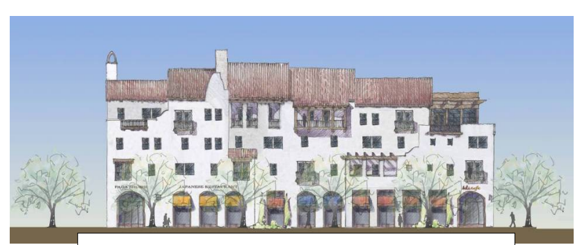
San Fernando Road Elevation