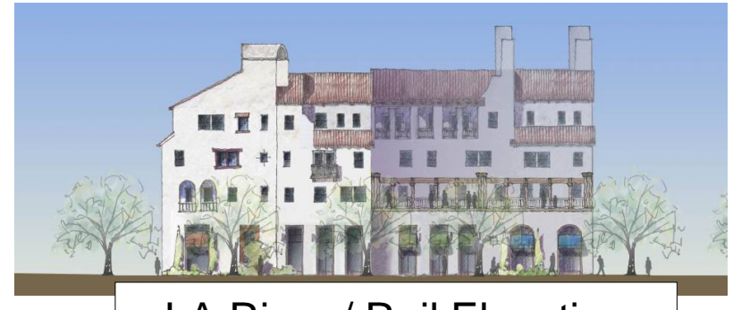
LA River / Rail Elevation