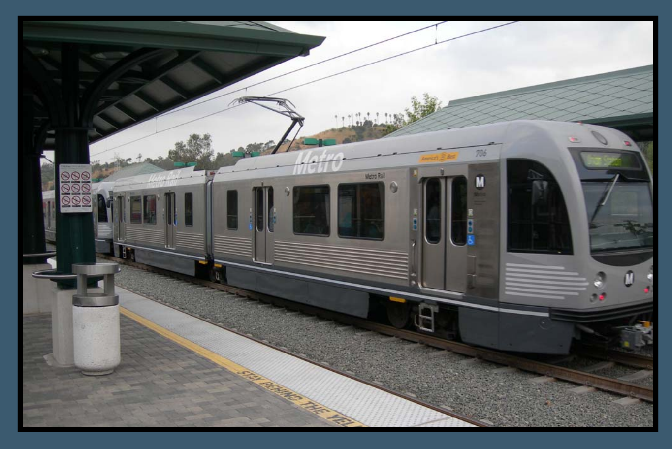
April 3 - 19 LRVs have been turned over to Metro to run in revenue service.