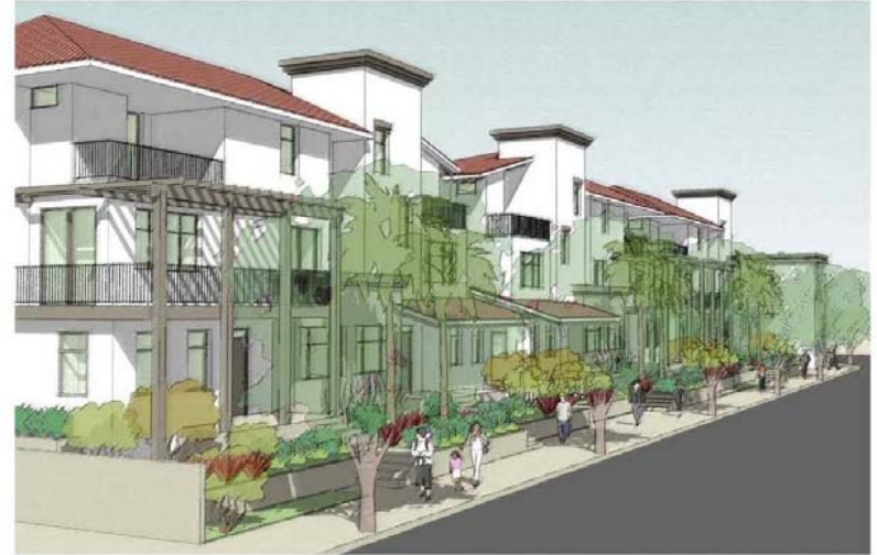
FICKETT STREET LOOKING NORTH TOWARDS CESAR E. CHAVEZ AVE