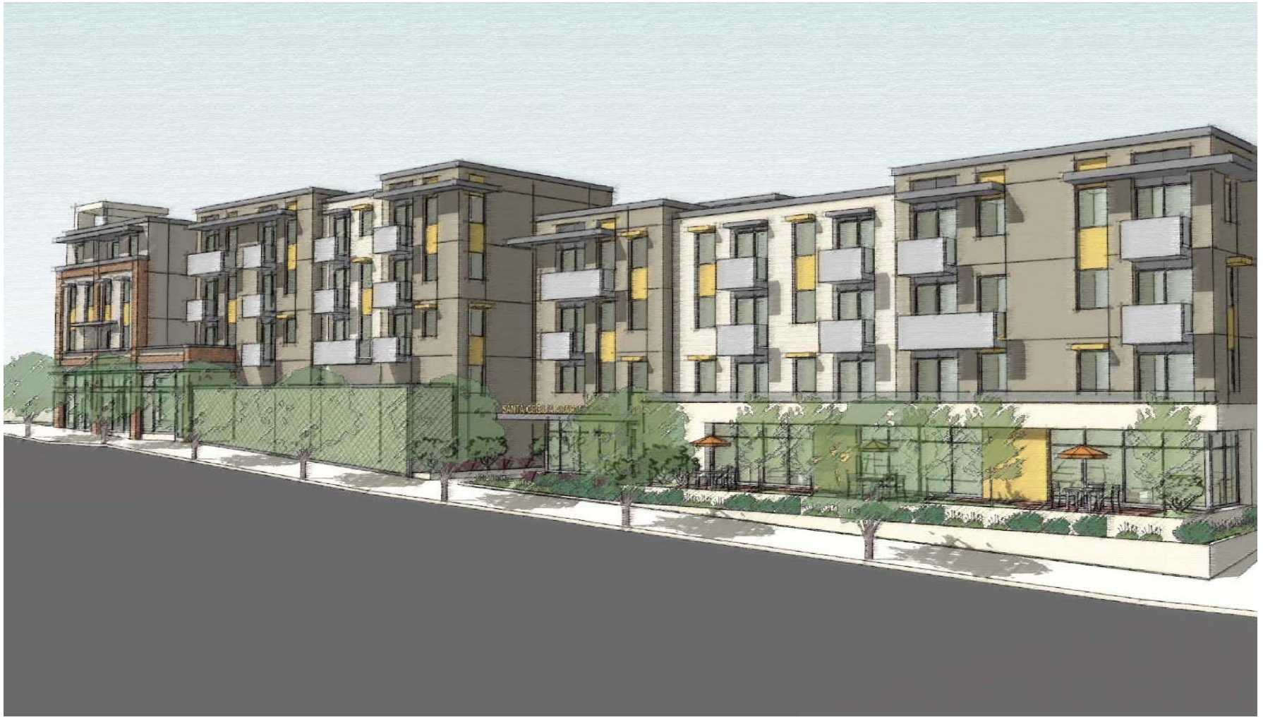
FIRST STREET LOOKING SOUTH TOWARDS BOYLE AVENUE