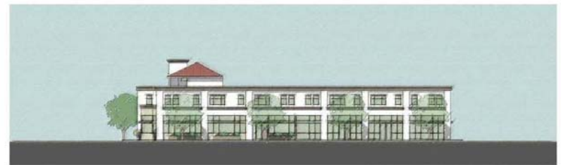
CESAR E. CHAVEZ AVENUE ELEVATION