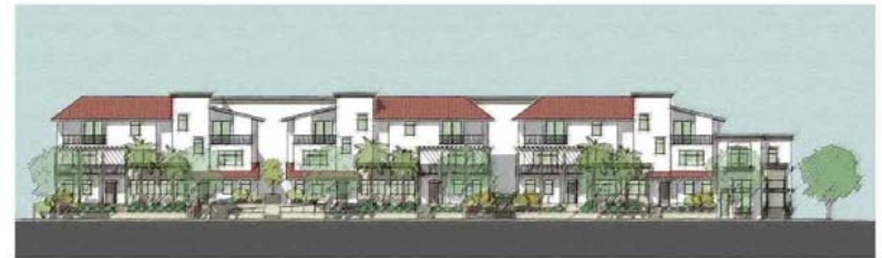
FICKETT STREET ELEVATION