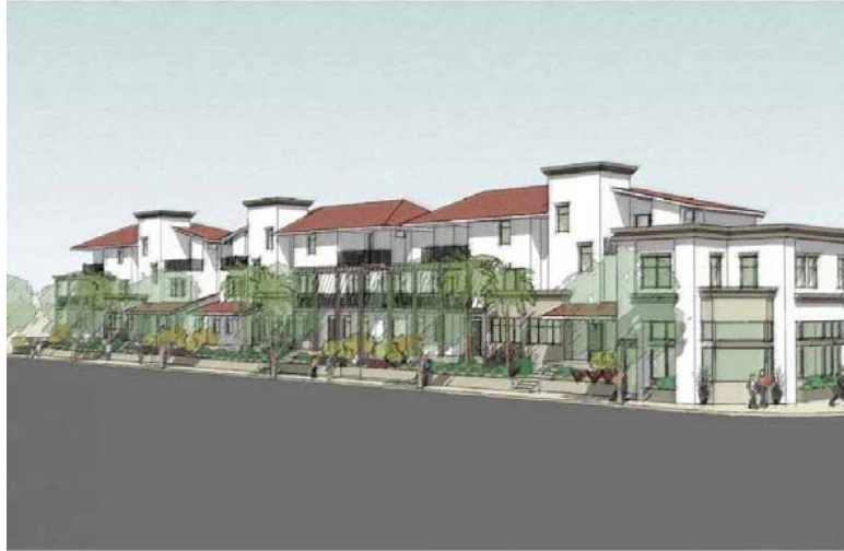
CORNER OF CESAR E. CHAVEZ AVE & FICKETT STREET