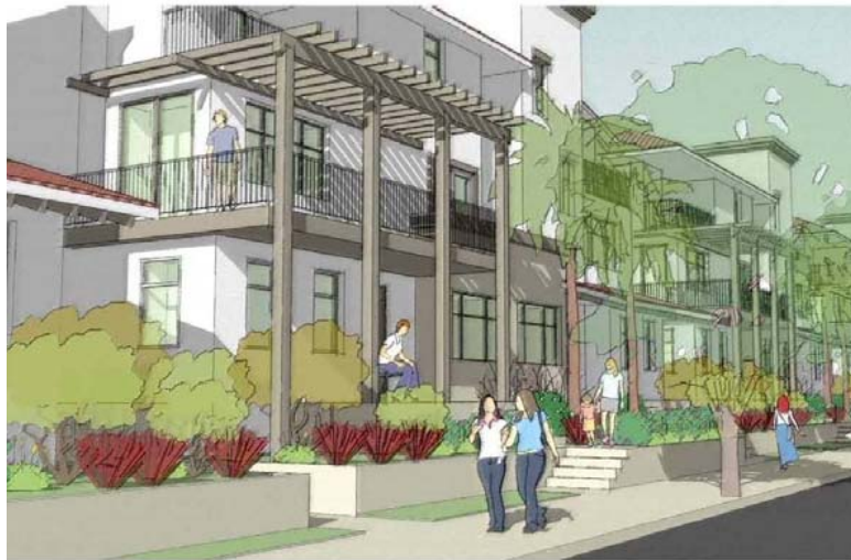
DETAIL OF RESIDENTIAL UNITS ALONG FICKETT STREET