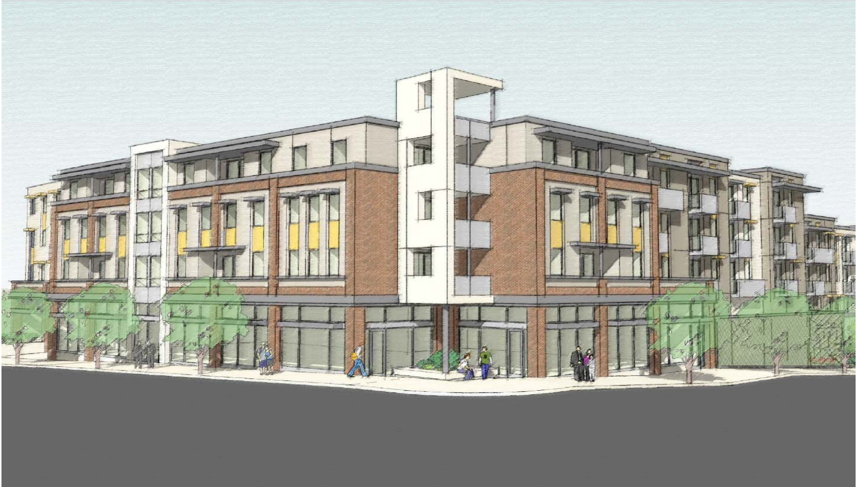
CORNER OF BOYLE AVENUE AND FIRST STREET