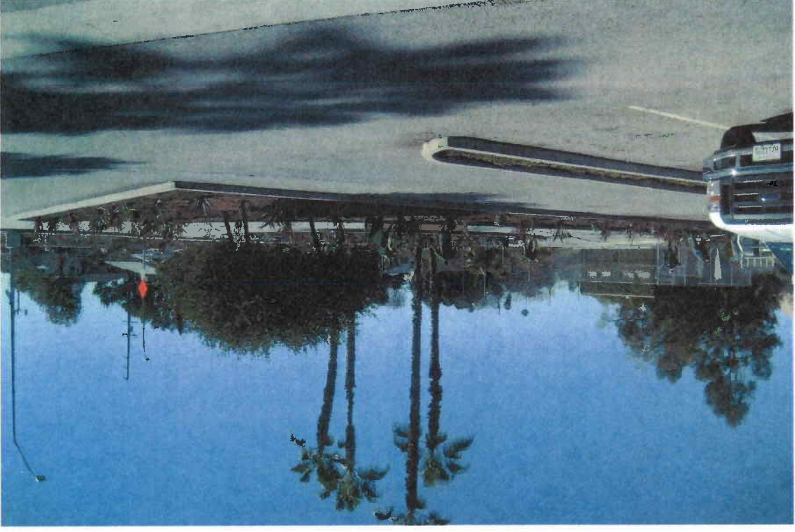
Two views of workers from MTA contractor, Marina Landscape, Inc., replanting the MTA area at the Long Beach Blvd. Green Line Metro Rail Station. (1-25-12)