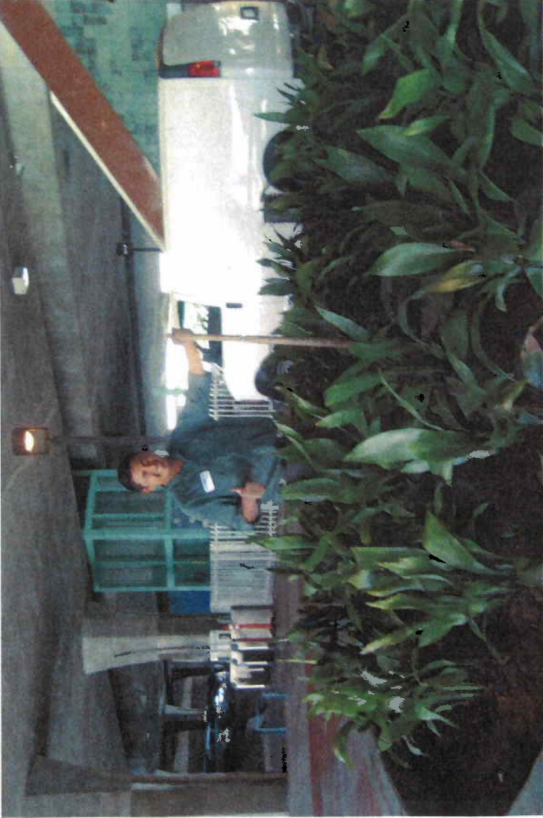
Employee of MTA contractor, Marina Landscape, Inc. gives a "thumbs-up" greeting for his replanting of one of the two circular planter beds at the entrances to the Long Beach Blvd. Green Line Metro Rail Station. (1-25-12.)