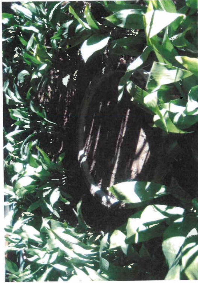
Views of replanted areas at Long Beach Blvd. Green Line Metro Rail Station. Replanted by MTA contractor, Marina Landscape, Inc. (Photos 1-25-12 & 1-26-12)