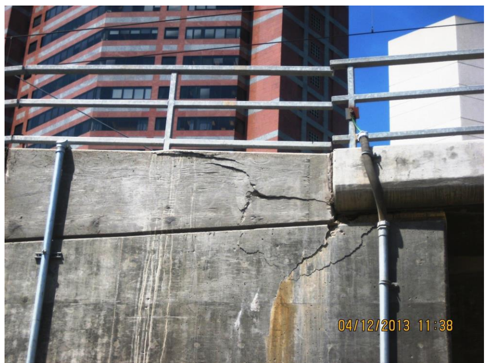
Before Repair (April 12, 2013):