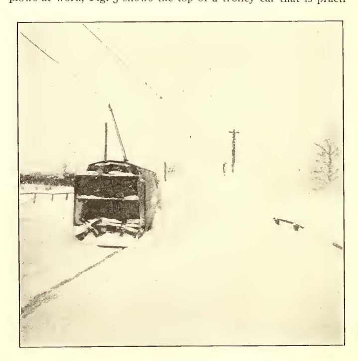
FIG. 2.--ROTARY PLOW AT WORK

The accompanying illustrations give a fair idea of the conditions which confronted the management. Figs. 1 and 2 shew the rotary plows at work, Fig. 3 shows the top of a trolley car that is practi-