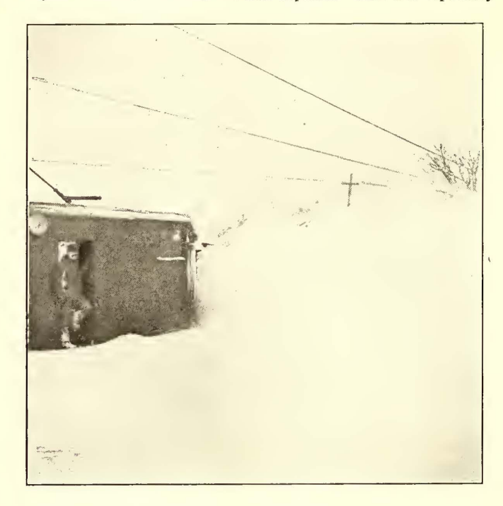
FIG, I.—ROTARY PLOW AT WORK

The severe snowstorms which have visited Central and Western New York during the last winter have caused the street railway companies considerable trouble and expense. This was especially