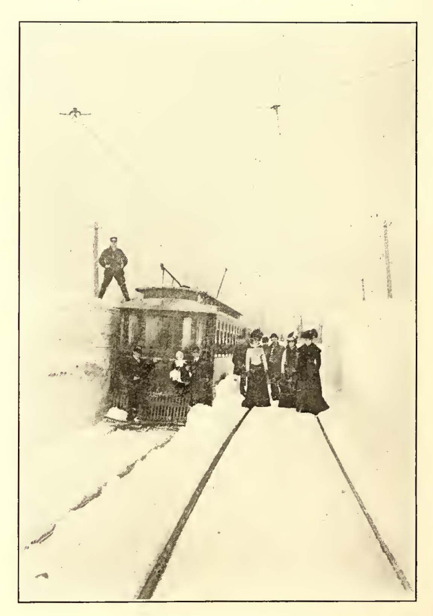
FIG. 4.-A CLEAR TRACK

the Rochester & Sodus Bay line. For work of this kind it is difficult to imagine any machine more efficient than the rotary snow plow, and the fact that two of these plows kept 40 miles of line open for practically the entire season, is an excellent testimonial to its ability as a snow fighter.