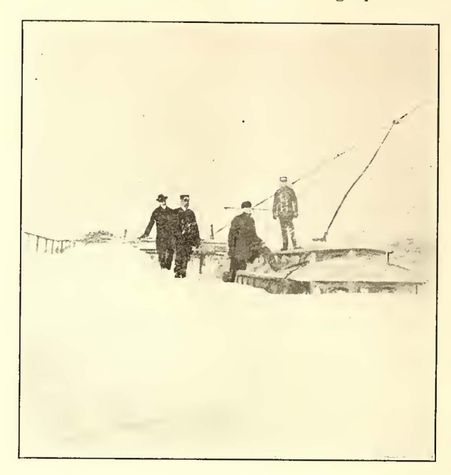
FIG. 3.—STALLED IN A DRIFT UP TO THE EAVES

The accompanying engravings give a better idea than any description could do of the size of some of the drifts encountered on this line during the last winter season, and it is doubtful whether any other electric railway can make a showing equal to that of