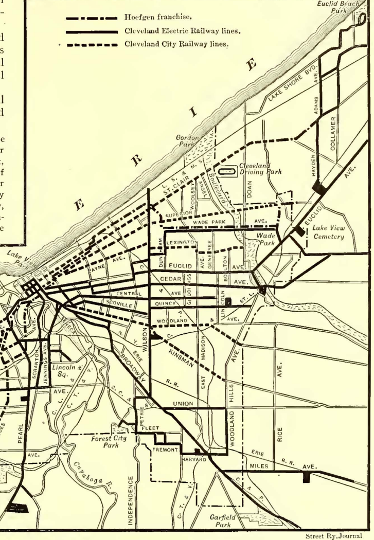
MAP OF CLEVELAND, SHOWING EXISTING ROUTES AND NEW FRANCHISES

Sec. 8. The Council reserves the right to purchase the property when it may