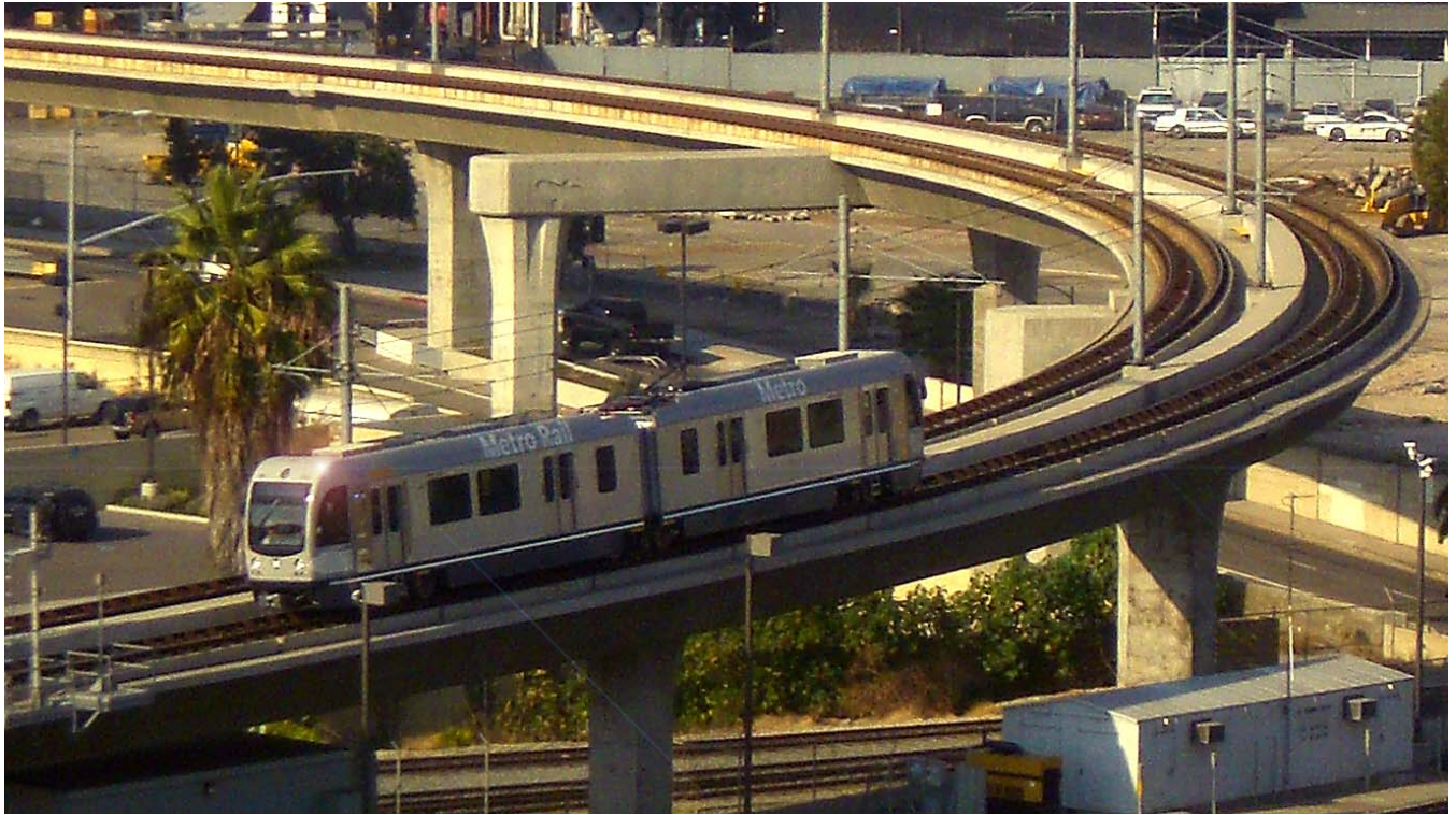
2550 LRV Coming Around the Curve into Union Station.