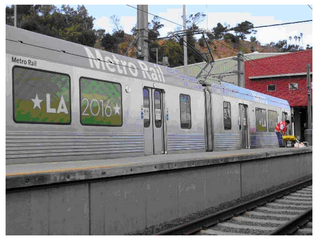
2550 LRV at Metro Gold Line Yard with Decals for LA Olympic Bid.