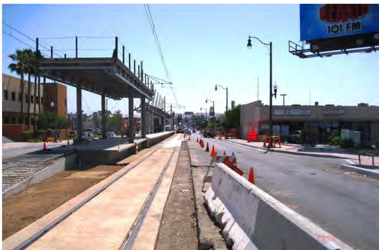
Figure 3-11. At-Grade LRT Construction

This section examines the potential for impacts during the construction period of the LPA. Implementation of the No-Build Alternative would not result in disruption to the