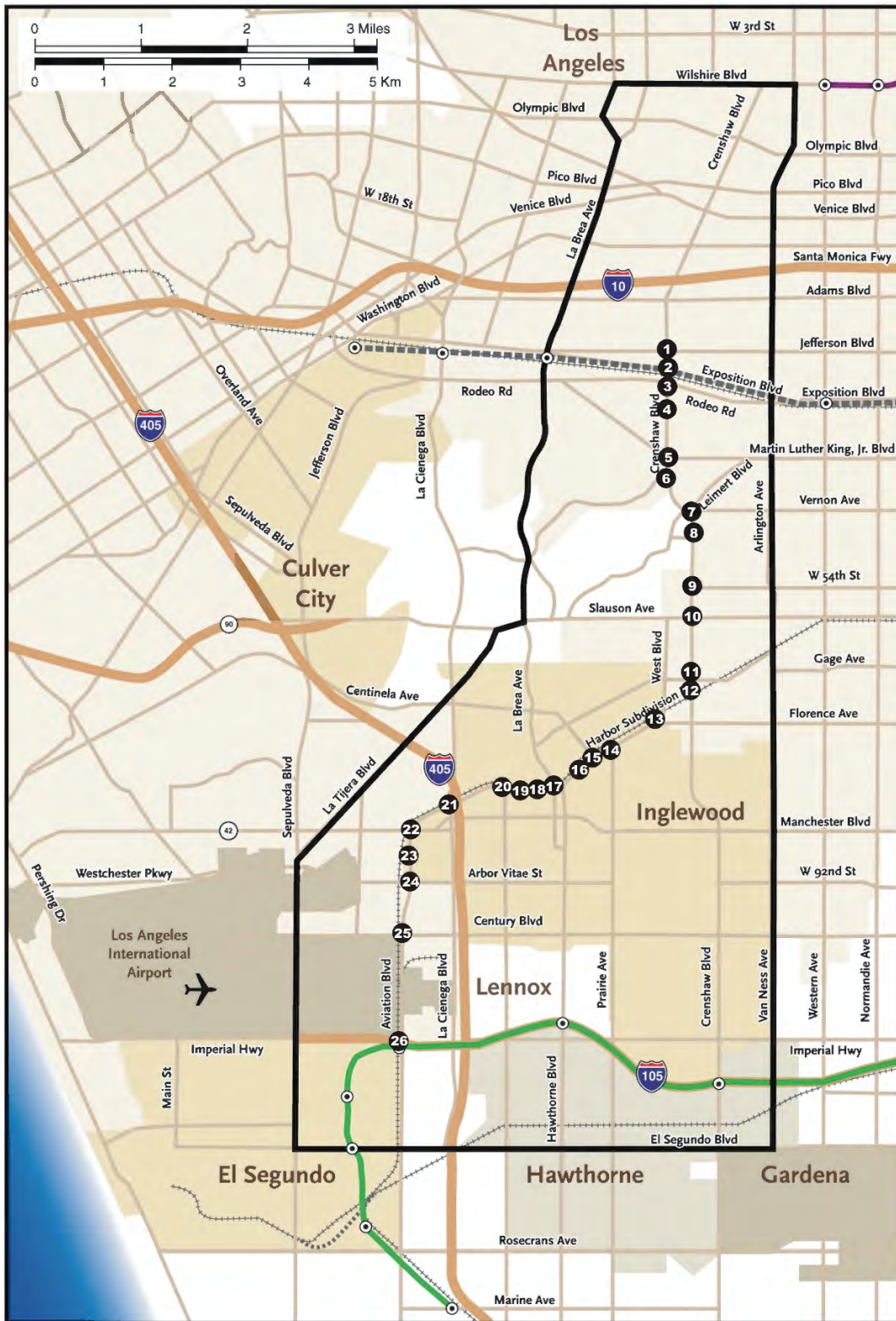
Figure 3-4. Analyzed Intersections Affected by the LPA