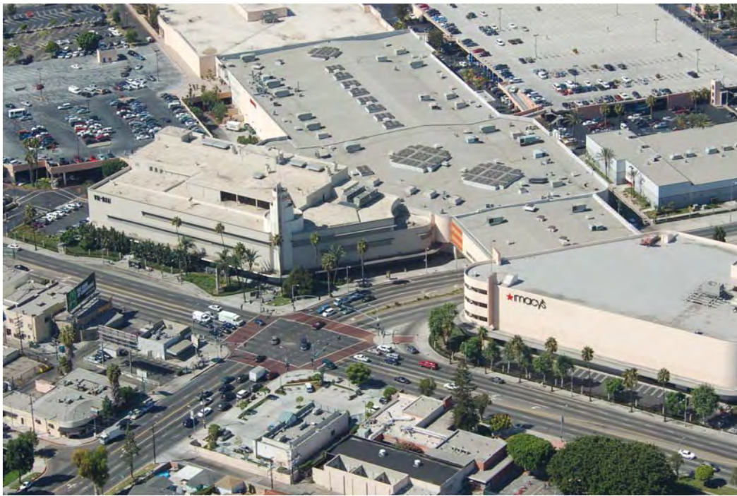
Figure 3-6. Baldwin Hills Crenshaw Plaza and Off-Street Parking