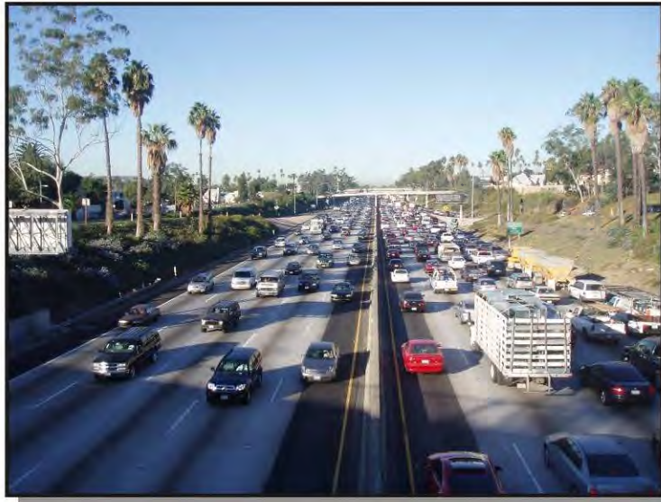
On the I-10 looking west from Crenshaw Boulevard, the commute toward the West Los Angeles area is particularly congested during the AM Peak Period.