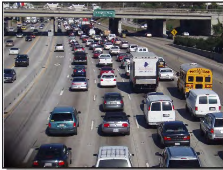
During the AM Peak Period, the commute northbound on the I-405 towards the West Los Angeles area, is more congested than the southbound commute.