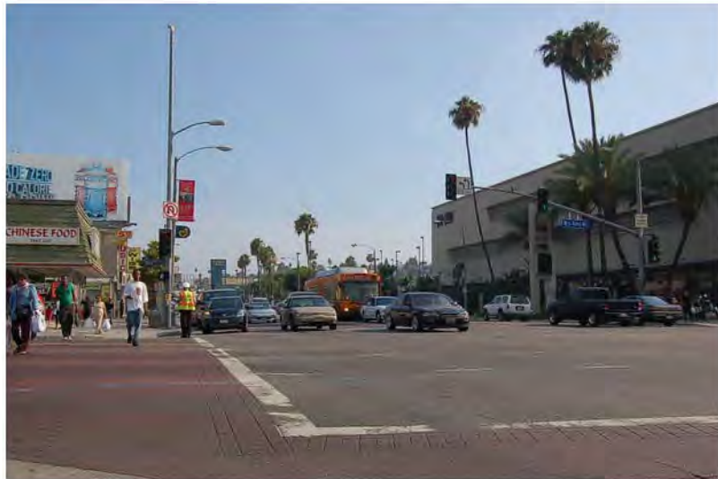
Figure 3-8. Pedestrian Activity at the Intersection of Crenshaw and Martin Luther King, Jr. Boulevards

The pedestrian system varies across the study area depending on the density, mix of land uses, and vehicular circulation patterns. The entire street network, excluding the urban freeways, is generally considered open to pedestrian traffic, either on the sidewalks or road shoulders. Figure 3-8 shows pedestrians crossing at an enhanced pedestrian