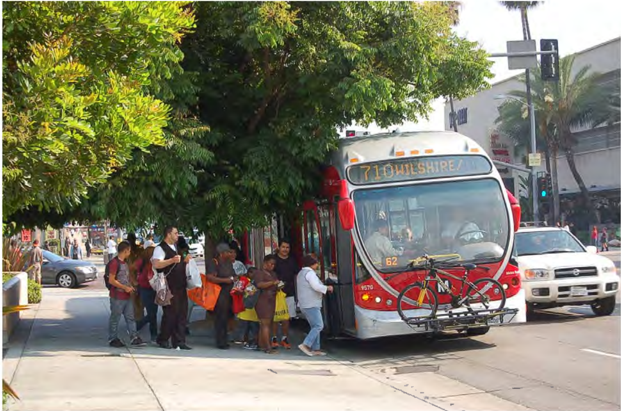
Figure 3-1. Metro Rapid on City Streets