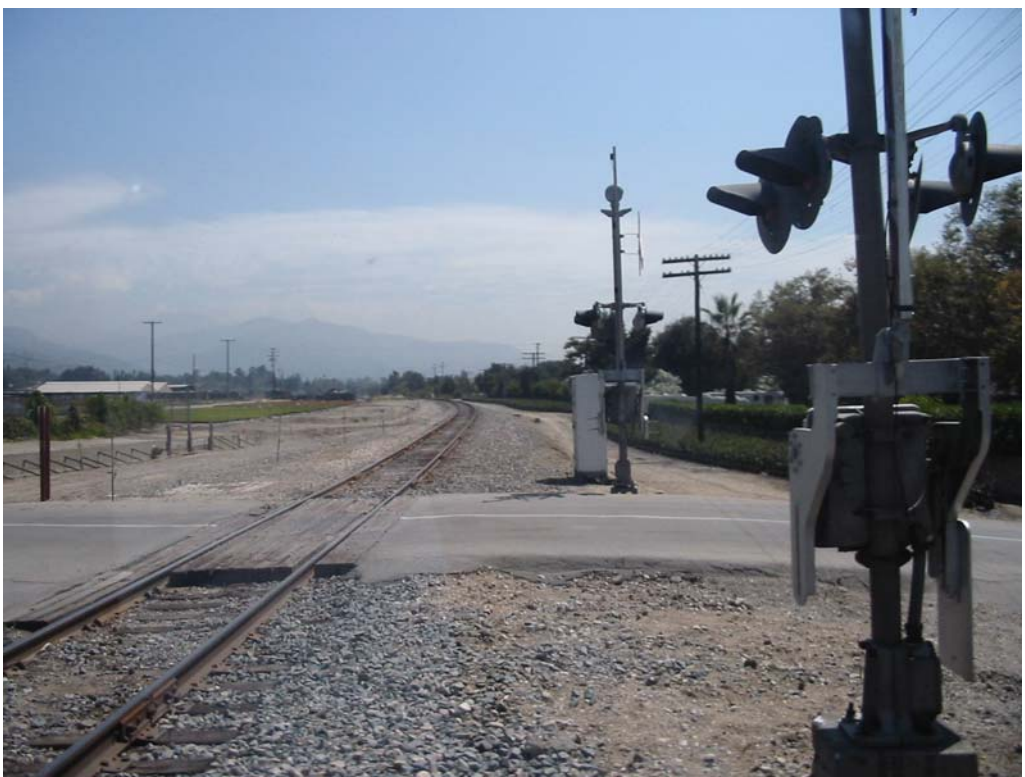
Figure 3-17.10: Azusa, View E (Adj. Nursery) toward Azusa-Citrus Station Site