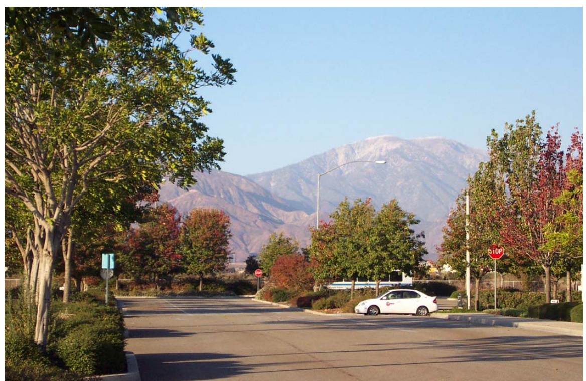
Figure 3-17.24: Montclair TransCenter, View N