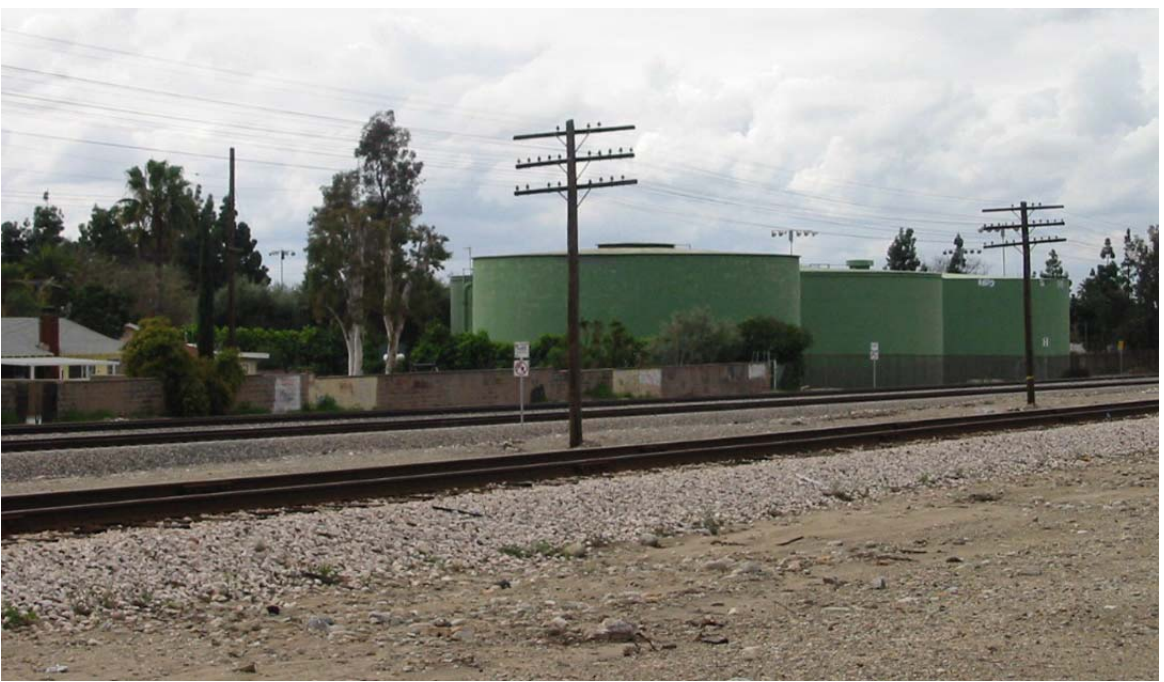
Figure 3-17.20: Pomona, Railroad Right-of-Way, Rear of Park, View SW