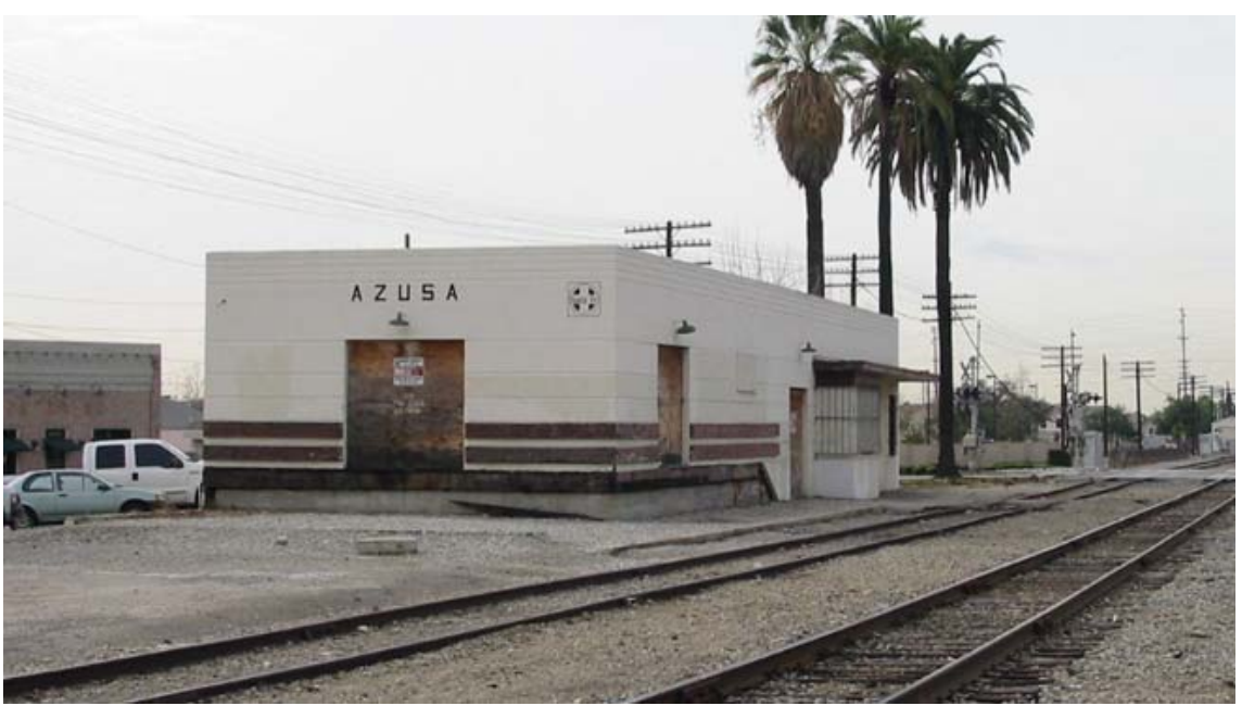
Figure 3-17.8: Azusa, ATSF Railroad Depot, View SW