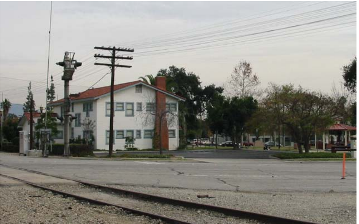
Figure 3-17.9: Azusa, View SE from Railroad Right-of-Way at Alameda