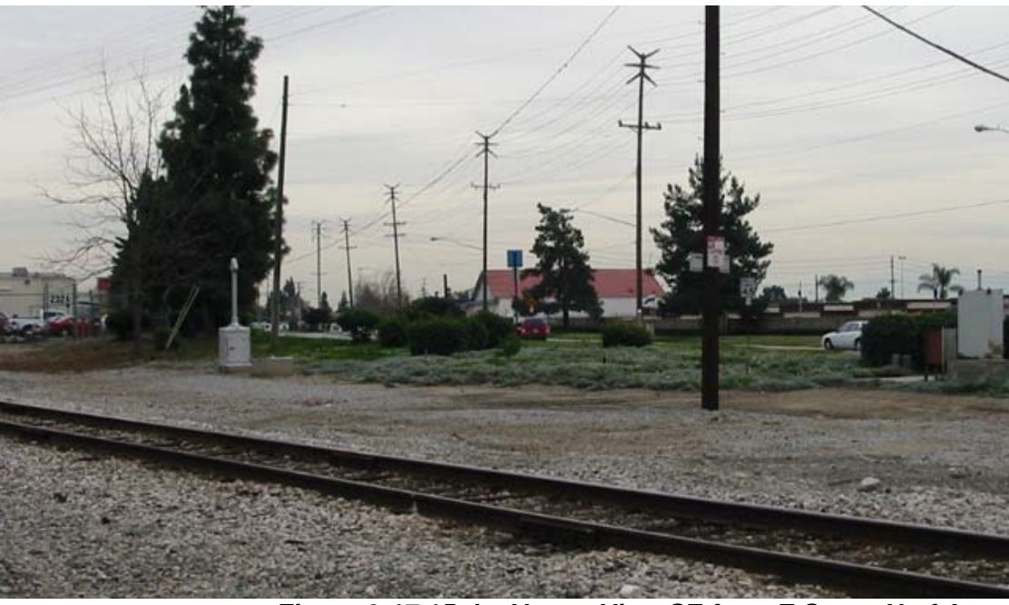
Figure 3-17.15: La Verne, View SE from E Street N of Arrow Highway