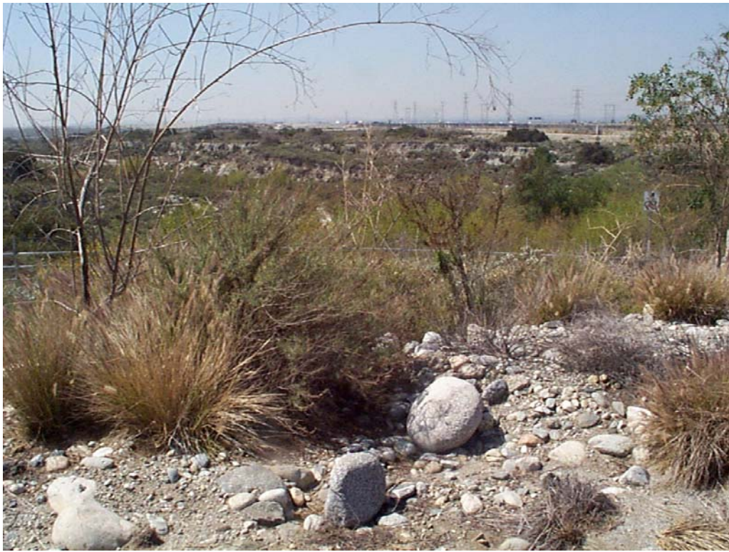
Figure 3-17.6: Irwindale, Overview San Gabriel River Basin