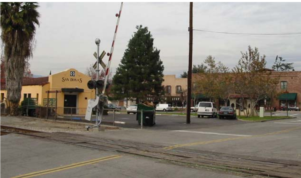
Figure 3-17.13: San Dimas, ATSF Depot and Old Business District, View SW

In this urbanized setting, single-family residential and educational institutions are the primary uses west of D Street, including Damien High School and La Verne University. At about D Street, the old La Verne business and residential district adjoins the railroad right-of-way (north). Numerous buildings in this setting although outside the APE are locally listed historic resources. The historic district, generally located one block north of the railroad right-of-way, consists chiefly of twentieth century buildings constructed at different time periods. The identifying features that define the historic district are outside the APE and would not be adversely affected by the proposed project, which is potentially proposed at E Street and Arrow Highway—a location that is not visually sensitive (Figure 3-17.15). Along the southern border of the railroad right-of-way along Arrow Highway is a non-continuous row of Deodar cedar ( Cedrus deodara ) trees planted to provide visual screening of the existing railroad right-of-way (Figure 3-17.16).