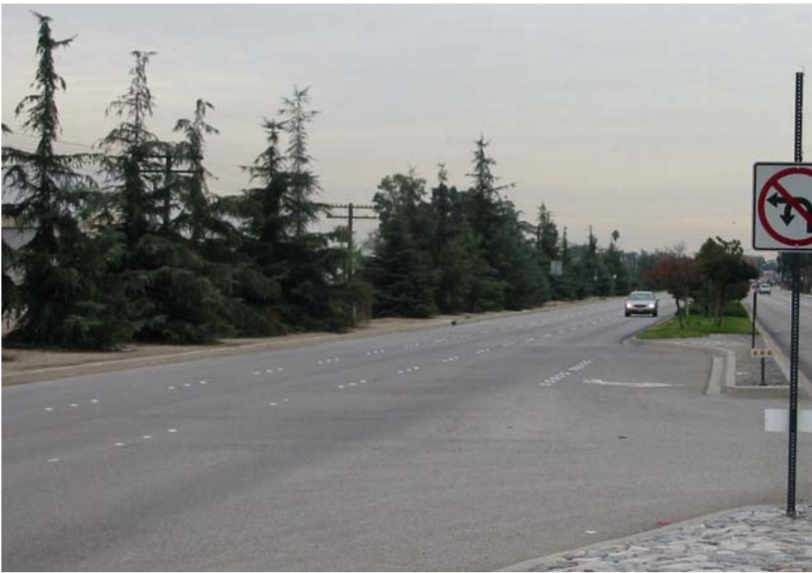
Figure 3-17.16: La Verne, Row of Deodar Cedars, N Side of Arrow Hwy., View E