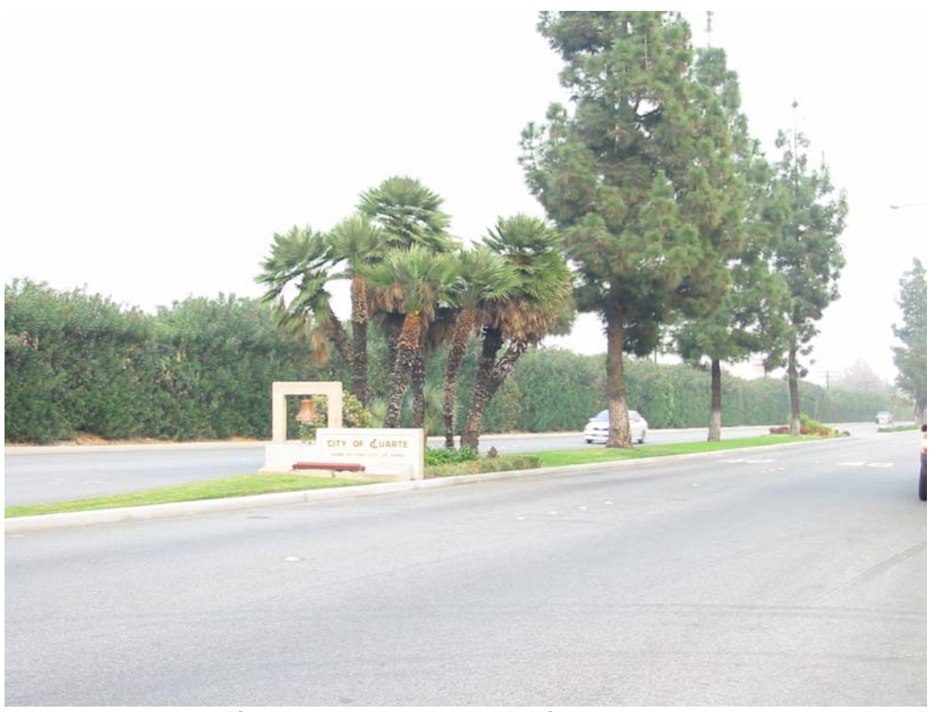
Figure 3-17.5: Duarte, Typical Oleander Hedgerow, Duarte Road, View NE