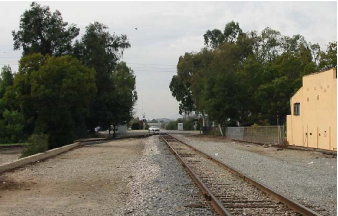
Figure 3-17.14: San Dimas, View NW from ATSF Depot to LRT Station Site

The proposed Station site is shown in Figure 3-17.17 . The City of La Verne "Arrow Corridor Specific Plan" (per the June 2001 update) specifies the Deodar cedar tree and Crepe Myrtle as the Master Plan street trees along the north side of Arrow Highway. The tree row is a significant visual resource because of its role in screening it serves to screen the railroad corridor.