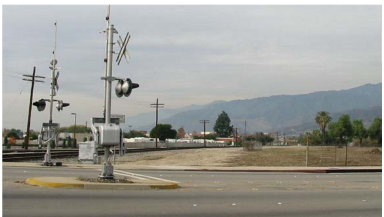
Figure 3-17.11: Glendora, Setting of Proposed Station, View W from Glendora Ave.