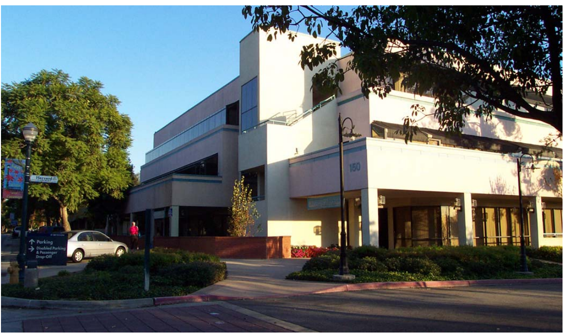
Figure 3-17.21: Claremont, Office Development Adjoining Railroad Station, View E