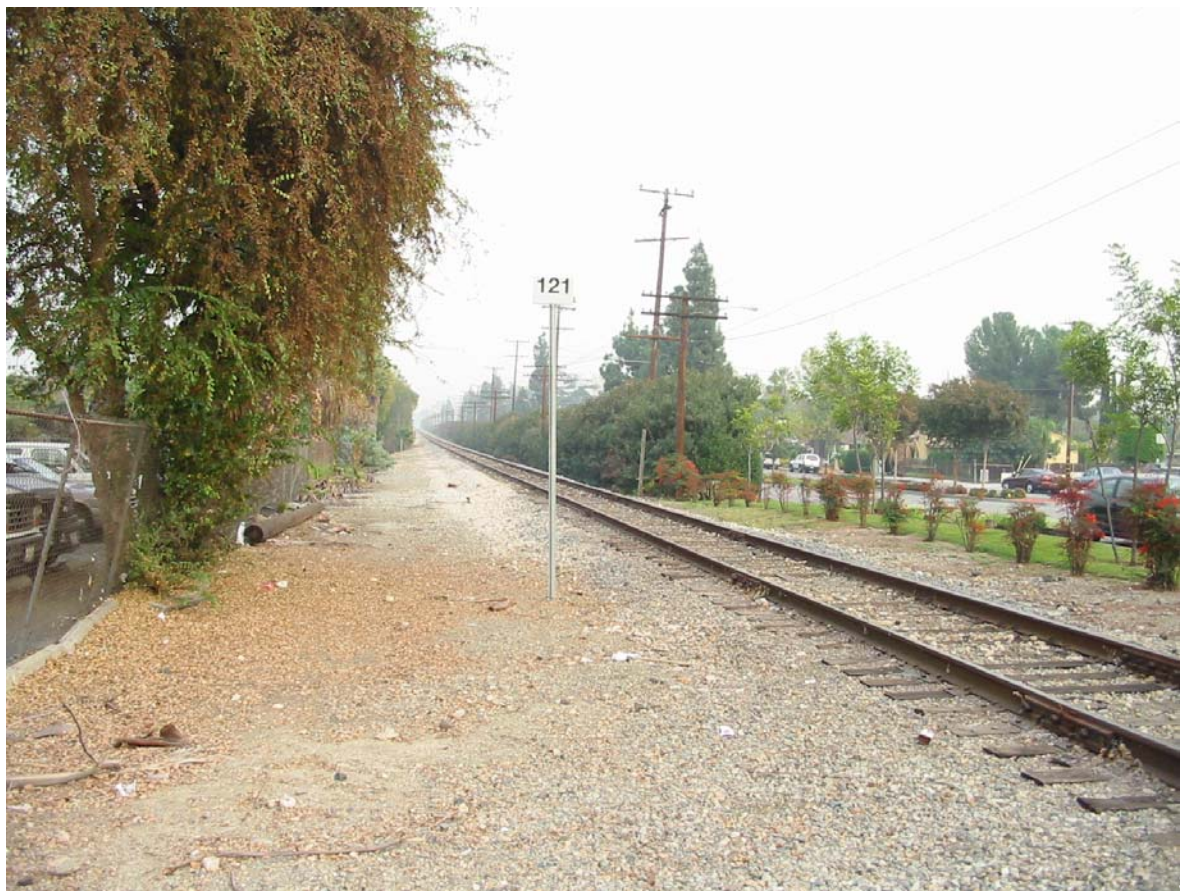
Figure 3-17.25: Duarte, Railroad Landscape Screening, E. at Buena Vista Av.

Although no design mitigation for project elements is required, in accordance with Construction Authority policy, project conformance with City design guidelines (viz., station architectural treatments, color selection, traction power substation architectural treatments) would occur.