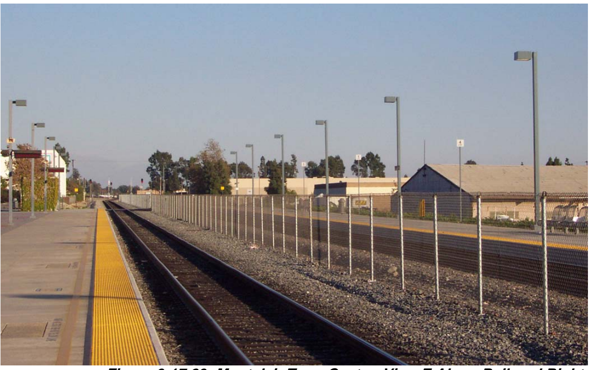
Figure 3-17.23: Montclair TransCenter, View E Along Railroad Right-of-Way

The proposed alignment for the project traverses an urban setting developed with a diverse range of uses in which neighborhood- and community-scale retail shopping centers, industrial, rock quarrying/water catchment, and the Montclair TransCenter (multi-modal transit center)(circa 1990) are the chief land uses ( Figure 3-17.23 ). The Montclair TransCenter property extends from Monte Vista Avenue (west) to Central Avenue (east, between the ATSF/BNSF Railroad right-of-way and Richton Street, north). It is developed with bus lanes, bus passenger shelters, a large surface parking lot, and a Metrolink train station. To the north is a large expanse of vacant chaparral dotted with river rock. In general, this neighborhood in Montclair is not aesthetically significant. There are no designated/proposed scenic corridors/vistas and no identified historic resources in the vicinity of <del>either the North Station or South Station</del>the station site. Almost all the development adjacent to the proposed project rights-of-way dates from the recent past and is unimportant in architectural and landscape terms ( Figure 3-17.24 ). Medium-value views of the San Gabriel Mountains (north)—the only aesthetic resource in this setting—would remain unimpaired by the proposed project.