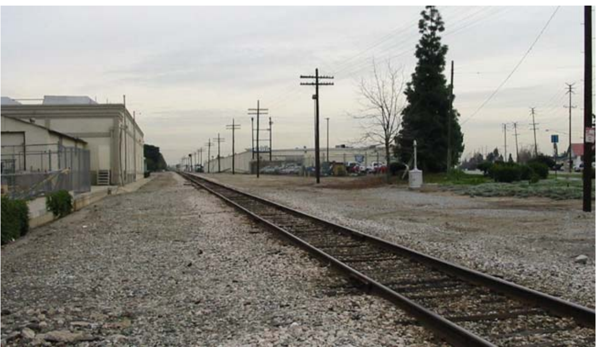
Figure 3-17.17: La Verne, View E along Railroad Right-of-Way from E Street