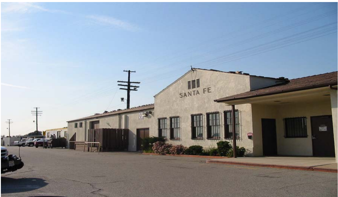
Figure 3-17.19: Pomona, ATSF Railroad Depot (at Garey Avenue)