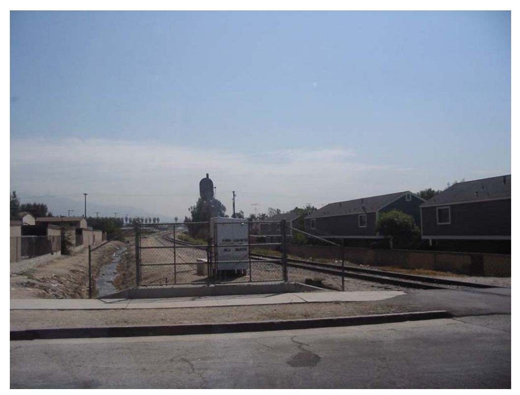
Figure 3-17.3: Monrovia, Railroad Right-of-Way, SE from Fifth Ave.

in its crossing over the railroad right-of-way and the I-210 (Foothill Freeway). It is bordered on the east by an extensive industrial park developed with large tilt-up concrete warehouses and manufacturing buildings that appear to date chiefly from the 1980s and 1990s. The streets are planted with Chinese elm and pine parkway trees. This setting as a whole does not possess high visual quality. On the border of Santa Fe Dam, to the west, is another visually dominant feature in this setting: a large freeway interchange that connects the 210 Freeway and 605 (San Gabriel River) Freeway (Figure 3-17.7). The San Gabriel River/Flood Control Basin is not designated or proposed for designation as a scenic corridor, but does afford medium-quality views of the San Gabriel Mountains (north).