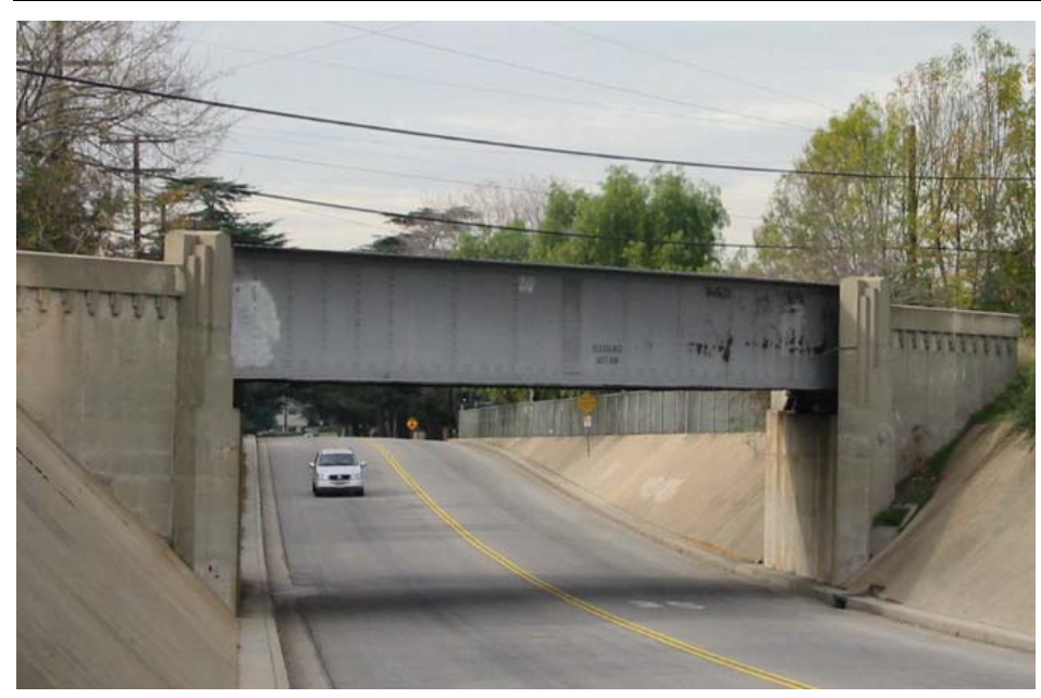
Figure 3-17.1: Arcadia, Railroad Crossing, at W. Colorado Blvd.