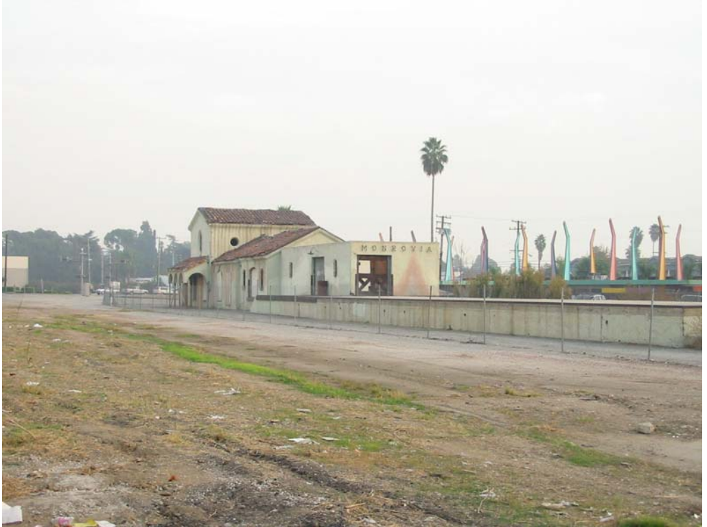
Figure 3-17.4: Monrovia, ATSF RR Depot, View E. Toward Myrtle Ave.