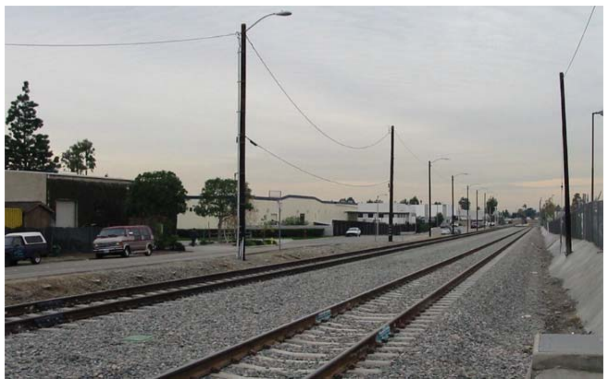
Figure 3-17.18: Pomona, Railroad Right-of-Way, View W to Metrolink Station

view corridors, or scenic vistas in this neighborhood. Because of the trees and dense placement of buildings in Claremont Village there are only fleeting views of the San Gabriel Mountains (north)—an esthetic resource. The project poses effects to visual resources due to changes to the existing Metrolink improvements at Claremont Station. Conformance with local design standards in the architectural/landscape design treatment would be accorded the proposed parking structure, and LRT station. Nor would LRT-related improvements (viz., catenary, safety fencing) potentially proposed along the railroad alignment would not strongly contrast with the setting or bring a dramatic departure, in design terms, from the railroad's historic/on-going function.pose an adverse/significant effect to visual resources. Mature trees on the south side of the rail right of way at the Claremont Depot would be removed if Station Option A were implemented, since the right of way would need to be expanded by about 30 feet to the south.