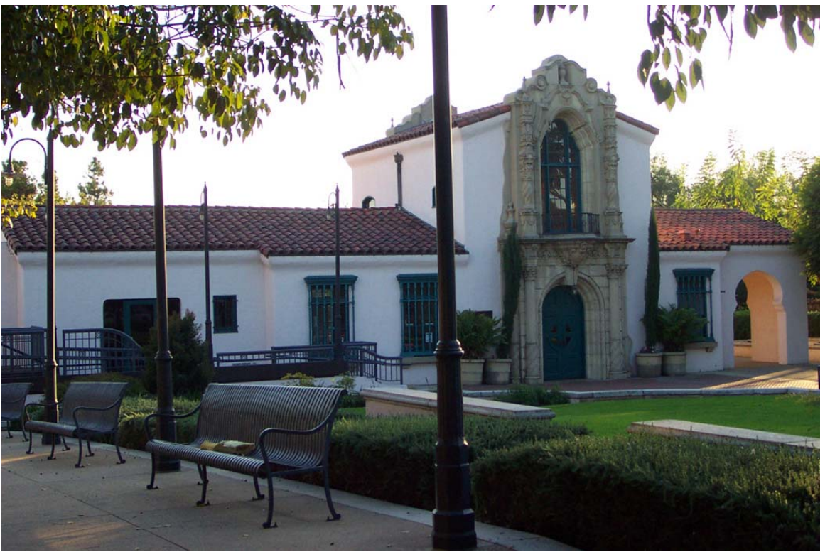
Figure 3-17.22: Claremont, ATSF Railroad Depot