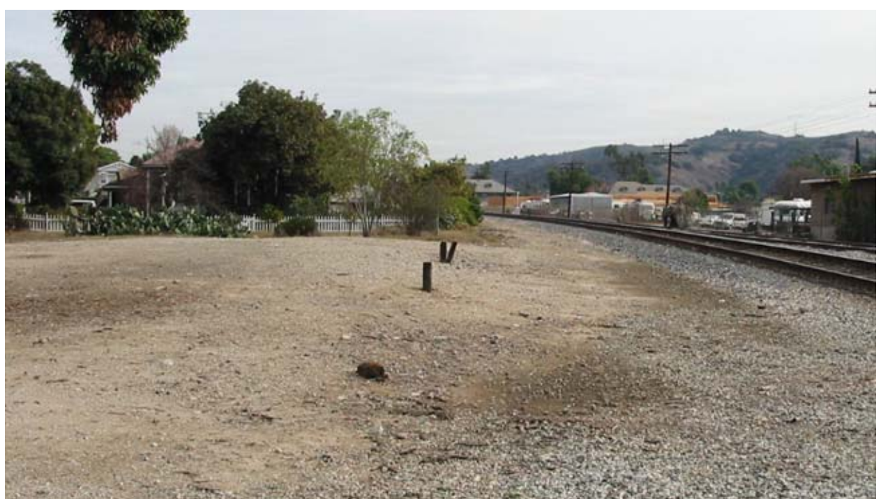
Figure 3-17.12: Glendora, View E. across Glendora Avenue of Neighborhood Adjoining Proposed Station