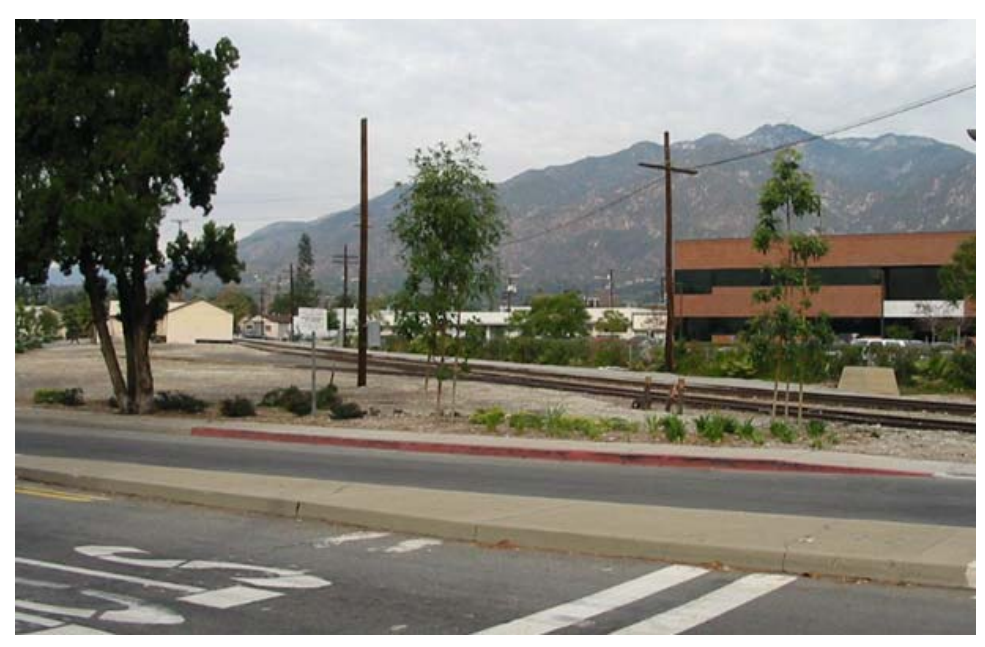
Figure 3-17.2: Arcadia, Proposed Station Setting, View W. Across First Street