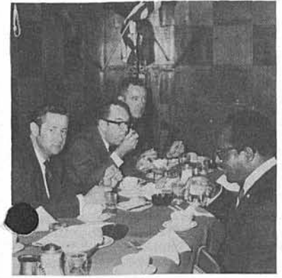
Union reps on hand to honor operators.