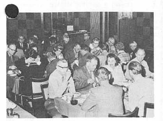
Wives join husbands at award luncheon.