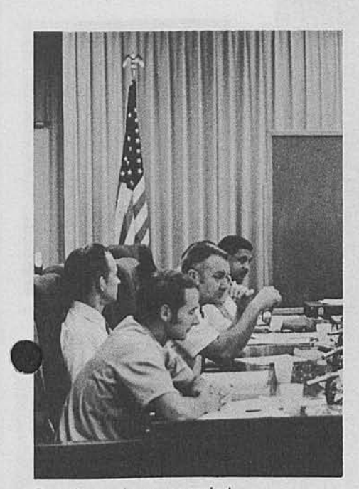
Question and answer period.