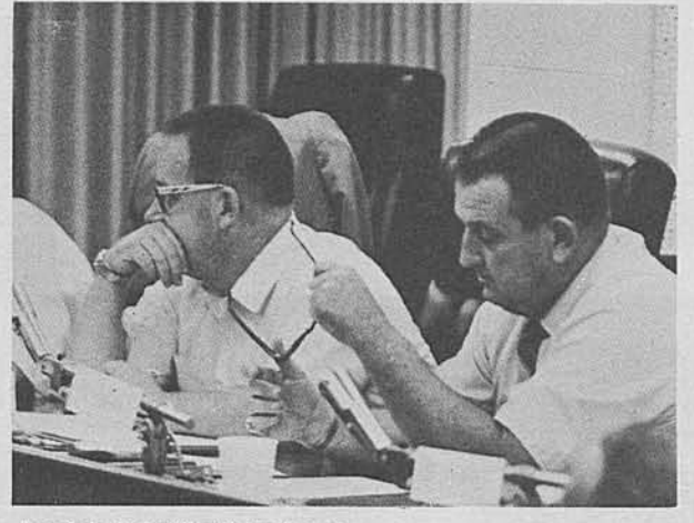
A point of clarification please.