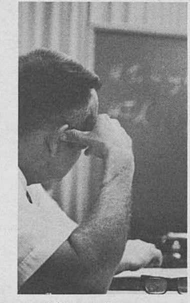
Interest is automatic.

The Transportation Administration Certificate Program is a special two-year course of study designed to provide outstanding employees an opportunity to prepare for managerial positions throughout the District. The first of its kind in the transit industry, the program consists of eight quarters of instruction with a different course being taught each quarter. The courses are: Busi-ness Communications; Managerial Psychology; Elements of Industrial Relations; Community Relations; Manage-ment Accounting; Business Finance; Organization and Management; and the Legal Aspects of Public Transportation. The Special Courses Program was created to meet RTD's immediate need for help in specific areas. All District employees are eligible to enroll in classes such as Principles and Methods of Supervision, Functions of Public Transportation and Written Communications. Within the Special Courses Program are three special classes designed for employees who are supervisors or managers. These classes are: Managerial Psychology; Elements of Industrial Relations; and Organization and Management. Another course, Survey of Business for Secretaries, was established for RTD's secretarial force.