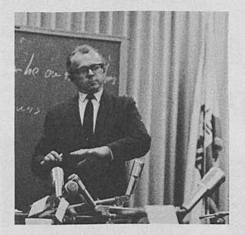
Clarifying a student's question.