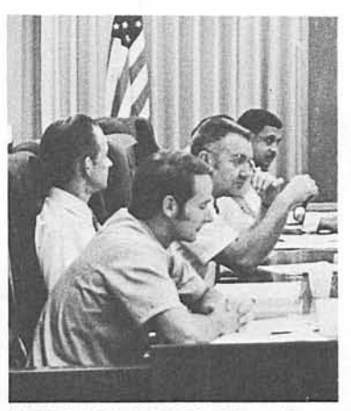
TRAINING PROGRAM .... 7