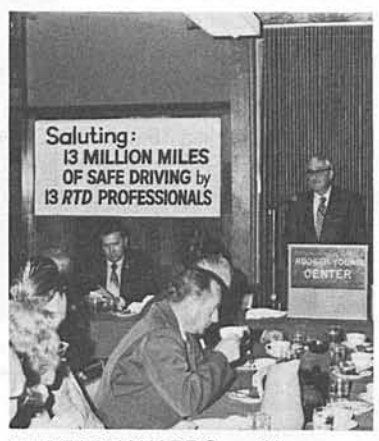
25-YEAR AWARDS ... 10