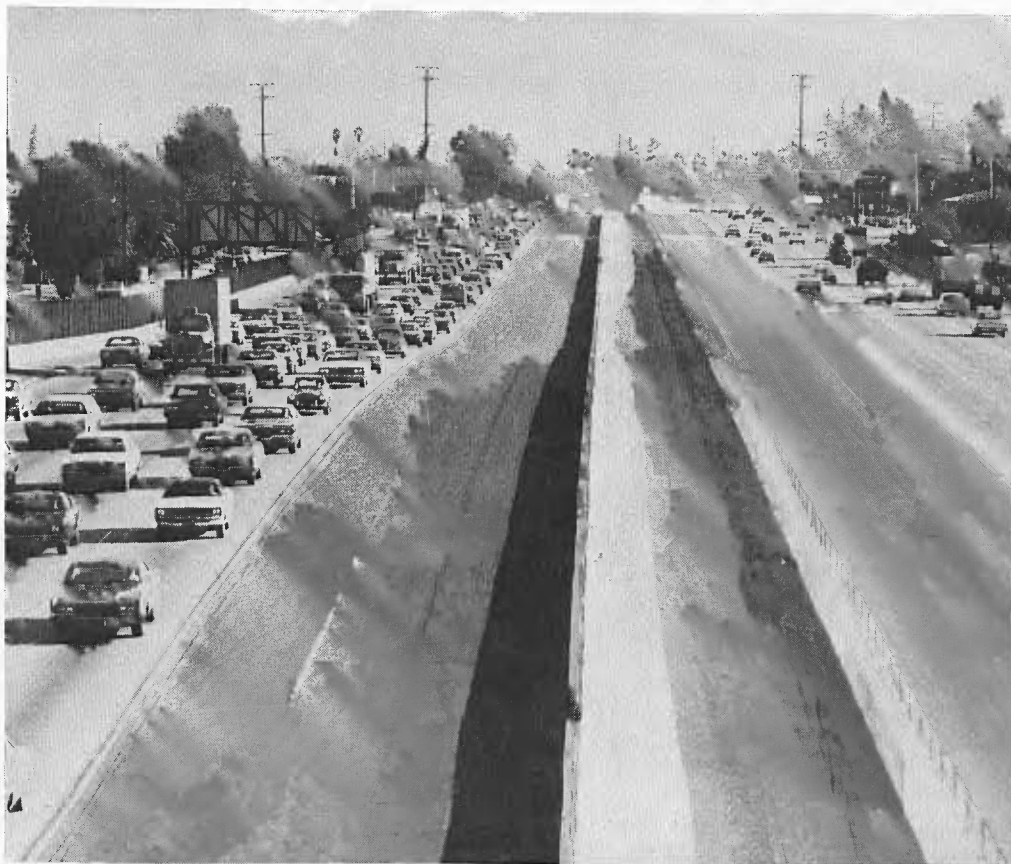
ROLL 'EM —Practice runs on the first phase of the El Monte-Los Angeles Busway are set to begin this month, with regular service originating east of El Monte to begin in December. The entire system, including three passenger stations, is scheduled for completion in spring 1974.

Other celebrants at the dedication included Bouquet Canyon merchants and tract home residents of both Bouquet and Seco Canyons.