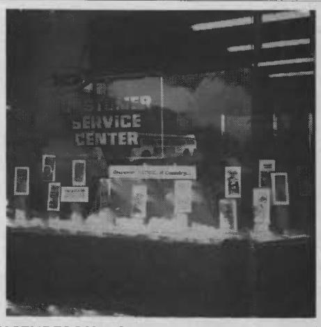
PICTURESQUE SCENE — Layout Artist Al Segal is combating the eye pollution problem in Hollywood. He developed a billboard-type display for the District's Hollywood Ticket Agency which depicts places to go on the "Extracar."

New assignments will be effective April 8.