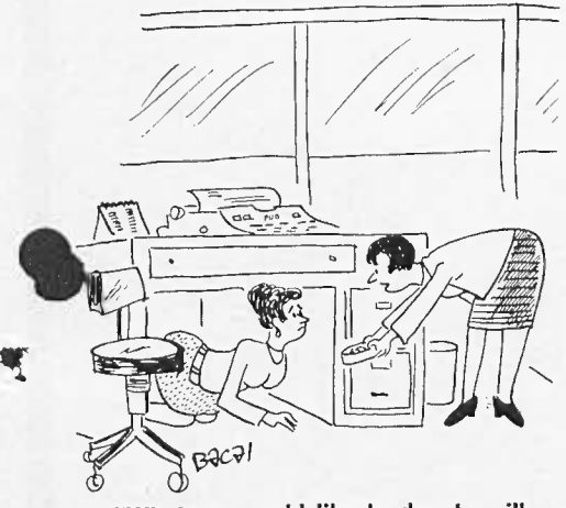
"Whatever you'd like to donate will be fine."

Seems as though there must be a little bit of poet in everyone, huh?