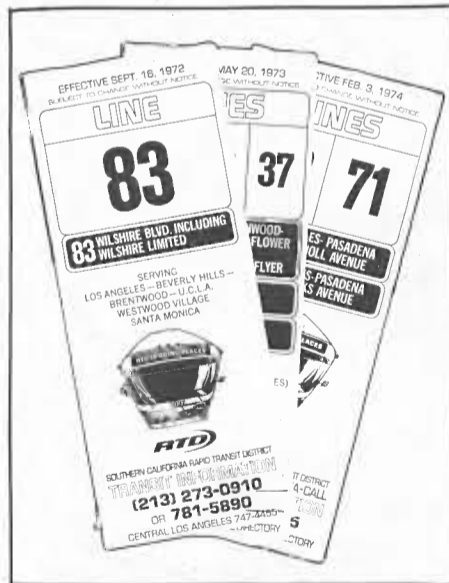
New-look for schedules

By featuring the line numbers prominently near the top of each cover, the schedules are easier to identify, and offer less confusion for bus patrons and RTD personnel who handle them.