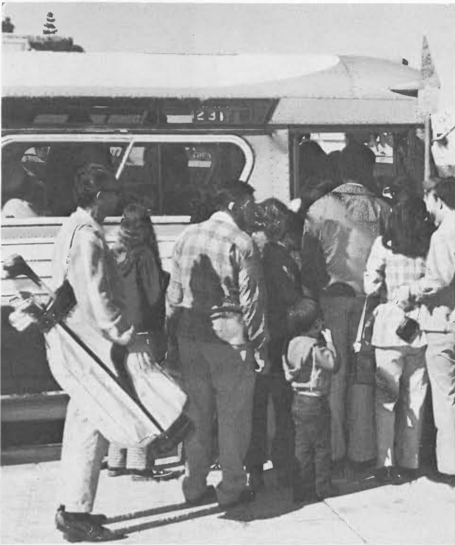
REDUCED FARES induce a wide variety of new bus riders, as RTD's 10-cent Sunday fare has proved. Division 10's Line 23 has even drawn sportsmen traveling to Griffith Park for a Sunday morning round of golf. Weekday patronage is expected to soar as a result of the flat fare within Los Angeles County. At press time, the final details of the program were not known. A special employe information program is being assembled and will be presented to RTD personnel as soon as the program is finalized. Employes may dial Ext. 485 or 486 and hear a recorded message for the latest information available regarding the experimental 25-cent flat fare program.

If you thought a dime went a long way toward improving RTD's lot in life, you'll want to stick around and see what a quarter might do.