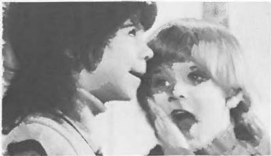
Sparky (right) stars in latest McDonald's TV commercial