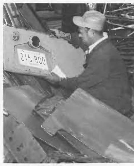
spects spare parts purchased with the 14 Fort Worth buses.