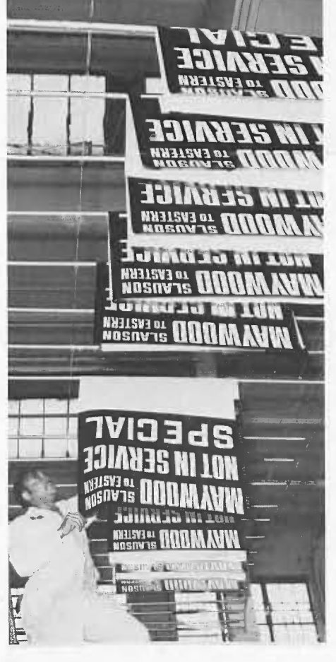
As new services are added during the 25-cent flat fare experiment, new inserts for headsign curtains must be made. FRED WASHING-TON takes dry insert down to splice it into updated headsign.