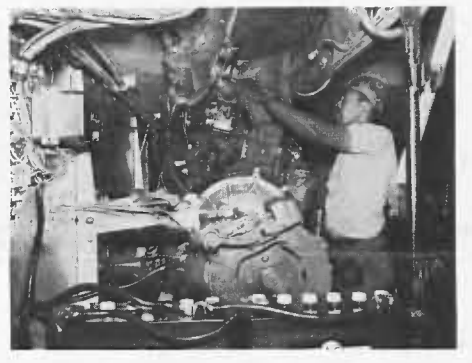
In the last step of engine work, WILLIE REESE hooks up a freshlymounted gasoline engine in a former Pomona Valley coach for its first run with the reconditioned engine.