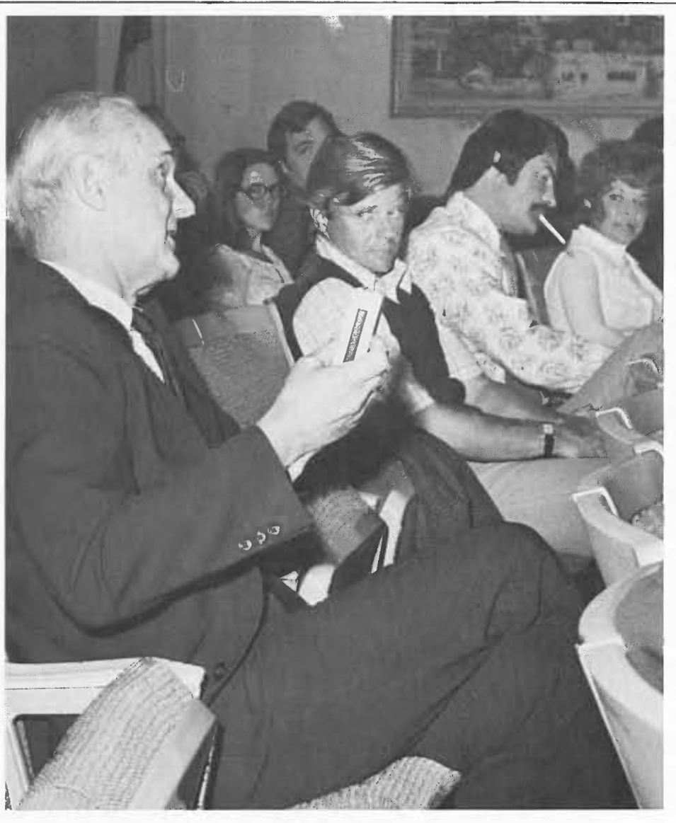
AN INTERESTED citizen voices his opinion on transit improvements during the April 18 community meeting in Long Beach.

Thursday, May 16 — 7:30 p.m. La Mirada City Hall, 13700 La Mirada Blvd., La Mirada.