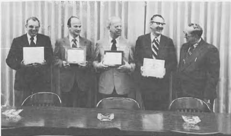
SCRTD transportation managers above display National Safety Council (NSC) plaques awarded their divisions for achievement in safety by the Los Angeles Chapter of the NSC. The awards, for achieving safe-driving records in competition with other California transit properties, were based on traffic accidents for million miles traveled during the 1974 fiscal year.

The new division, which is located at 190th St. and the Harbor Freeway, began operation with 45 buses and 25 maintenance personnel and will be increased greatly in the next several months when the South Central Grid System, of which Division 18 will be an important asset, becomes fully operational. At the present time, Lines 353-358, 360 and 362 operate out of the Division.