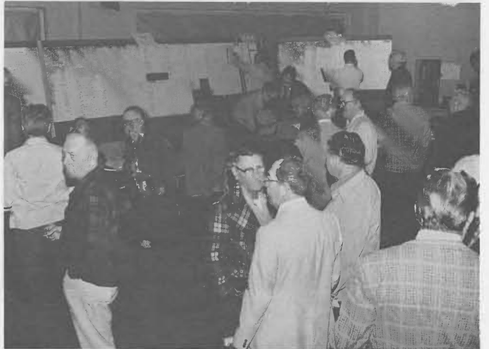
Operators wait patiently for their turn to bid during the first hour of this year's general system shake-up. While waiting, they also got a chance to see old friends and socialize out of uniform.