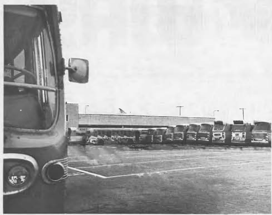
A view of Division Six from Main St. in Venice.

This is the first of a series of articles profiling major RTD operating units. A major unit will be described in each forthcoming issue of Headway to inform readers of the interdependence among parts of RTD's total operation.