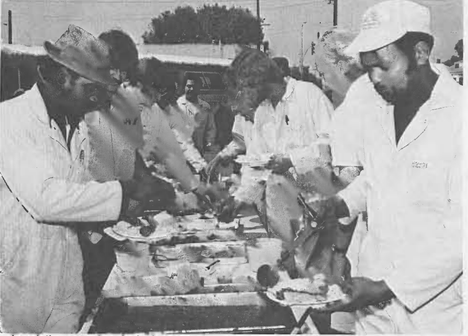
Lunch time was also picnic time at the South Park Shops during the week of March 16. Each noontime during the week, a group of RTD employees from headquarters who were making the RTD facilities tour and a group of employees at South Park Shops got a chance to meet each other and enjoy a specially catered buffet luncheon.

The tour returned to 1060 So. Broadway, and although it had been a full and exhausting day, everyone agreed that the tour had been a worthwhile and informative experience.