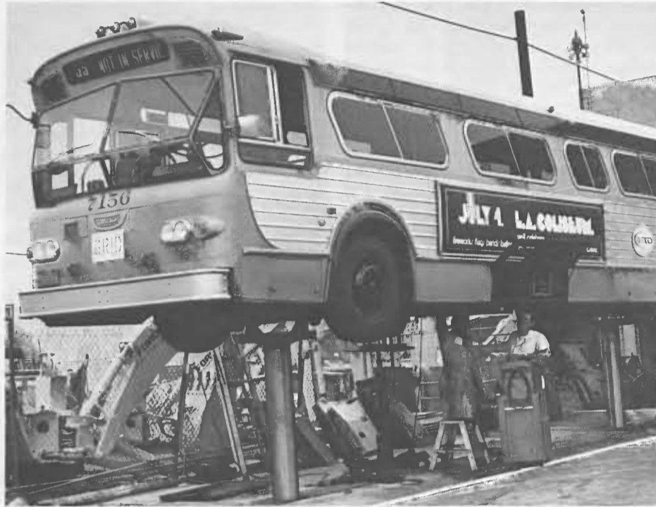
NOT IN SERVICE—This 35F Freeway Flyer isn't flying at the moment, though it is "up in the air."